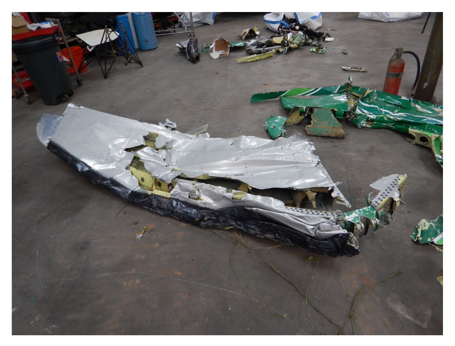
Photo 8 – View of a right side section of the horizontal stabilizer