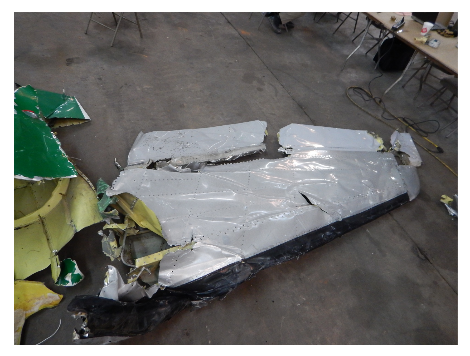
Photo 9 – View of a left side section of the horizontal stabilizer and damaged elevator sections