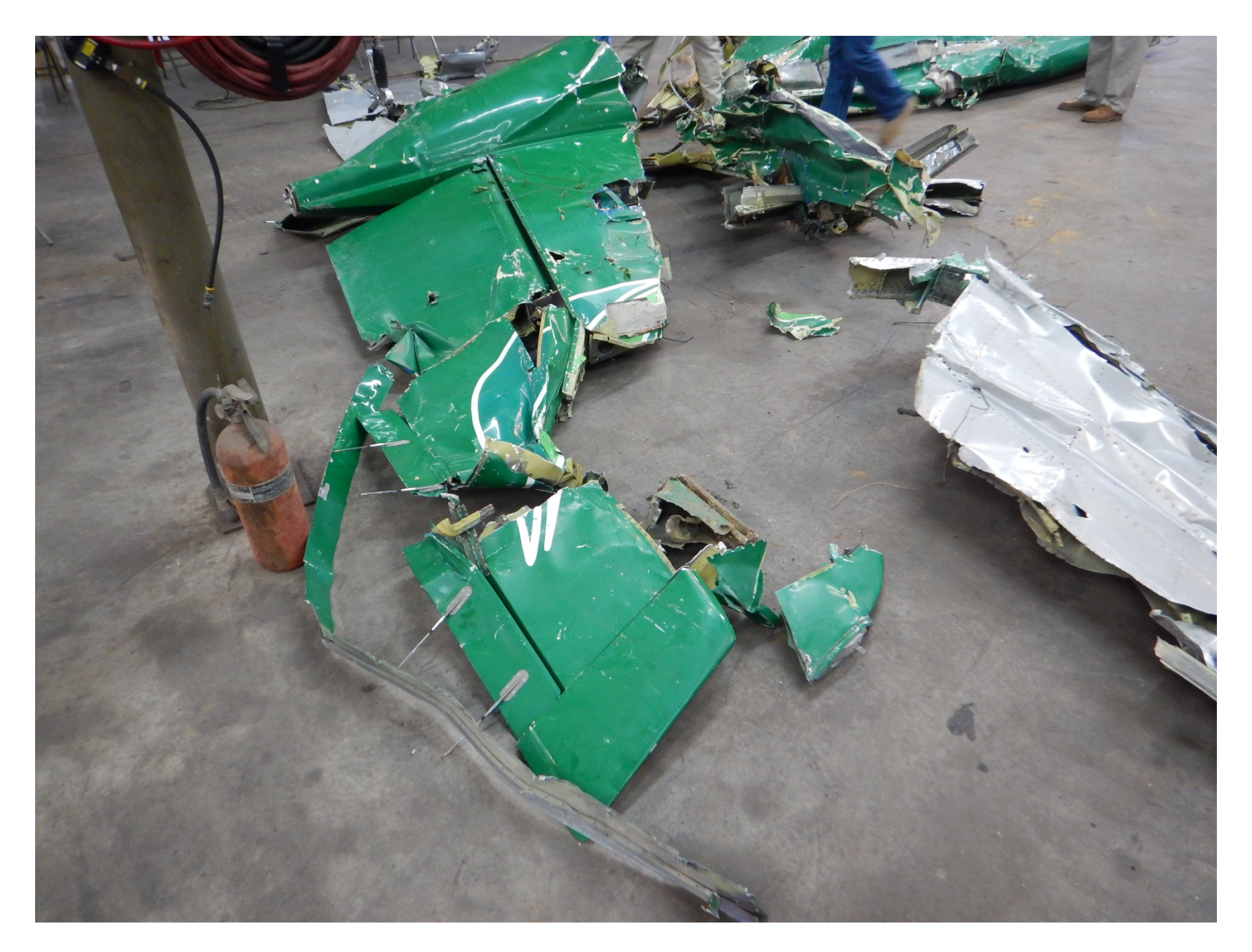
Photo 6 – View of a section of the vertical stabilizer and rudder attached to part of the tail section