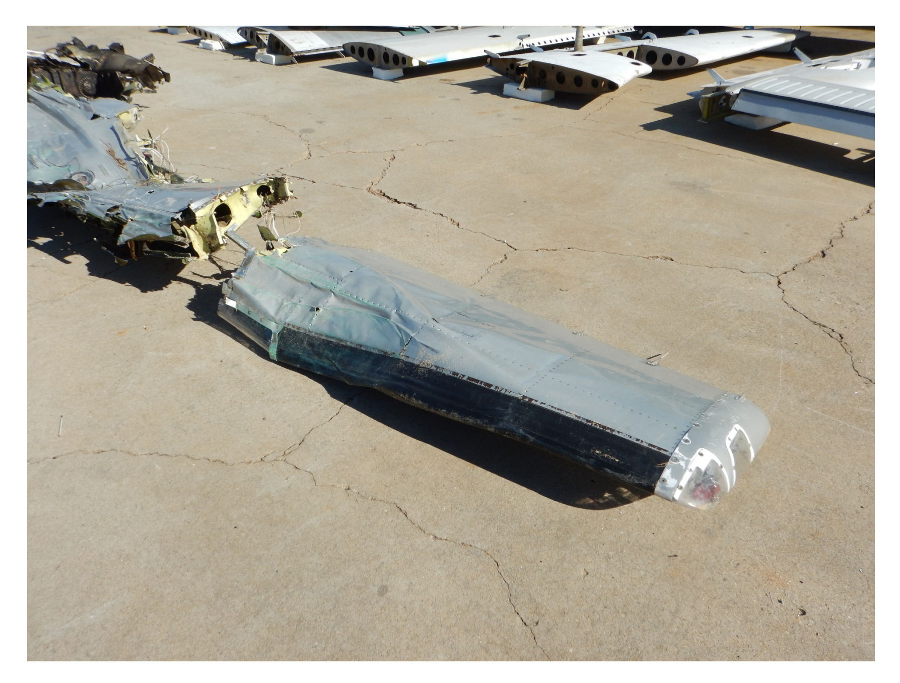
Photo 11 – forward view of outboard and inboard section of the left wing