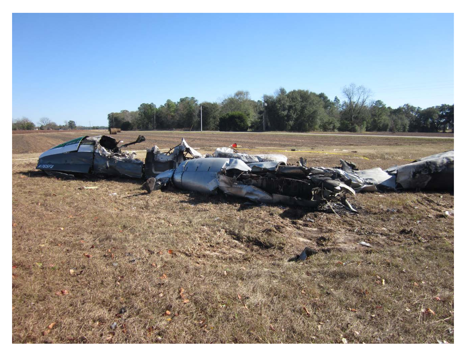
Photo 4 – View of left side of fuselage and left engine fire damaged and crushed