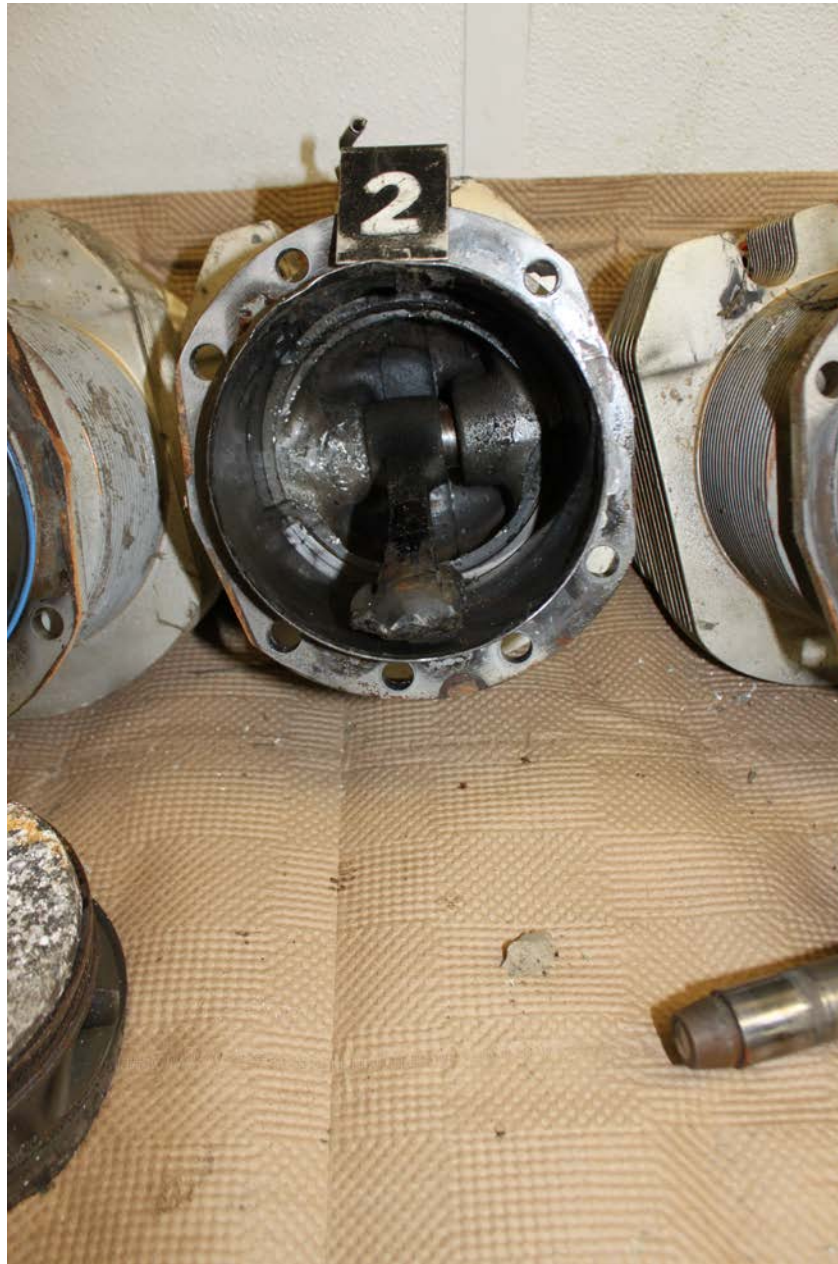
Photo 11 – Left engine number 2 piston, cylinder and connecting rod