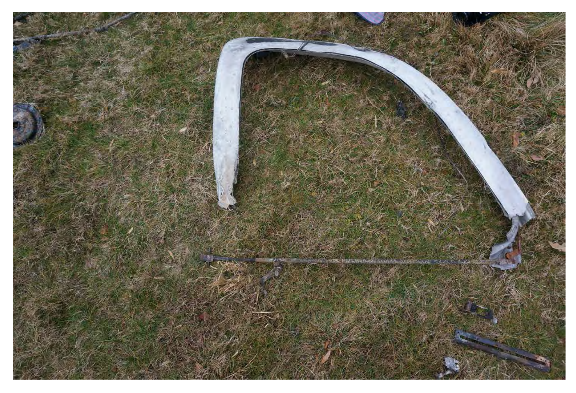
Photo 18 - Forward Cabin Door Locking Mechanism Components – Exterior View