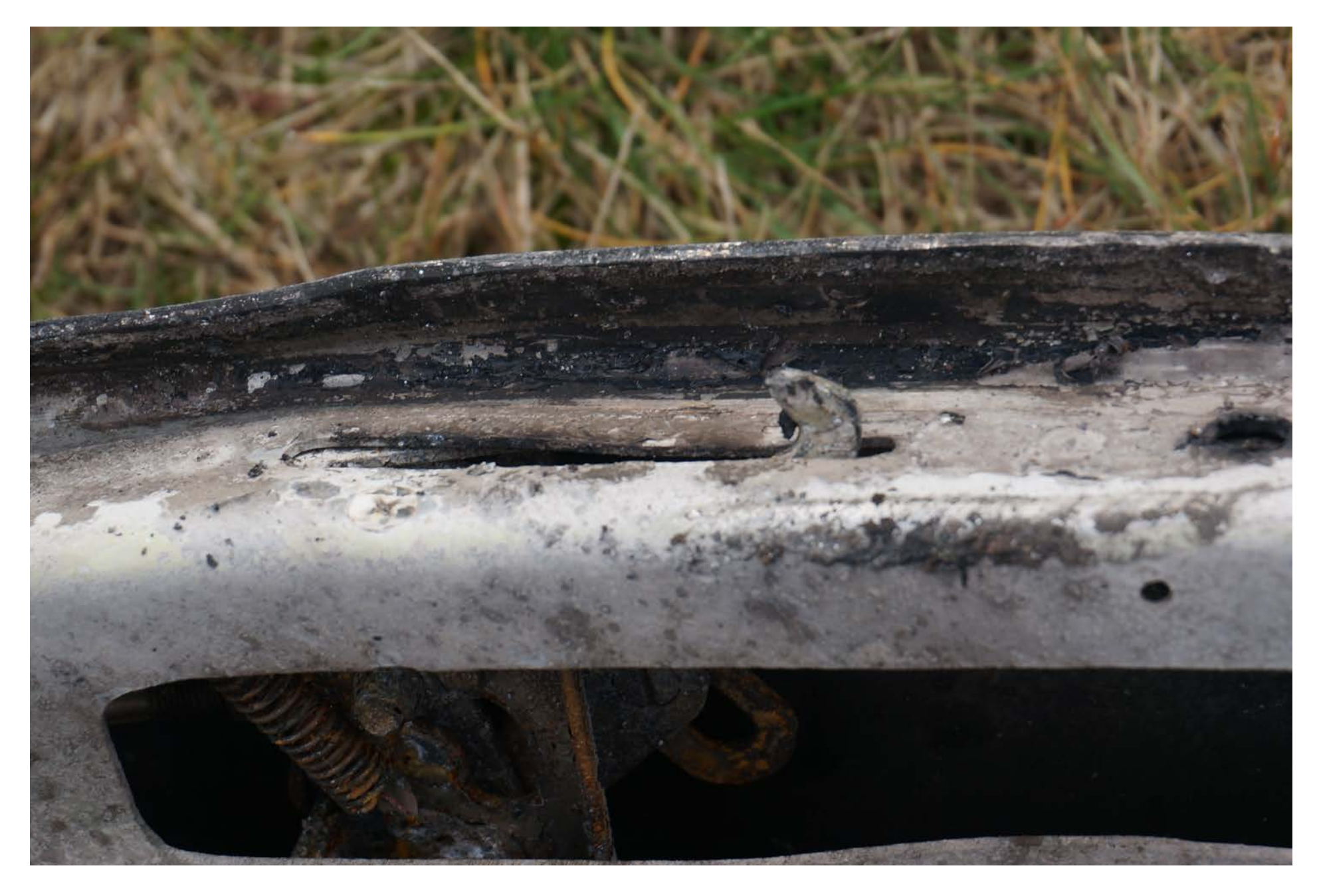
Photo 16 – Close Up of Upper Door Latch After Removal of Door from Wreckage