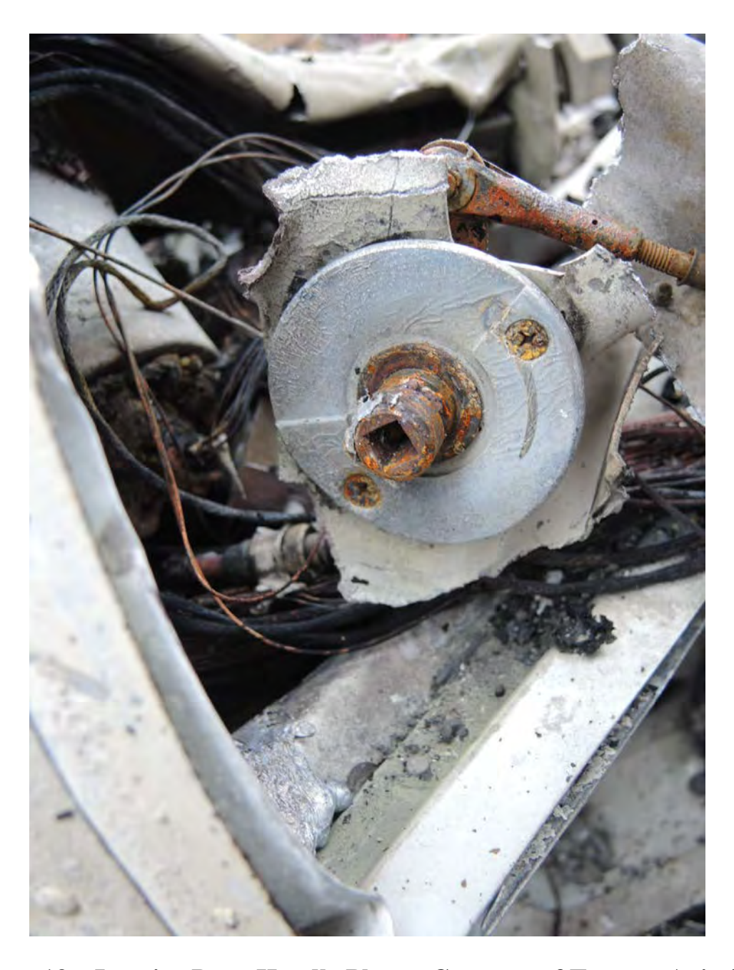
Photo 13 – Interior Door Handle Plate – Courtesy of Textron Aviation