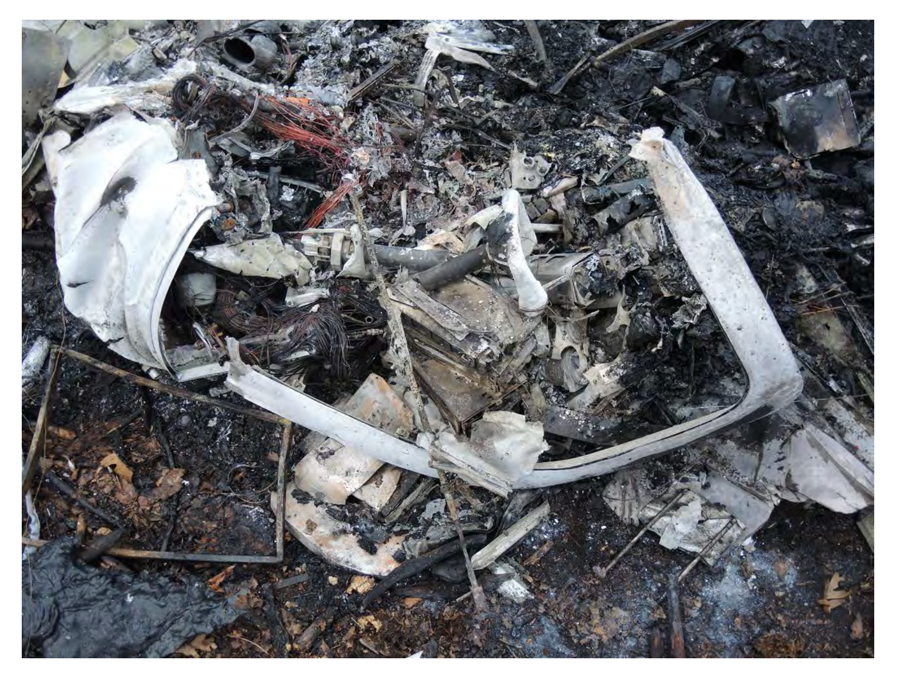
Photo 11 – Forward Cabin Door Upper Frame (Exterior View)