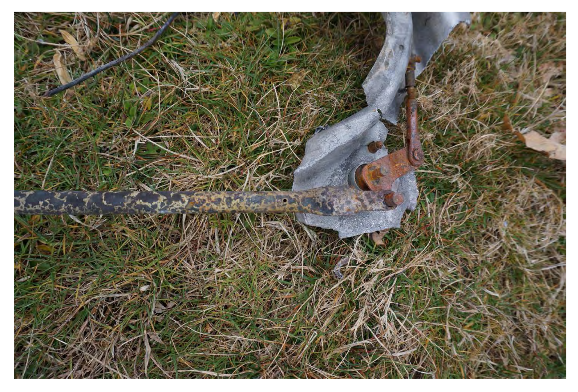
Photo 19 – Close Up of Forward End (Bell Crank Behind Interior Handle) of Locking Mechanism