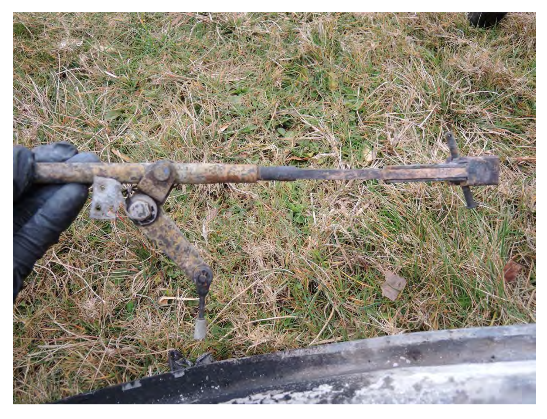
Photo 20 - Close Up of Aft End (Latch and Third Latch Point Bell Crank)