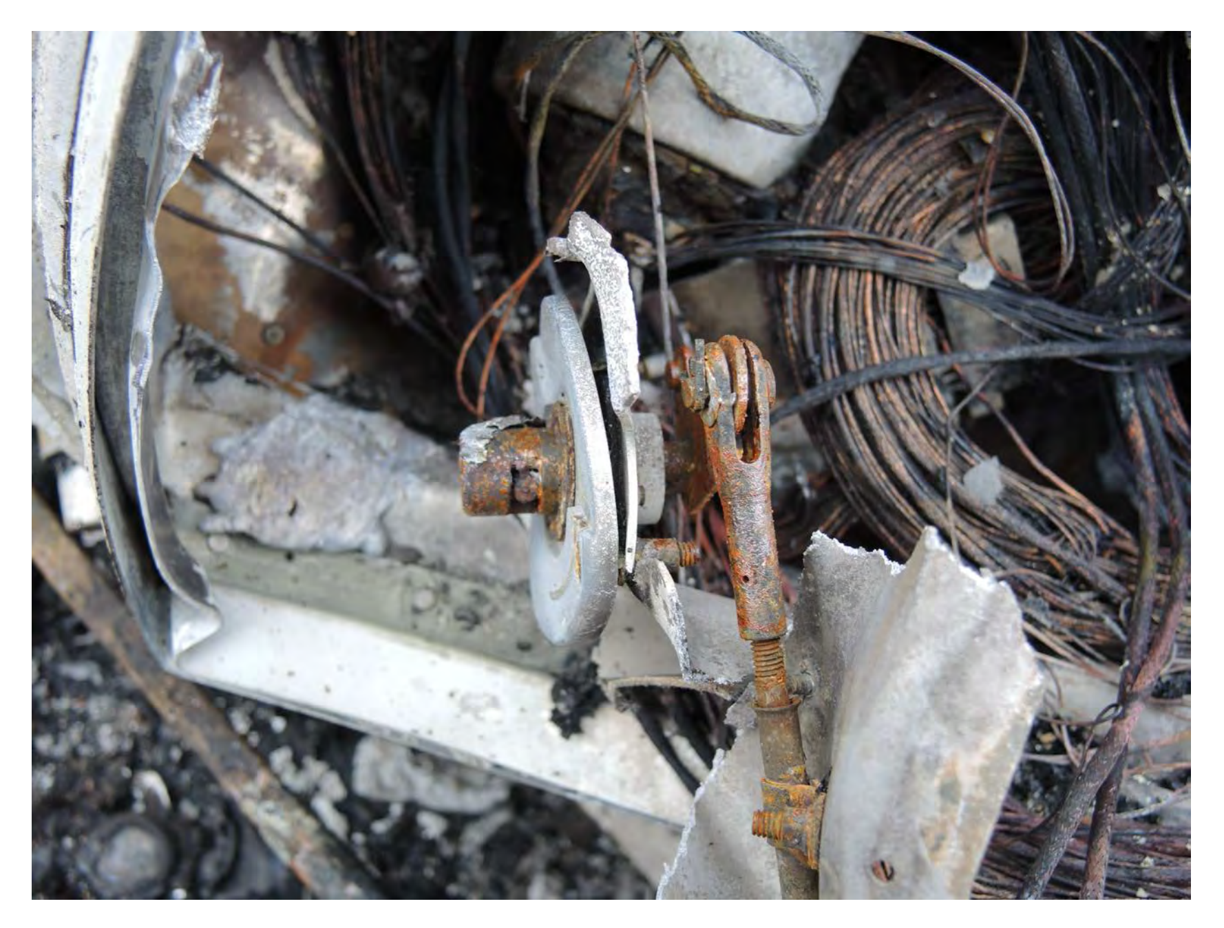
Photo 14 – Interior Door Handle Plate and Rod End