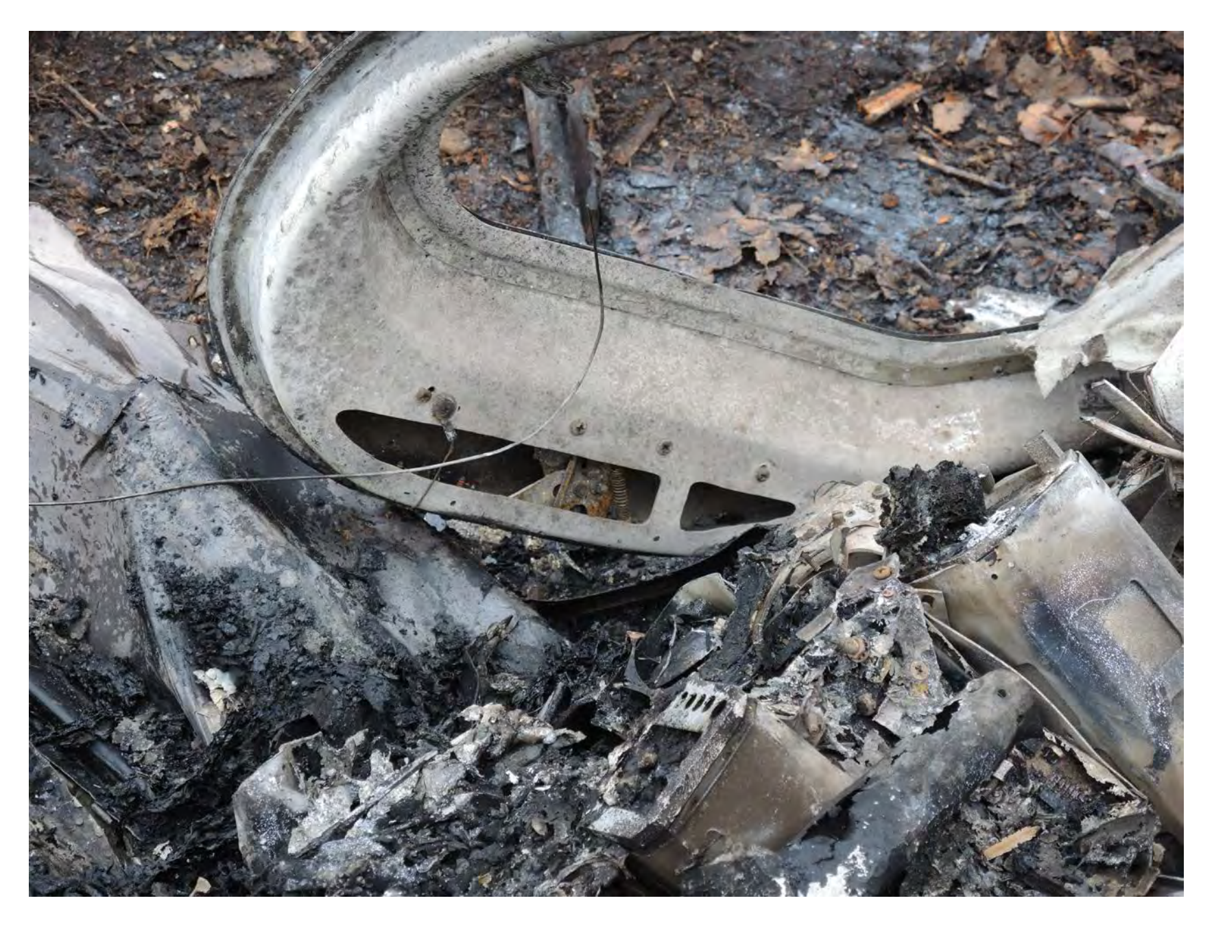
Photo 12 - Forward Cabin Door Upper Frame (Interior View)