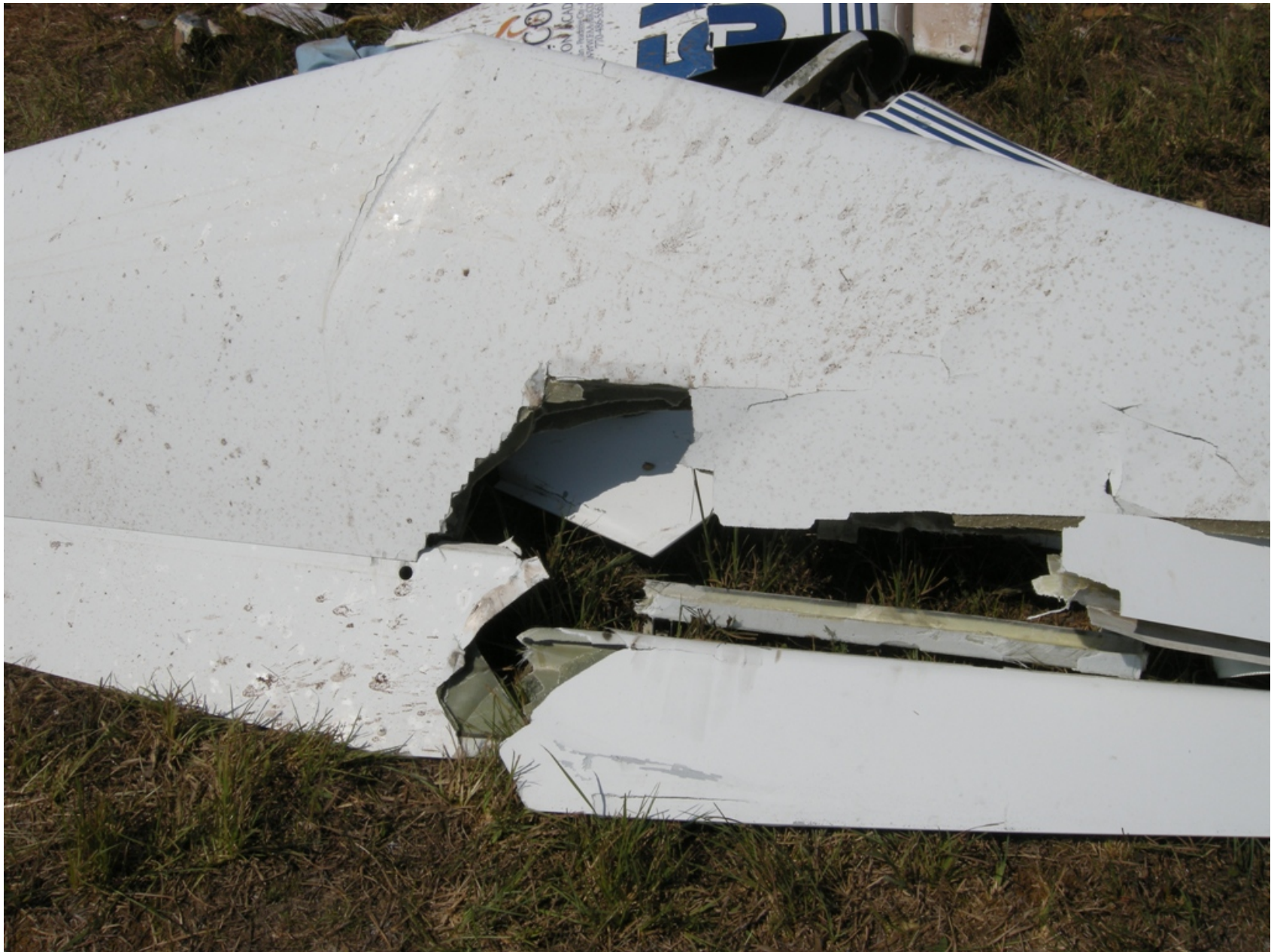
Photo 8 – Upper Surface of DA20 Horizontal Stabilizer and Elevator (NTSB Photo)