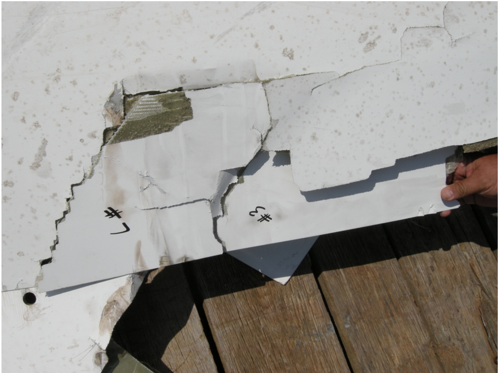
Photo 10 – DA20 Upper Surface of Horizontal Stabilizer