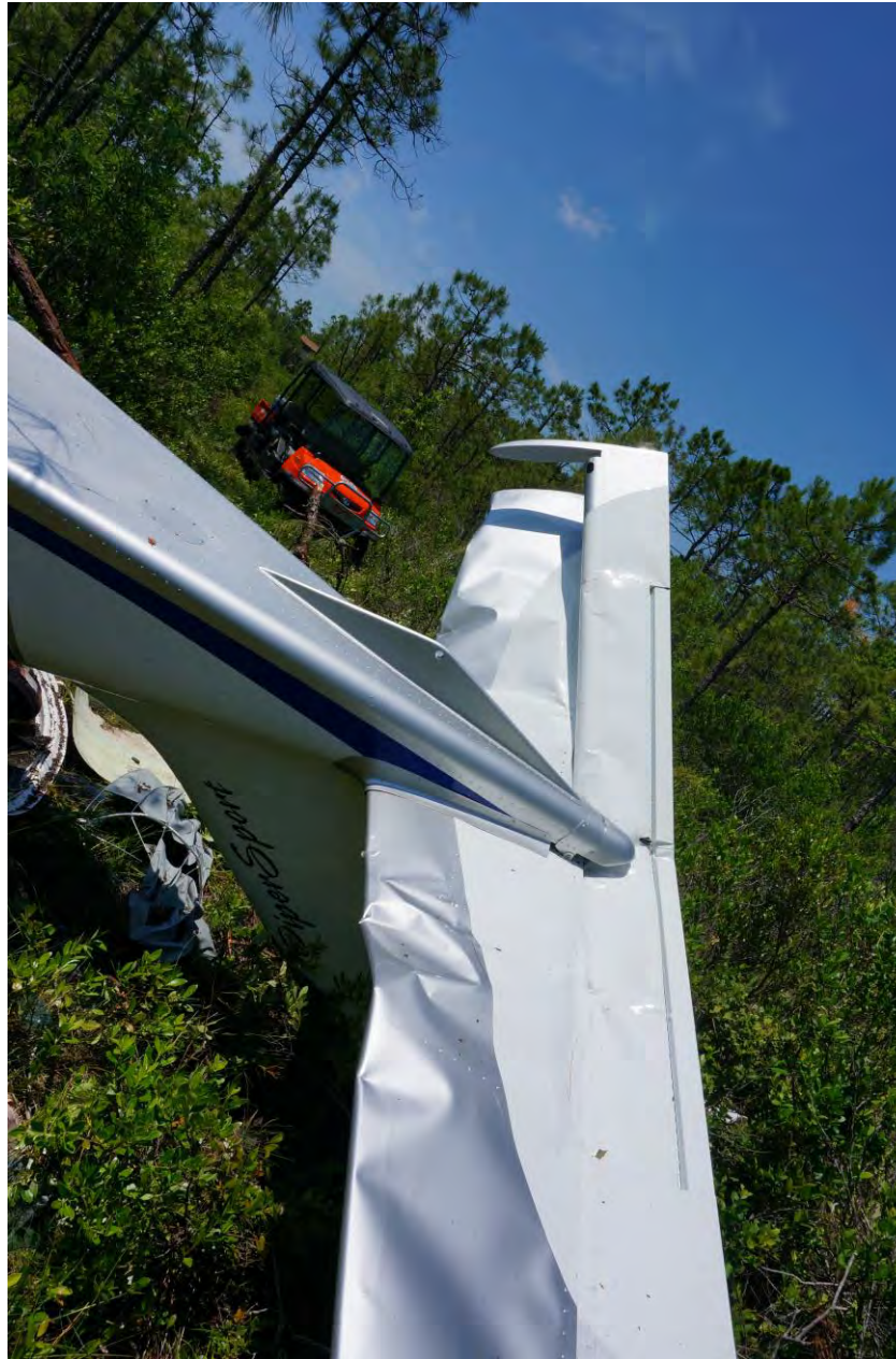
Photo 5 - Empennage