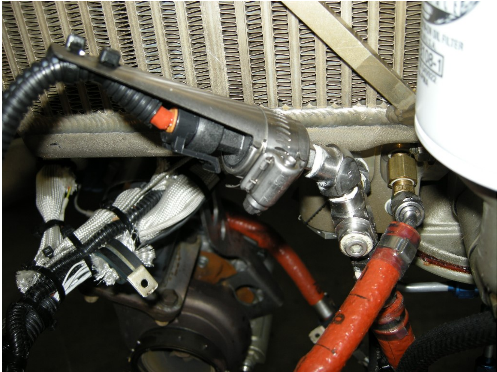
Photo 4 – NTSB Digital Photograph. View of the Oil Pressure Transducer and Electrical Wiring Connection