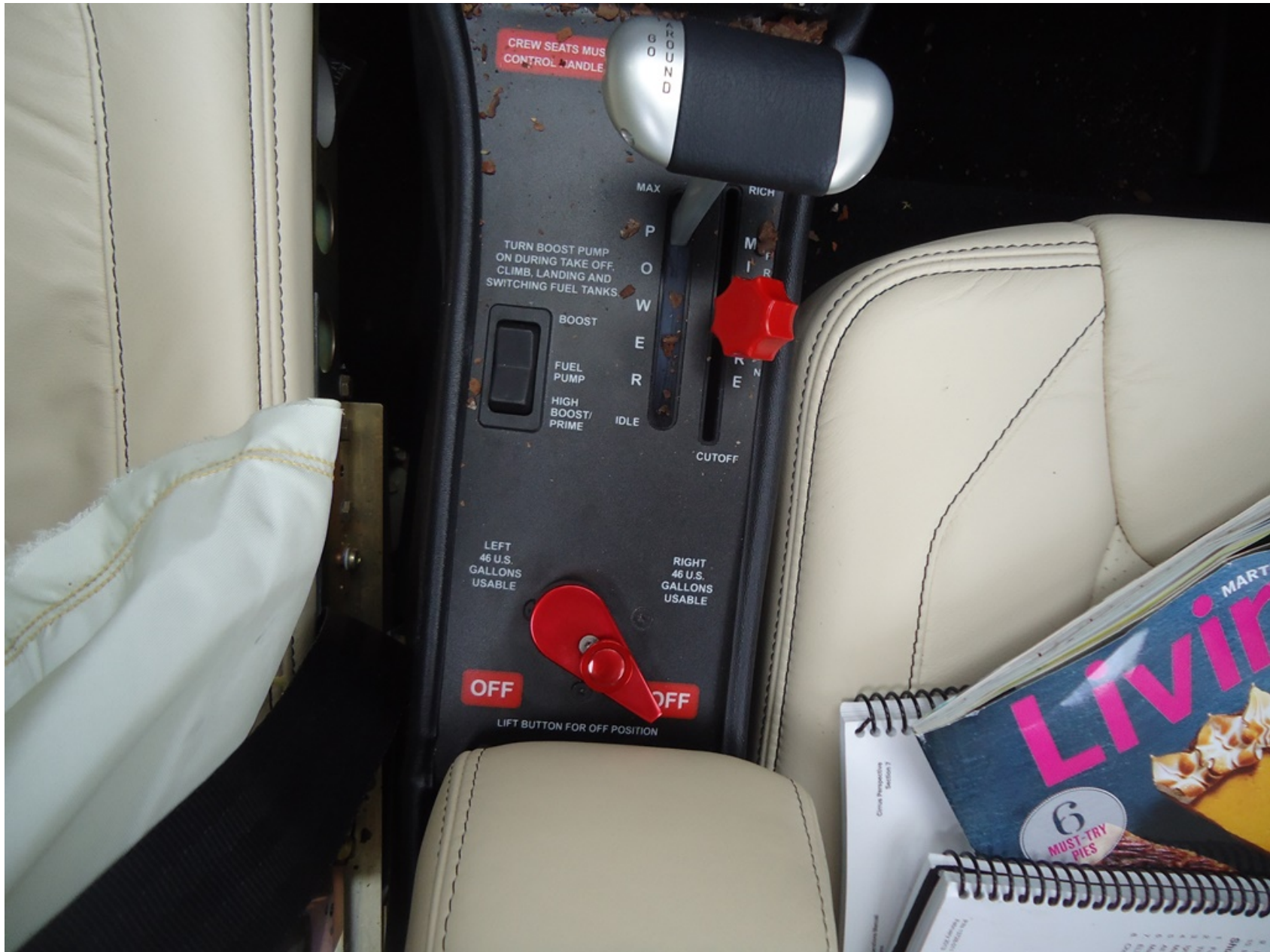
Photo 3 - View of the Throttle Quadrant