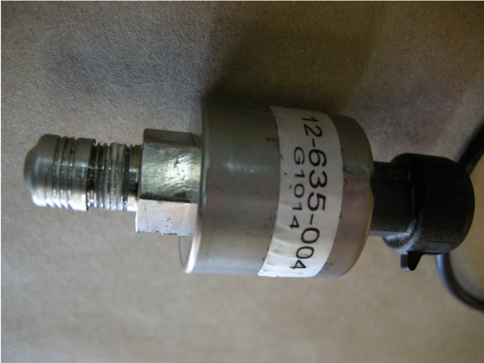
Photo 5 - NTSB Digital Photograph. View of the Oil Pressure Transducer.