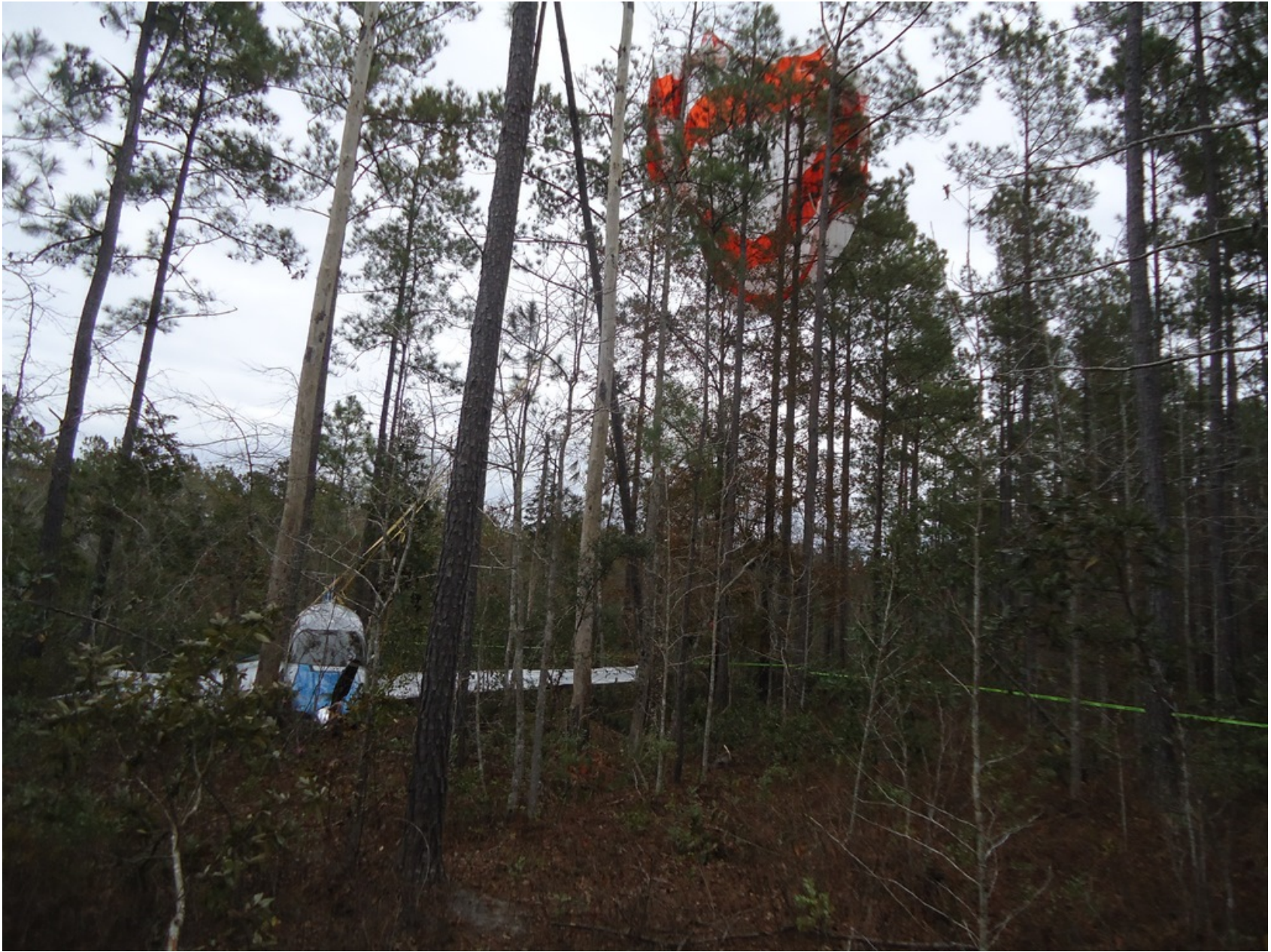
Photo 1 – Digital Photograph Provided by Atlanta Air Salvage Personnel. View of the Airplane at the Accident Site