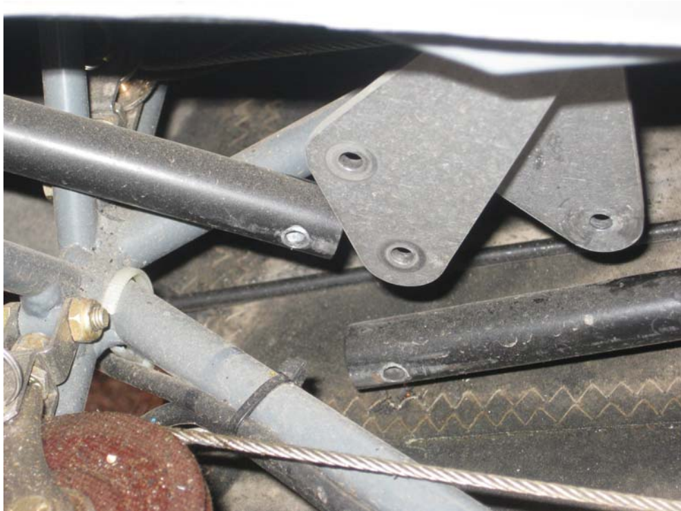
Photo 3: the disconnected elevator control tube with the loose bolt removed.