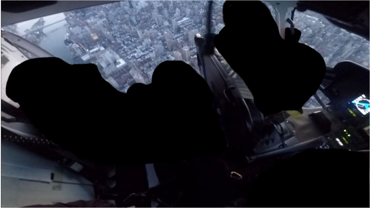
Figure 2. A screenshot captured at 19:06:08.05. The occupants have been redacted.