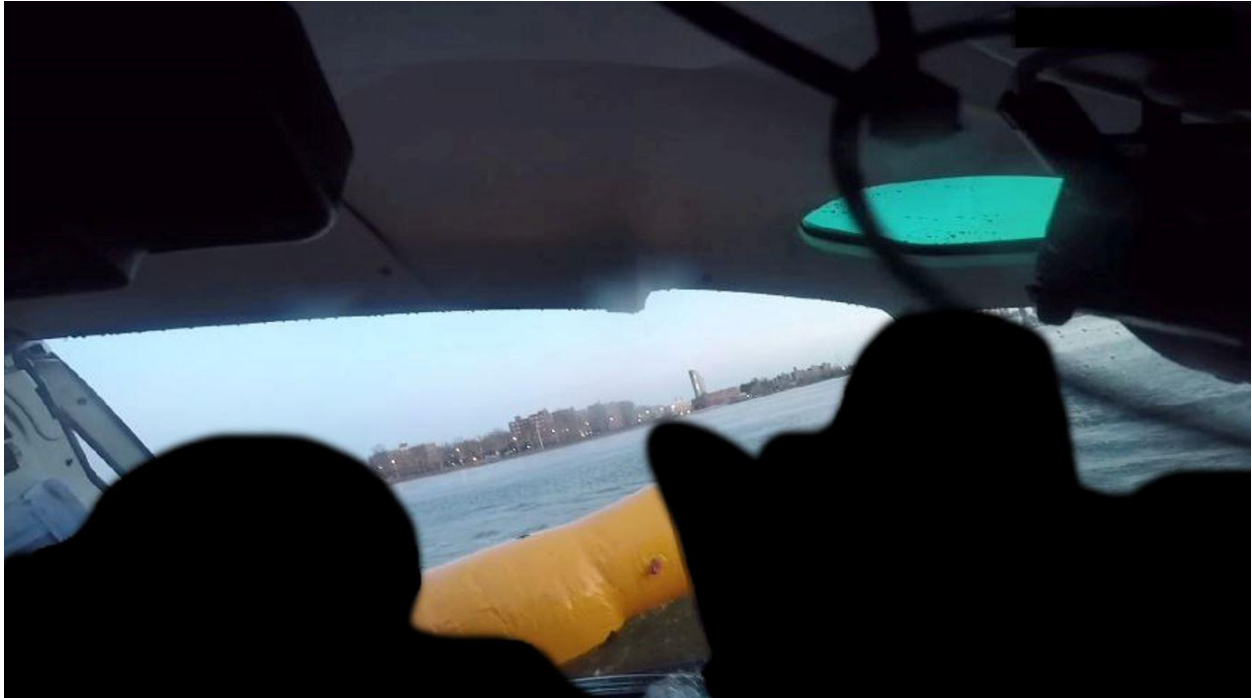
Figure 4. A screenshot captured at 19:07:22.8. The figure shows the condition of the float and the surface condition of the water. The occupants have been redacted.