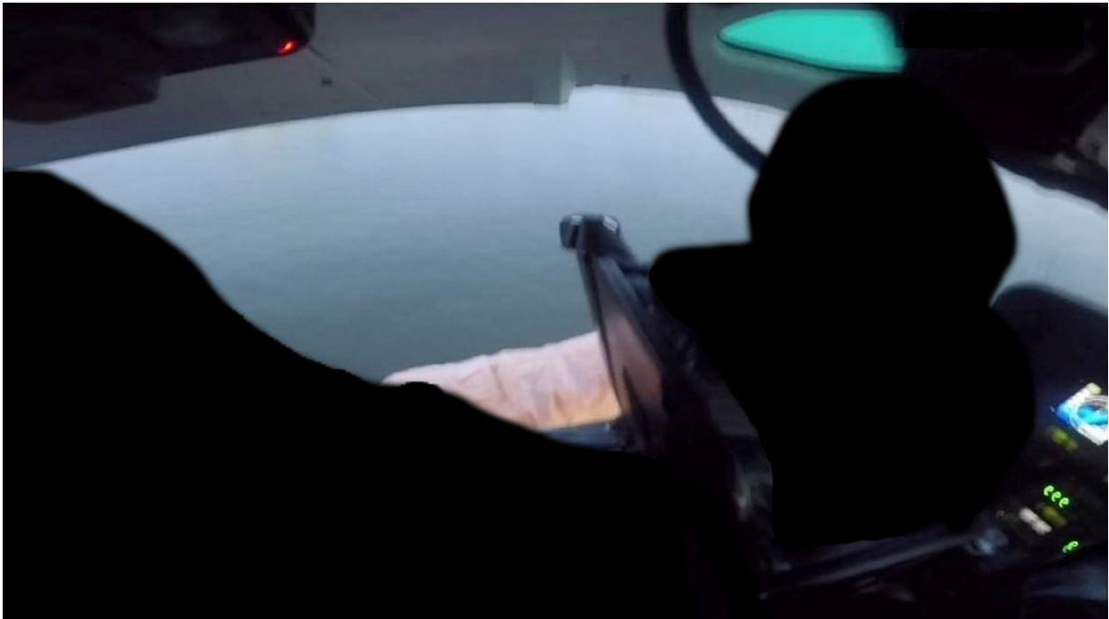
Figure 3. A screenshot captured at 19:07:15.37. The figure shows the condition of the float and the surface condition of the water. The occupants have been redacted.