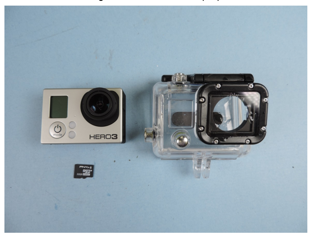
Figure 2: Photo of GoPro Hero 3 Black (S/N HD3BB11120A2898)