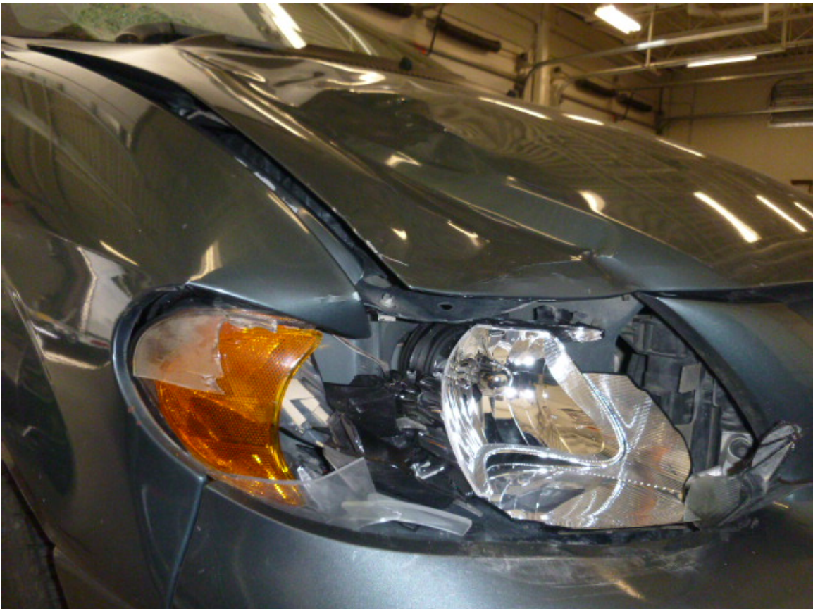
Photo 10 – A closer view to the damage to the right front headlight area of the 2005 Chrysler Town and Country Minivan