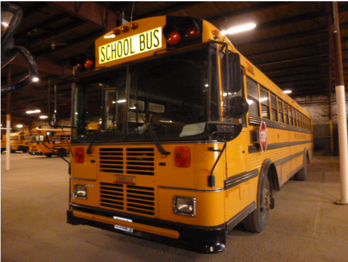
Photo 4 - A front and left-side view of the 2000 Thomas Built School Bus