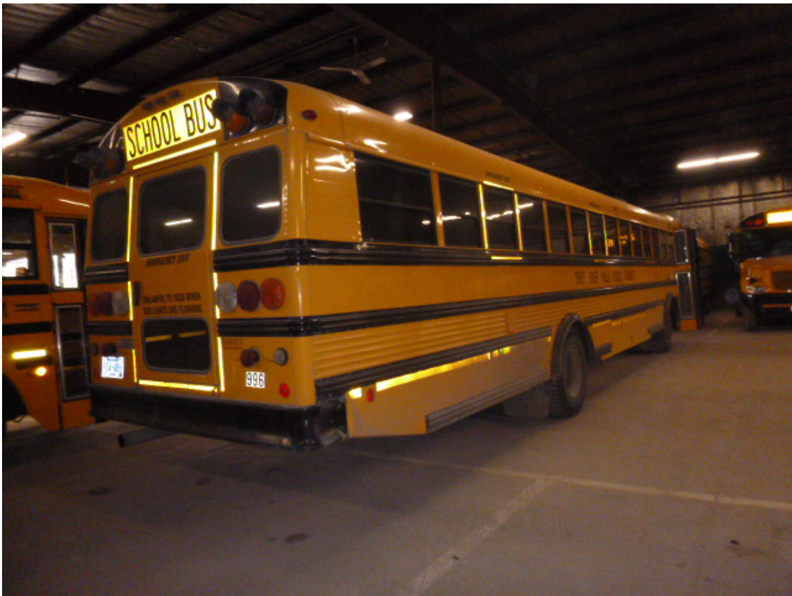
Photo 5 - rear and right-side view of the 2000 Thomas Built School Bus