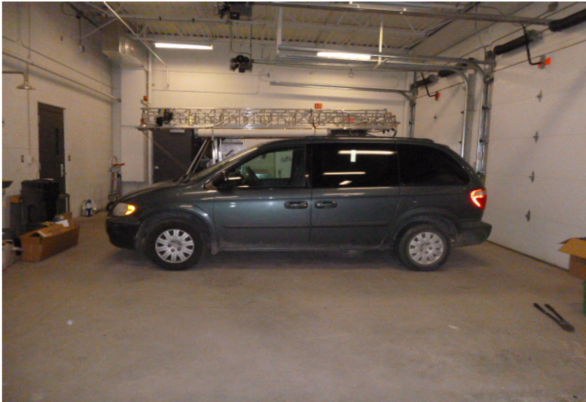
Photo 6 - A left-side view of the 2005 Chrysler Town and Country Minivan