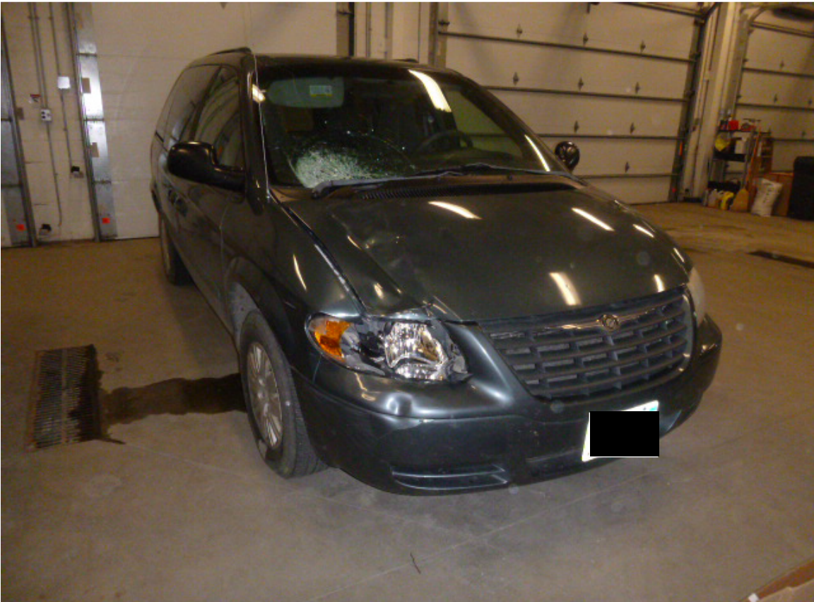
Photo 8 - A left front view of the 2005 Chrysler Town and Country Minivan showing impact damage to the right headlight hood and windshield area