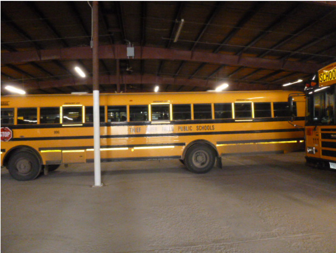
Photo 3 - A left side view of the 2000 Thomas Built School Bus