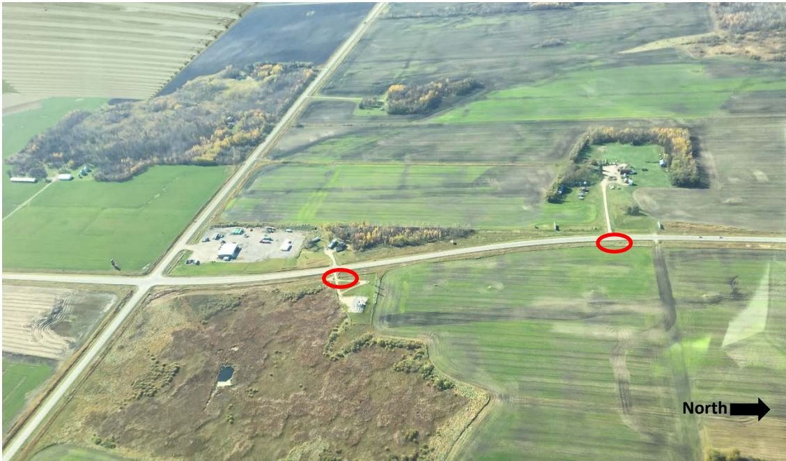
Photo 1 – An aerial photo of State Highway 59 showing first and student second school bus stops on SH59 circled in red.