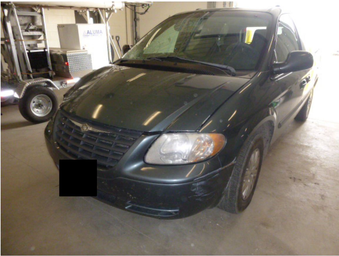
Photo 7- A right front view of the 2005 Chrysler Town and Country Minivan