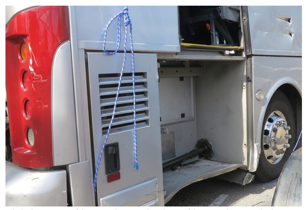
Vehicle Photo 4 – View of the contact damage to the right rear of the Van Hool Motorcoach. Photo shows damage to the right rear taillight and to the side of the motorcoach above the rear axle.