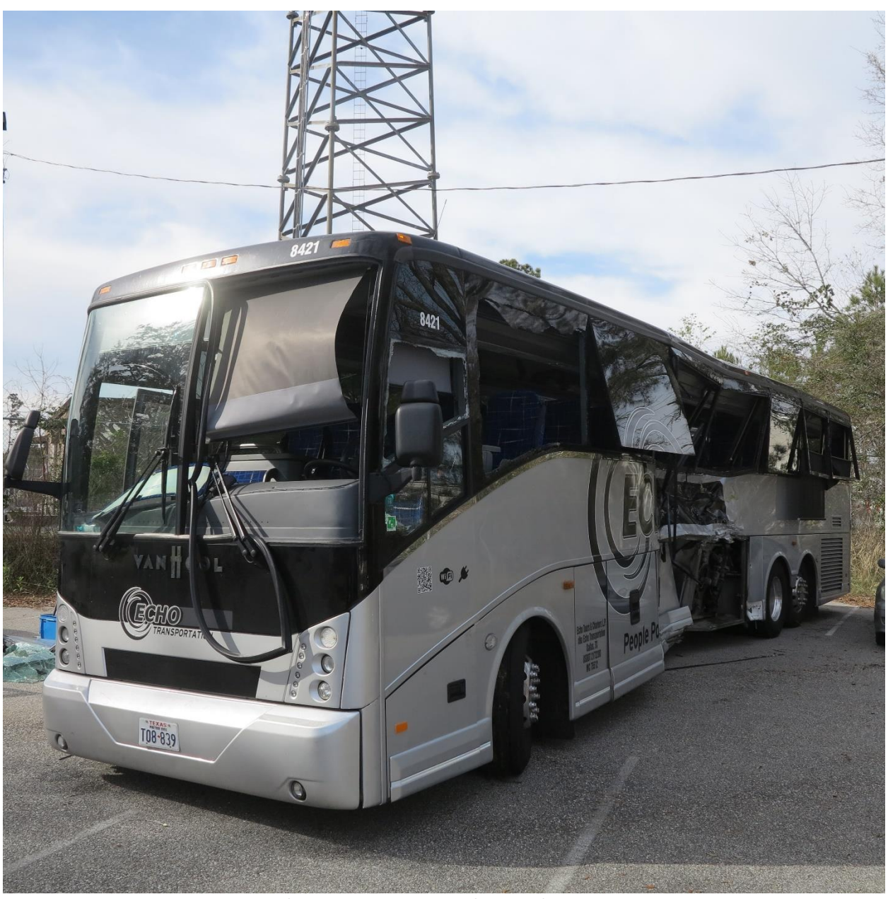
Vehicle Photo #1 – Overall view of the damage to the left side of the Van Hool Motorcoach during inspection at the Biloxi, Mississippi Police Department Impound Yard.