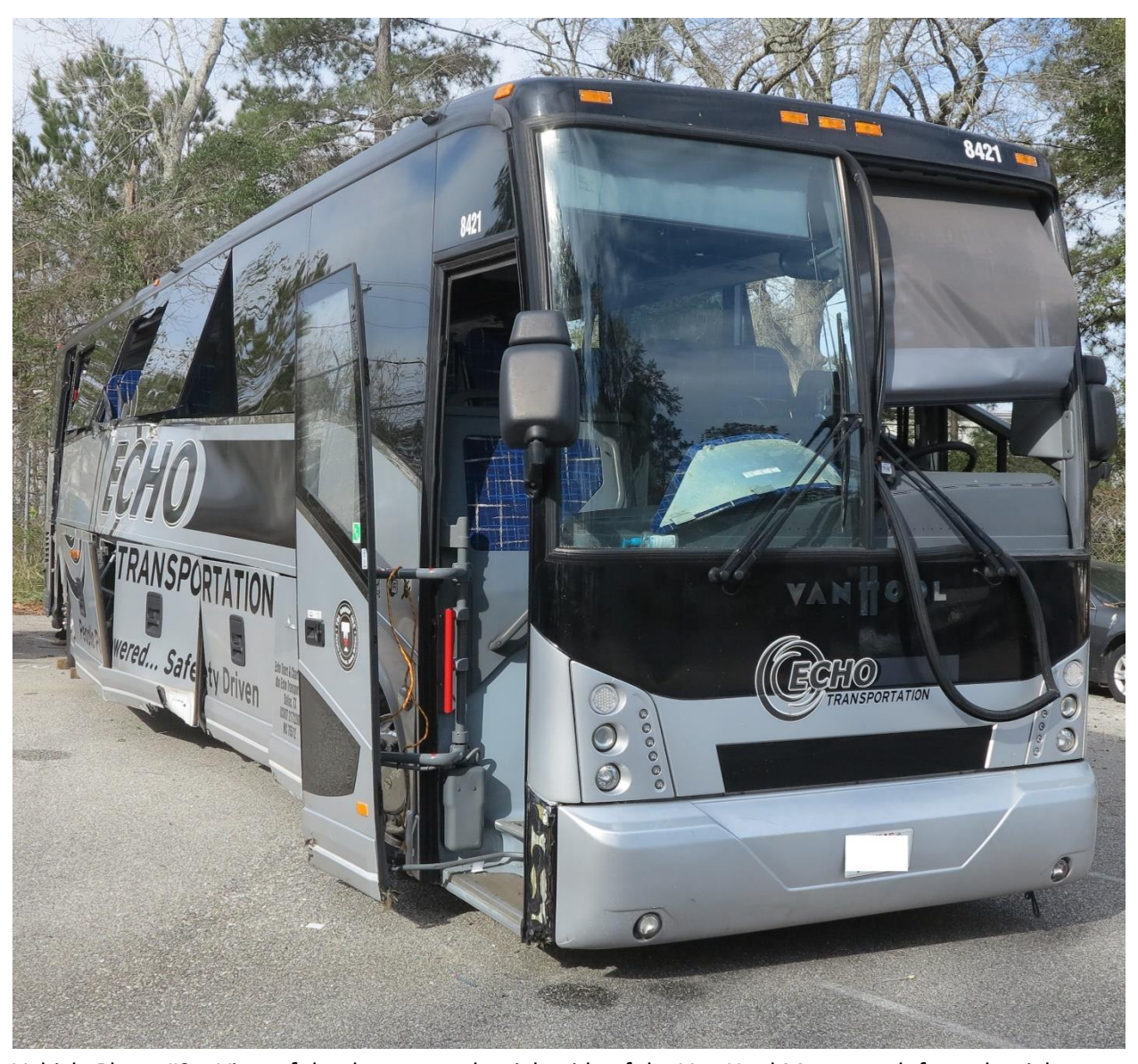
Vehicle Photo #3 – View of the damage to the right side of the Van Hool Motorcoach from the right front corner.