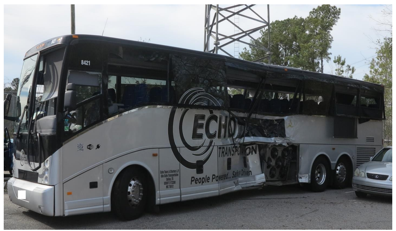
Vehicle Photo #2 – View of the damage to the left side of the Van Hool Motorcoach.