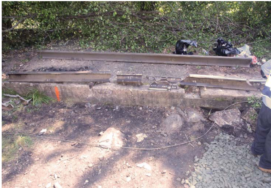
Figure 3. View of rail rebuild.