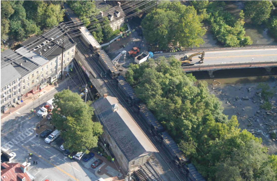
Figure 1. Derailed train on the railroad bridge.