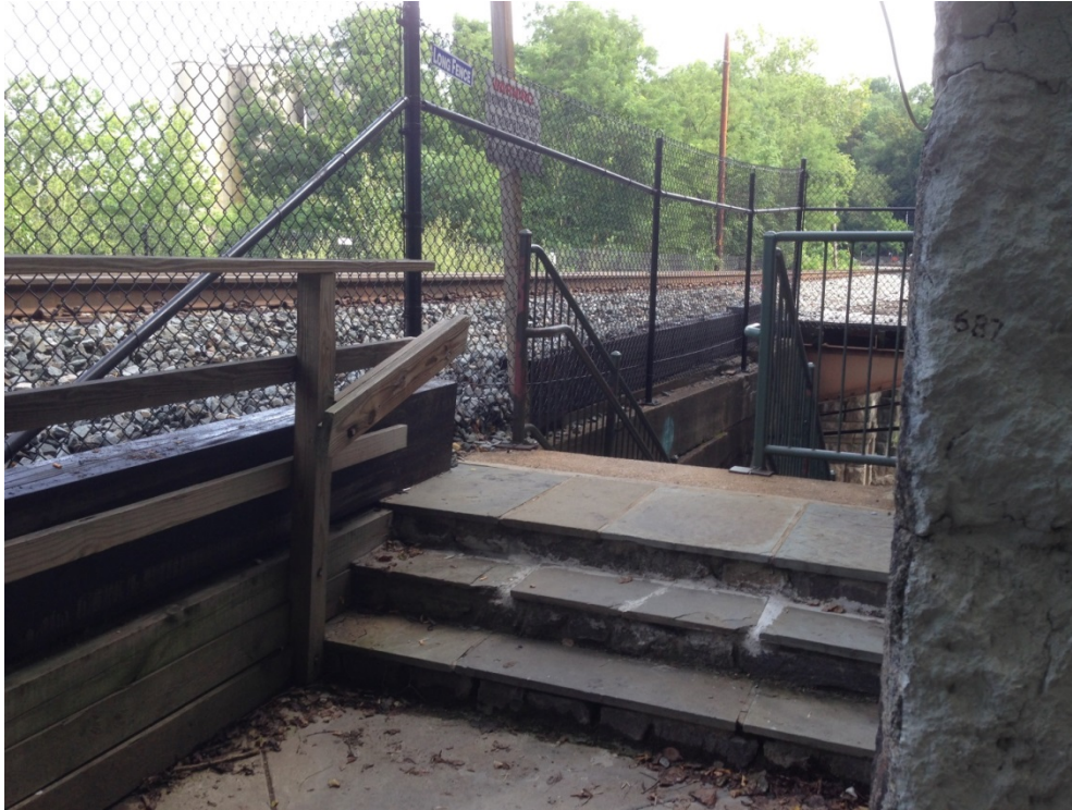
Figure 5. The chain-link fence installed along the railroad right-of-way to deter trespassing.