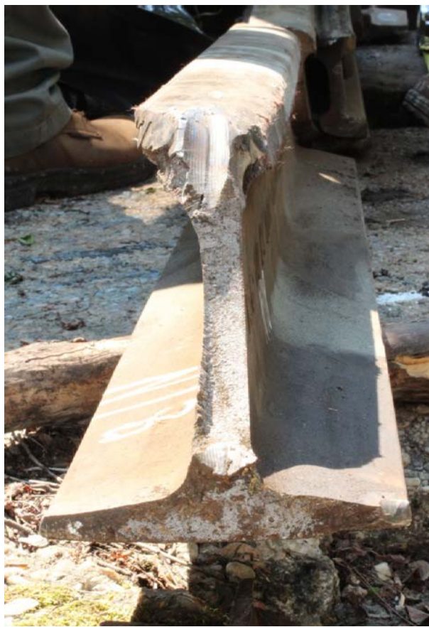
Figure 4. Cross-sectional view of a severe wheel flange strike mark on the head of a broken rail.