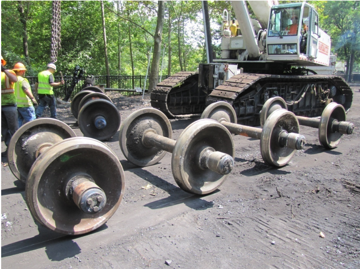
Figure 2. Wheel sets from car CSXT 302724.

On close examination, investigators observed several perpendicular strike marks in the wheel tread of the third set of wheels that indicates a track-related defect. These marks were the first to have a pattern of successive impacts that were about 3 inches apart. (Marks were not found on the wheels of first and second set of axles.) In addition, a corresponding mark, or a mark on the adjacent wheel in the same horizontal plane of reference, was observed on the L3 wheel (the second wheel on the right side of the car in the direction of travel), located on the outside rim of the wheel.