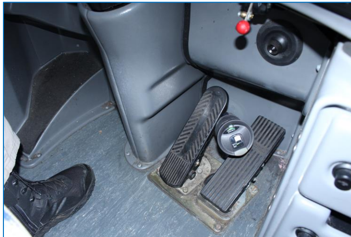
Figure 3: Pedal obstruction test using exemplar motorcoach and metal thermos, showing one lodging position among several possible thermos and pedal combination scenarios.

NTSB investigators considered the possibility that an object became lodged beneath or between both the brake and the accelerator pedals, resulting in uncontrolled acceleration and the inability to apply the brakes (figure 3). At the scene of the crash, investigators found a metal thermos near the control pedals. When interviewed, the driver's wife stated that he had taken his thermos for the trip. The thermos could potentially explain the metal rattling heard on the Garmin audio just before the driver's first remark.