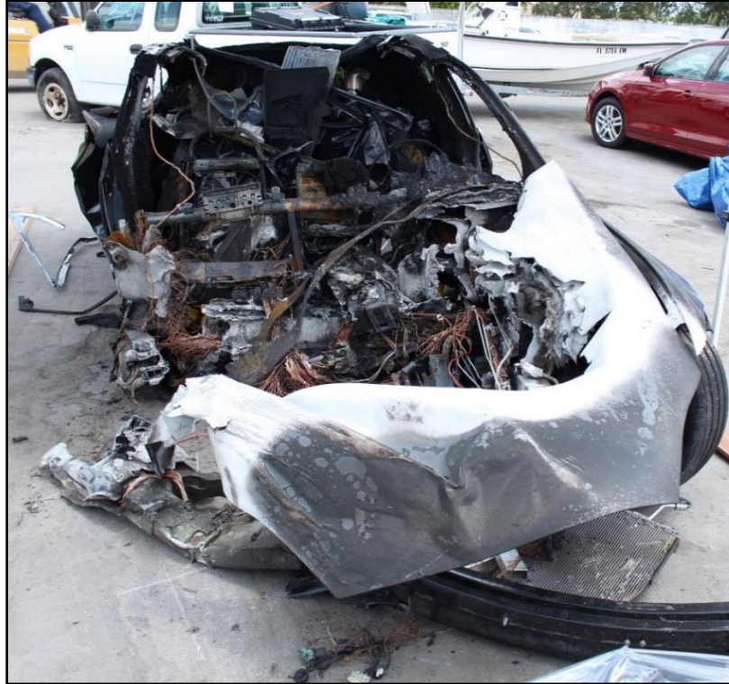
Figure 6. Front of car, showing severe crash damage and significant interior fire damage.

The 400-VDC, 85-kWh lithium-ion battery sustained damage. It was slightly twisted, with the right front corner raised. That corner was crushed on about a 45-degree diagonal and raised above the rest of the battery. The steel top of the battery case was pushed back and exhibited corrosion typical of severe heat exposure. The contents of battery modules 15 and 16 were found separated from the battery, and the module 15/16 portion of the battery case was empty. Loose battery cells were found in the passenger compartment and outside the vehicle. Holes were found in the steel top of the battery case, matching holes in the bottom of the passenger-side floorboard. The holes were caused by electrical arcing at high-voltage terminals and individual cells exploding, as a result of crash damage to the battery case and the battery fire.