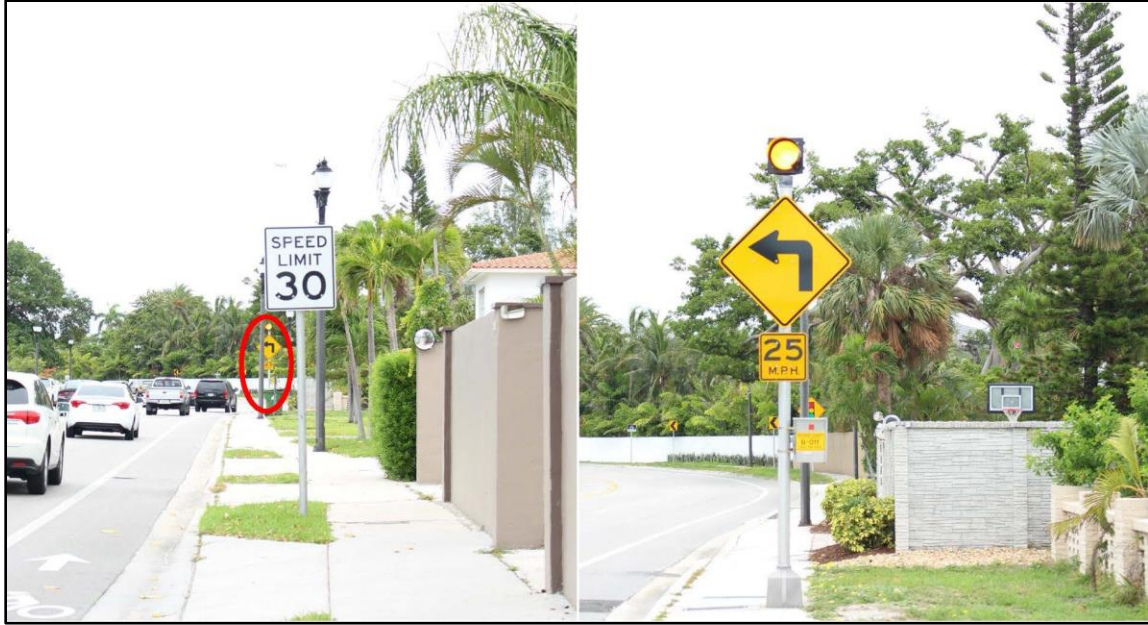
Figure 2. (Left) southbound Seabreeze Boulevard with speed limit sign and turn-warning sign (circled in red); and (right) closeup of approach to curve with turn-warning sign, flashing beacon, and advisory speed sign.