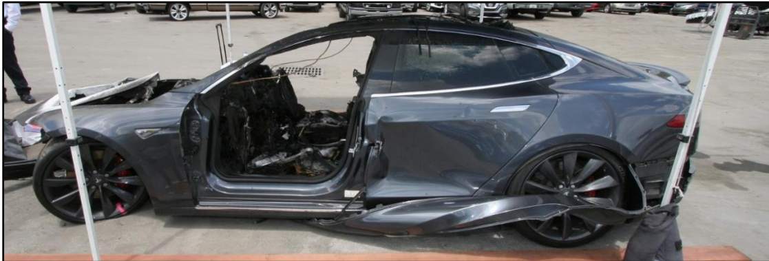
Figure 4. Left side of car showing minor-to-moderate crash damage and limited fire damage.

The left (driver) side of the car exhibited minor-to-moderate crash damage along its length. Thermal damage was minimal and limited to the left front fender, forward of the wheel (figure 4).