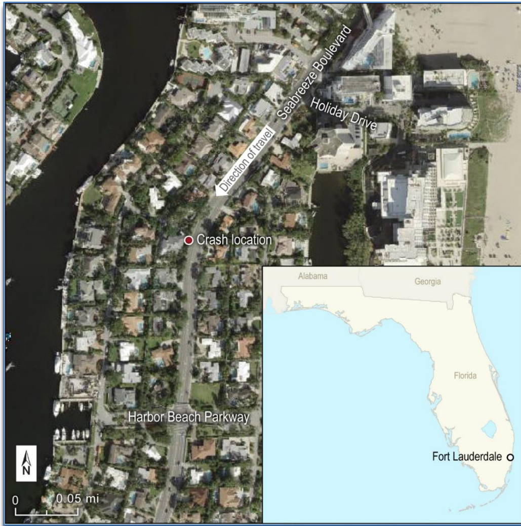
Figure 1. Satellite view of crash location showing direction of travel, with inset map of Florida showing Fort Lauderdale.

The car reentered the road, mounted the curb on the east side of Seabreeze Boulevard, struck a metal light pole, rotated, and came to rest in the driveway of an adjacent residence. The car was engulfed in fire. Both the driver and the front passenger died in the crash. The rear passenger was ejected during the crash and was transported to a local hospital with serious injuries. At the time of the crash, it was daylight, the weather was clear, and the road was dry.