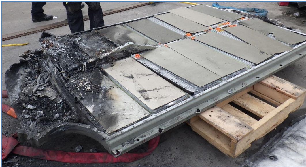
Figure 3. Photo of battery showing fire-damaged region at front that contained modules 15 and 16, loose individual cells (rust-colored), vertically stacked cells below loosened covers, and orange insulation caps covering high-voltage terminals.

The vehicle's 400-VDC, 85-kWh lithium-ion traction battery was located under the floor of the car and spanned an area from the front tires rearward. The battery was divided into 16 modules (numbered from rear to front), plus a compartment for the battery management system. Each module contained individual battery cells stacked vertically. Figure 3 shows the fire-damaged battery. Modules 15 and 16, at the front of the car, were the most severely burned.