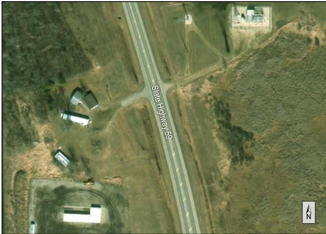
Figure 2. Aerial view of crash location. Pedestrian was waiting with siblings on east side of highway, across road from driveway to his house, shown on left.

The crash occurred in a rural area, where fields and farms dominate the landscape (figure 2). State Highway 59 is a north/south, two-lane asphalt road that runs northwest to southeast in the area of the crash. The highway has a single lane in each direction, with a double yellow line separating the lanes and a white line separating the northbound lane from the shoulder. The area has no crosswalks, pedestrian control signals, or overhead street lights. Ambient lighting is limited to one lamppost on private property (where the pedestrian lived) across the street from the school bus pickup site. Investigators could not determine whether the light was on at the time of the crash. 3 The posted speed limit is 60 mph.