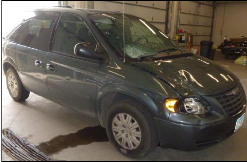
Figure 3. Photograph of minivan showing damage to right bumper, headlight assembly, hood, and windshield.