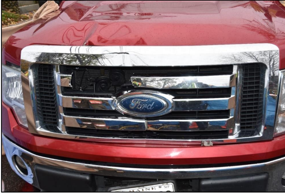
Figure 3. Closeup of crash vehicle showing damage to hood and grille.