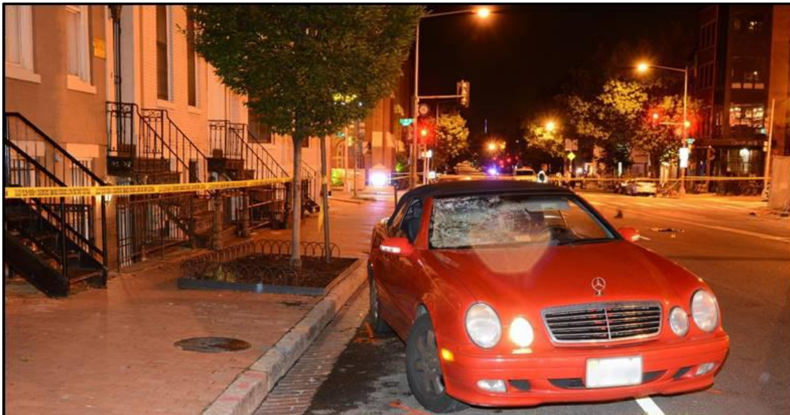
Figure 3. Crash car parked on 9th Street NW after collision. Note damage to windshield.

The car's left front head lamp was out and had been out before the crash. Damage to the vehicle included scratch marks on the right front bumper and right side of the hood and a smashed right windshield (figure 3). No mechanical defects were discovered after the crash.