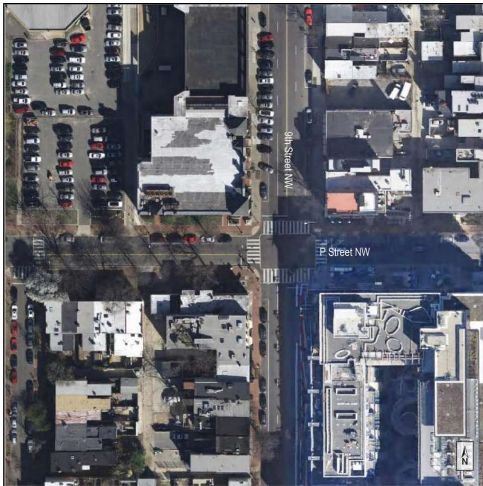
Figure 2. Aerial view of crash location showing crosswalks at intersection and building under construction on southeast corner.

intersection, and fencing blocked the sidewalk and the parking lane on the east side of 9th Street. The other sidewalks around the intersection were unobstructed.