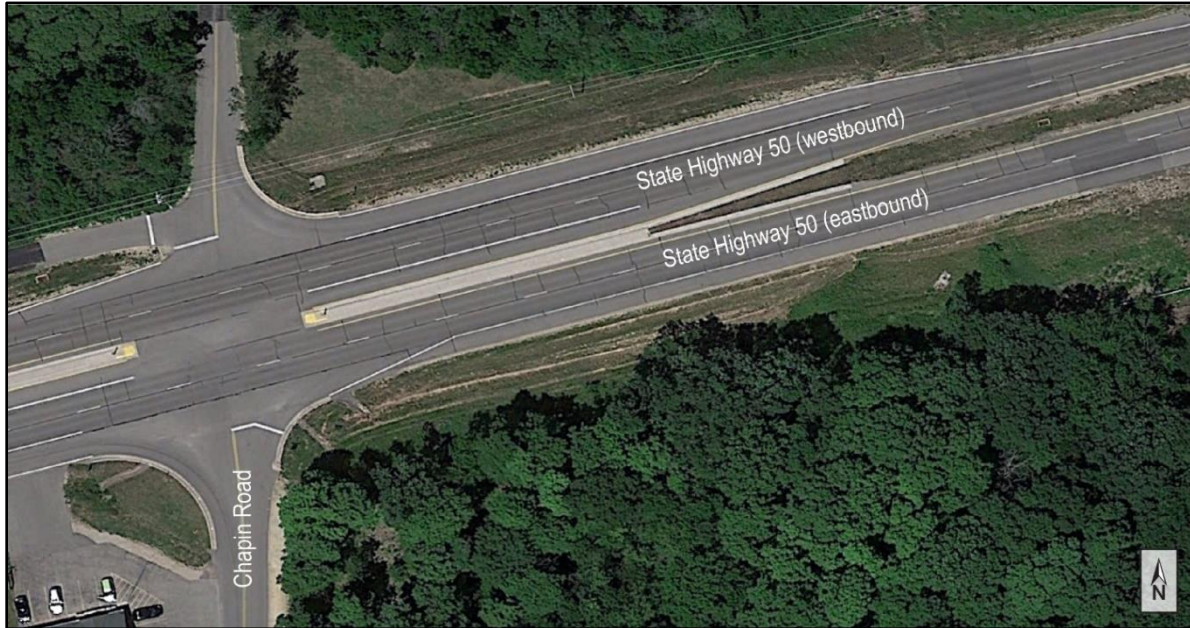
Figure 2. Aerial view of State Highway 50 where pedestrian, walking east on roadway, was struck by SUV. Intersection with Chapin Road is shown west of crash site.

The highway has no sidewalks. A single streetlight stands at the northwest corner of the intersection, about 180 feet from the area of impact. A National Transportation Safety Board (NTSB) investigator visited the crash location a week after the crash, at 1:25 a.m. on August 23, 2016, to observe the area under ambient lighting alone. The skies were dark and the moon was 31.1^\circ above the horizon, as on the night of the crash. Less of the moon's surface was illuminated (71 percent), meaning that the surroundings were darker. Nevertheless, the investigator could clearly discern the grass shoulder, paved shoulder, travel lanes, and median.