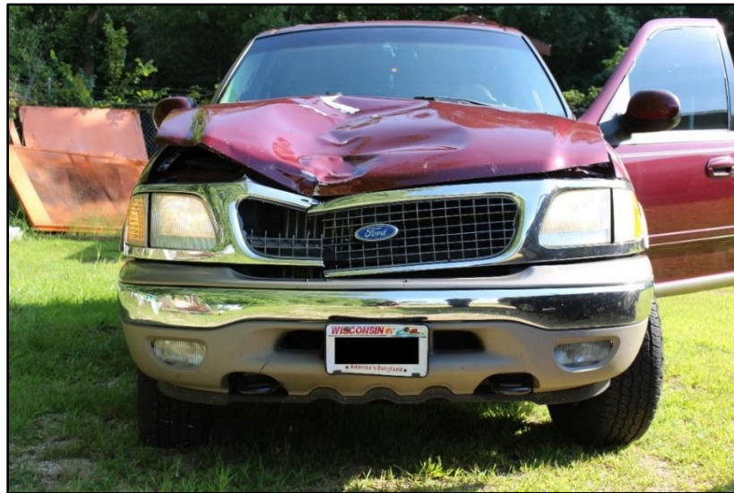
Figure 3. Front of SUV showing contact damage to hood, grille, and bumper.

The 2001 Ford Expedition four-door SUV was examined at the Town of Geneva Police Department's impound facility. The SUV's air bags for the driver and front passenger did not deploy in the collision. Contact damage to the front of the SUV was concentrated in an area slightly offset toward the passenger side from the vehicle's centerline (figure 3). Contact damage was noted on the vehicle's front bumper, grille, hood, and roof. The most significant damage was to the hood. The driver stated that the vehicle had no mechanical problems before the crash.