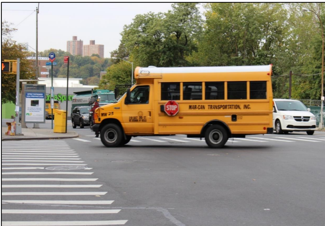
Figure 3. School bus similar to that involved in crash, shown turning left from West Fordham Road onto Sedgwick Avenue at crash intersection. (Crash bus was turning right from eastbound West Fordham Road, in lane where green truck can be seen.) View is west from crosswalk where pedestrian was struck.

The crash vehicle was a 2007 Ford school bus (figure 3). The bus had a tracking device that used global positioning system technology to record its location and speed. According to the tracking data, the crash occurred at 12:23 p.m., and the bus was traveling 9 mph.