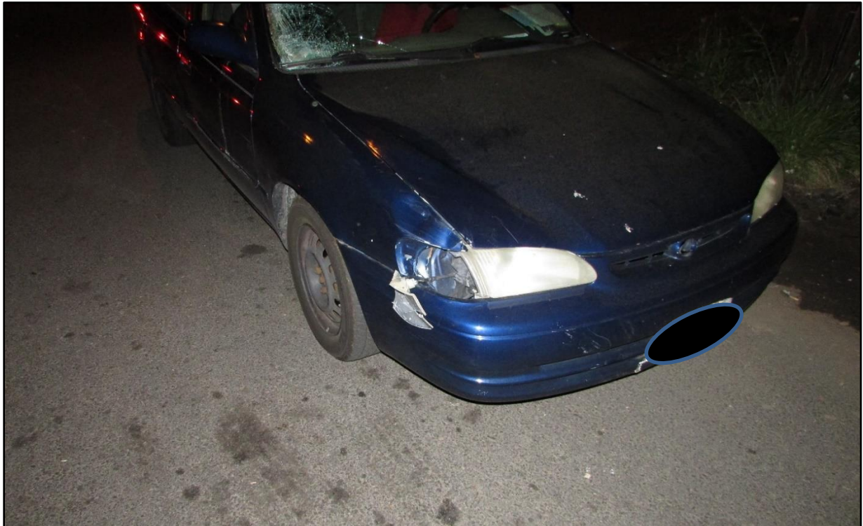
Figure 3. Photograph of crash car taken at scene showing damage to bumper, hood, and windshield from impact with pedestrian.

The vehicle involved in the crash was a 1998 Toyota Corolla four-door sedan (figure 3). The vehicle was equipped with air bags for the driver and the front passenger. The air bags did not deploy in the crash. Examination of the vehicle at the scene revealed several areas of damage. The damage included scratches on the right front bumper next to the license plate. The scratch marks extended up from the bumper toward the right side of the hood. A swipe mark, or disturbance of dust and dirt on the hood, extended up from left to right and off the right side of the vehicle. Both the A-pillar and the passenger side of the windshield were damaged by the pedestrian's body.