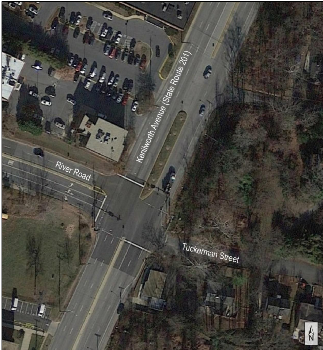
Figure 2. Aerial view of crash location showing where Tuckerman Street intersects with Kenilworth Avenue.

center. Kenilworth Avenue in this area is an urban arterial roadway consisting of seven lanes on the south side of the intersection and six lanes on the north side. The roadway runs northeast to southwest, with the opposing lanes divided by a concrete median on the south side of the intersection and a grassy median on the north side. On the approach to the intersection with Tuckerman Street (a dead-end road), the northbound lanes of Kenilworth Avenue consist of two through lanes, a left-turn-only lane, and a parking lane. Along the southwestbound approach, the lanes consist of three through lanes and a right-turn-only lane. The posted speed limit for the roadway is 35 mph.