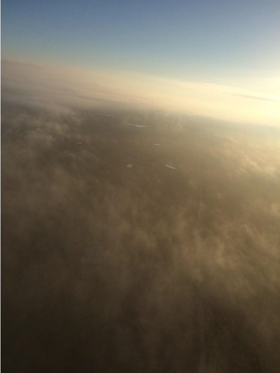
Figure 7. In-flight conditions 27 minutes after launch (about 0725).

Note: The ground remains visible through thin clouds.