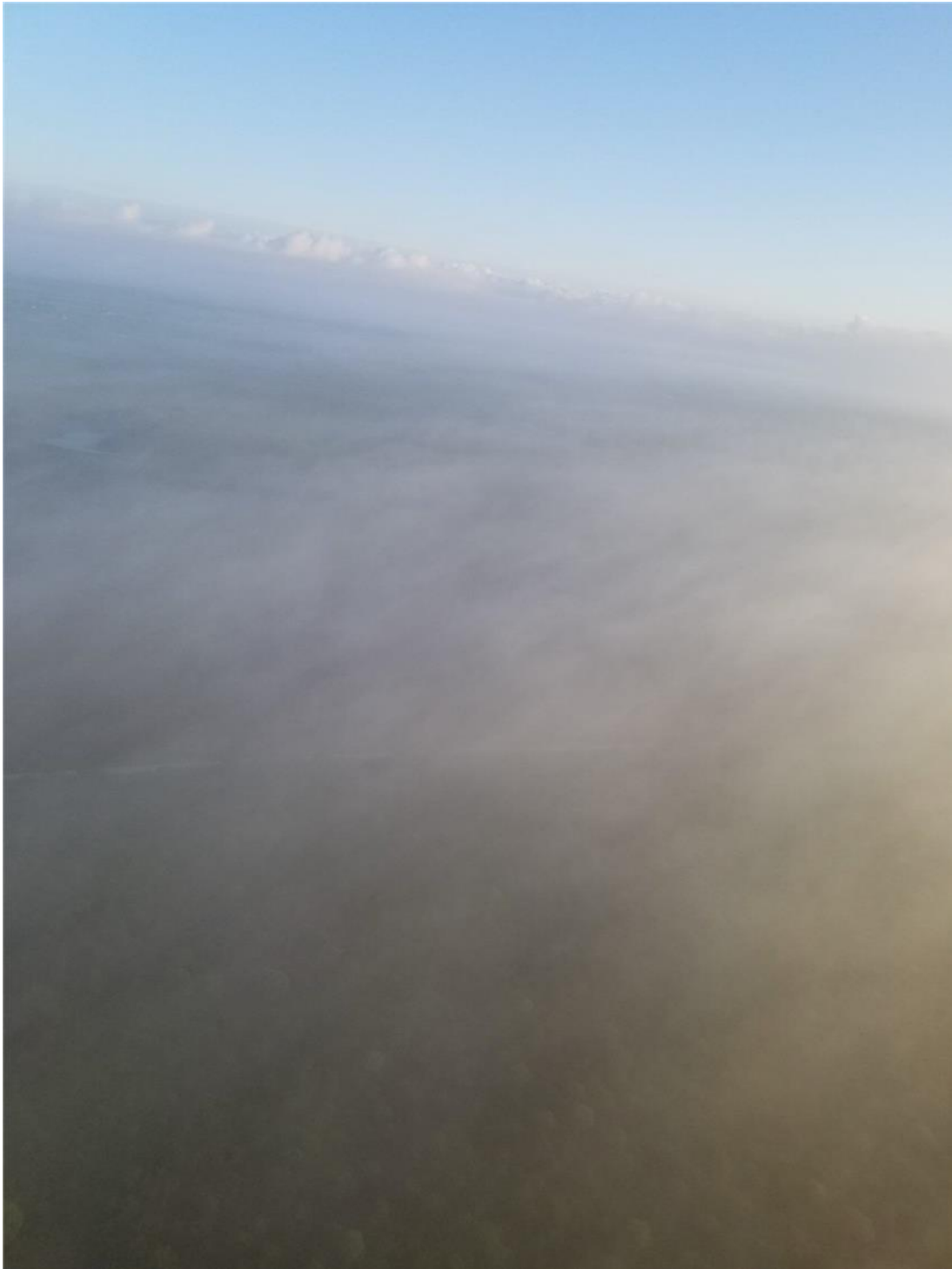
Figure 6. In-flight conditions 26 minutes after launch (about 0724).

Note: The ground is again visible through thin clouds.