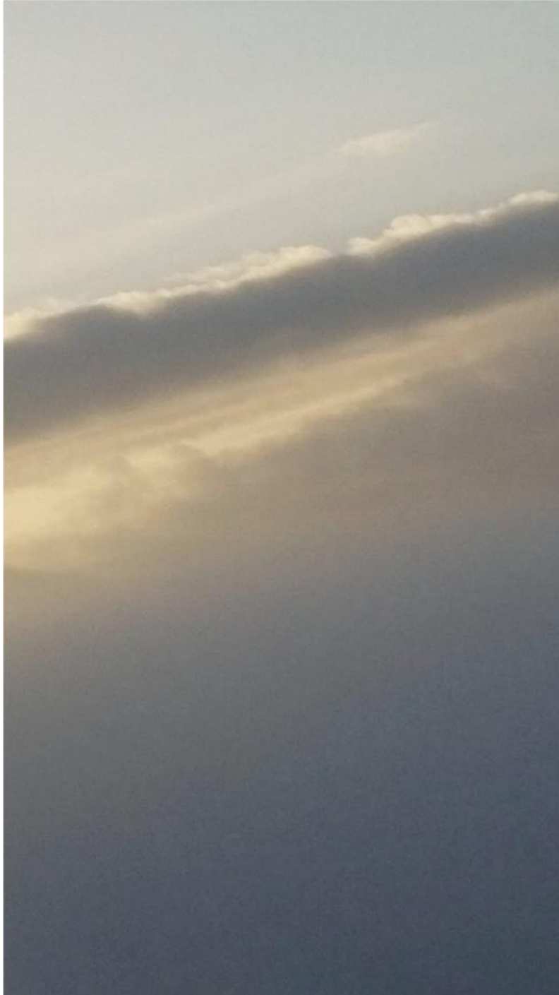
Figure 4. In-flight conditions 19 minutes after launch (about 0717).

Note: The balloon was in mist/fog/clouds; however, the ground was still visible. The direction from which the photograph was taken could not be determined.