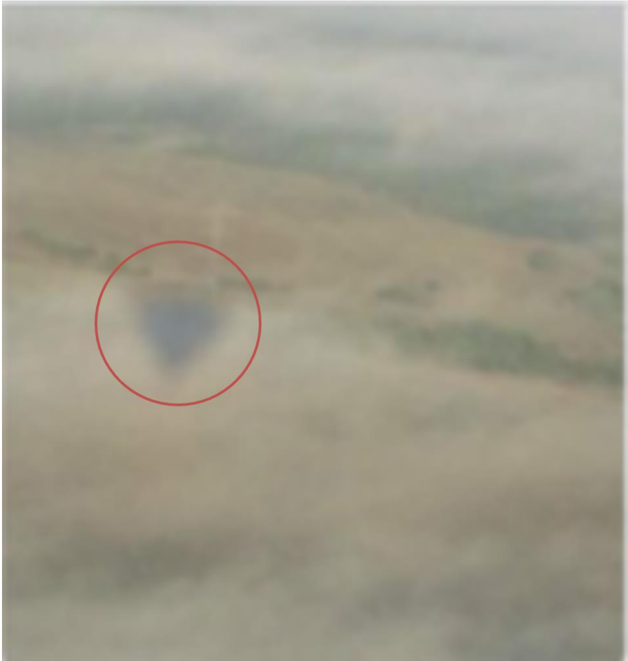
Figure 9. In-flight conditions 42 minutes after launch and 2 minutes before the accident (about 0740).

Note: This photograph was taken facing west. The balloon's shadow (circled) can be seen just below the break in the clouds. A power line tower is visible through the break in the clouds.