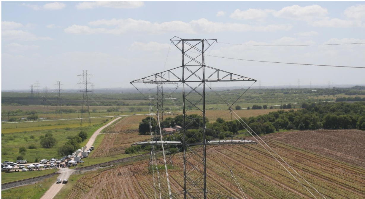
Figure 10. Power lines at the accident site.