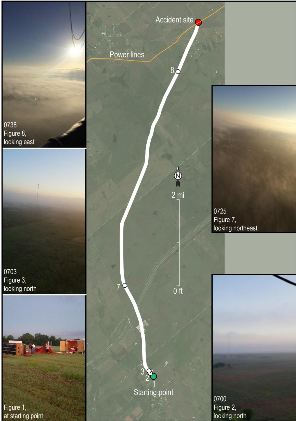
Figure 14. Photographs and map overlay illustrating the pilot's weather-related decision points.