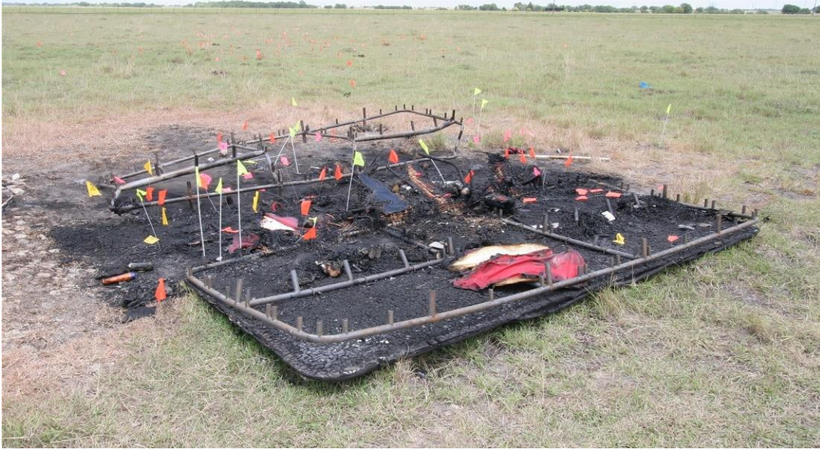
Figure 12. Postaccident photograph of the basket.

Note: All combustible basket components were completely burned; the remaining components were badly charred.