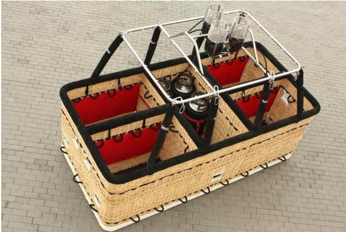
Figure 11. Exemplar Kubíček K60TT basket.

(routed around and underneath the basket) connected on each end to the burner support frame, resulting in a 12-point connection. Figure 11 shows an exemplar Kubíček K60TT basket.