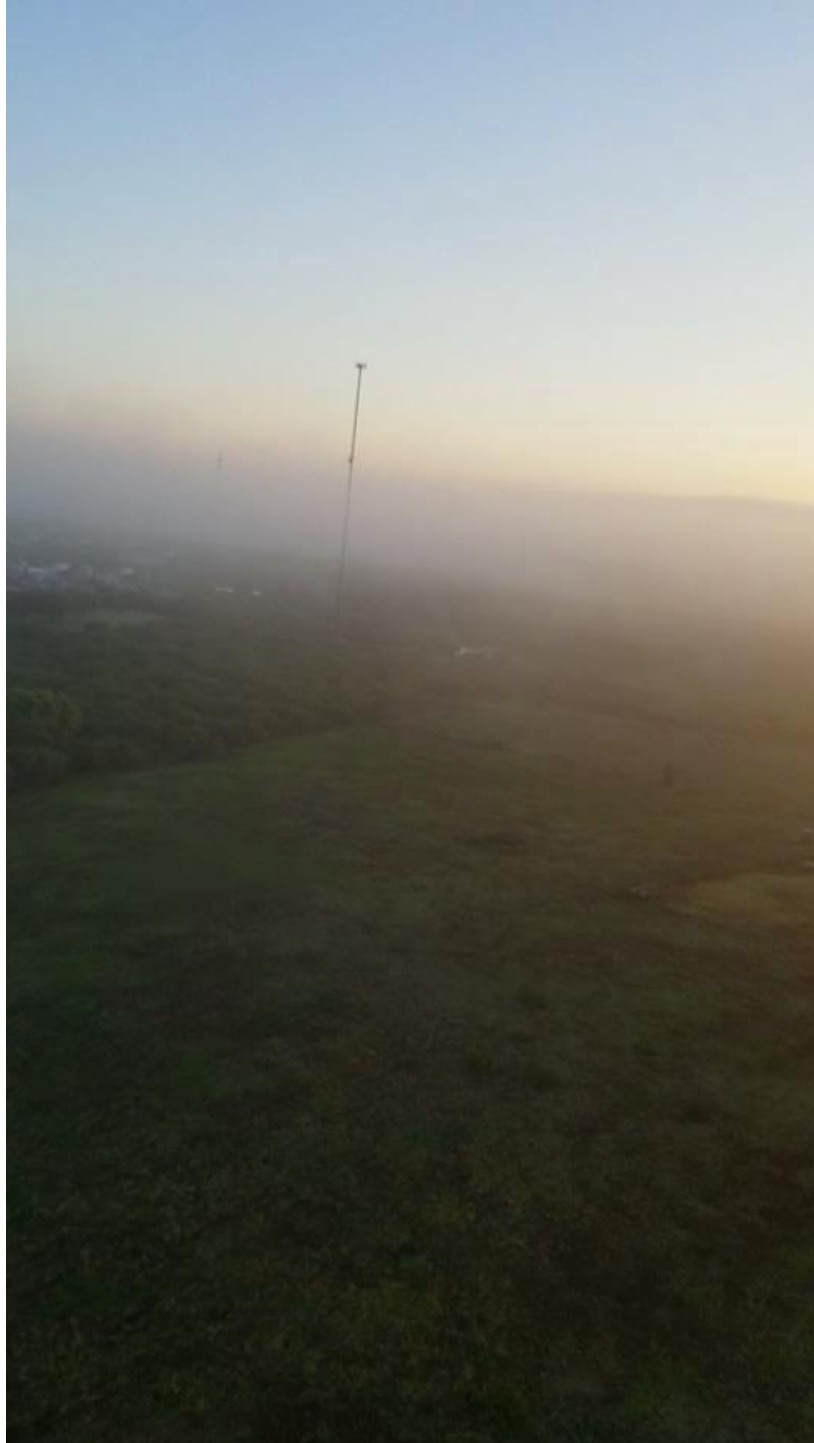
Figure 3. In-flight conditions 5 minutes after launch (about 0703).

Note: This photograph was taken 5 minutes after launch, facing north. The balloon was closer to the fog/clouds; however, the ground was visible.