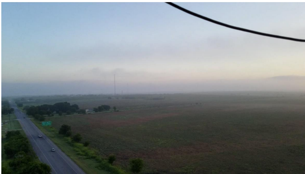
Figure 2. In-flight conditions 2 minutes after launch (about 0700).

Fog and low clouds were visible from the balloon along the flight route within minutes of launch. A passenger photograph taken 2 minutes after launch (about 0700), facing in the direction of travel, showed low clouds and fog (see figure 2). A photograph taken about 0703 showed the balloon much closer to the clouds (see figure 3). The ground crew chief stated that he saw the balloon enter "a little bit of fog" soon after it passed over a tollway (about 1.5 miles north of the launch site) and that the fog became "thicker" until he could only see the basket beneath low clouds; he stated that the basket was just above the treetops at this point. About 0717 (19 minutes after launch), a passenger captured a photograph showing reduced visibility when compared to earlier conditions (see figure 4).