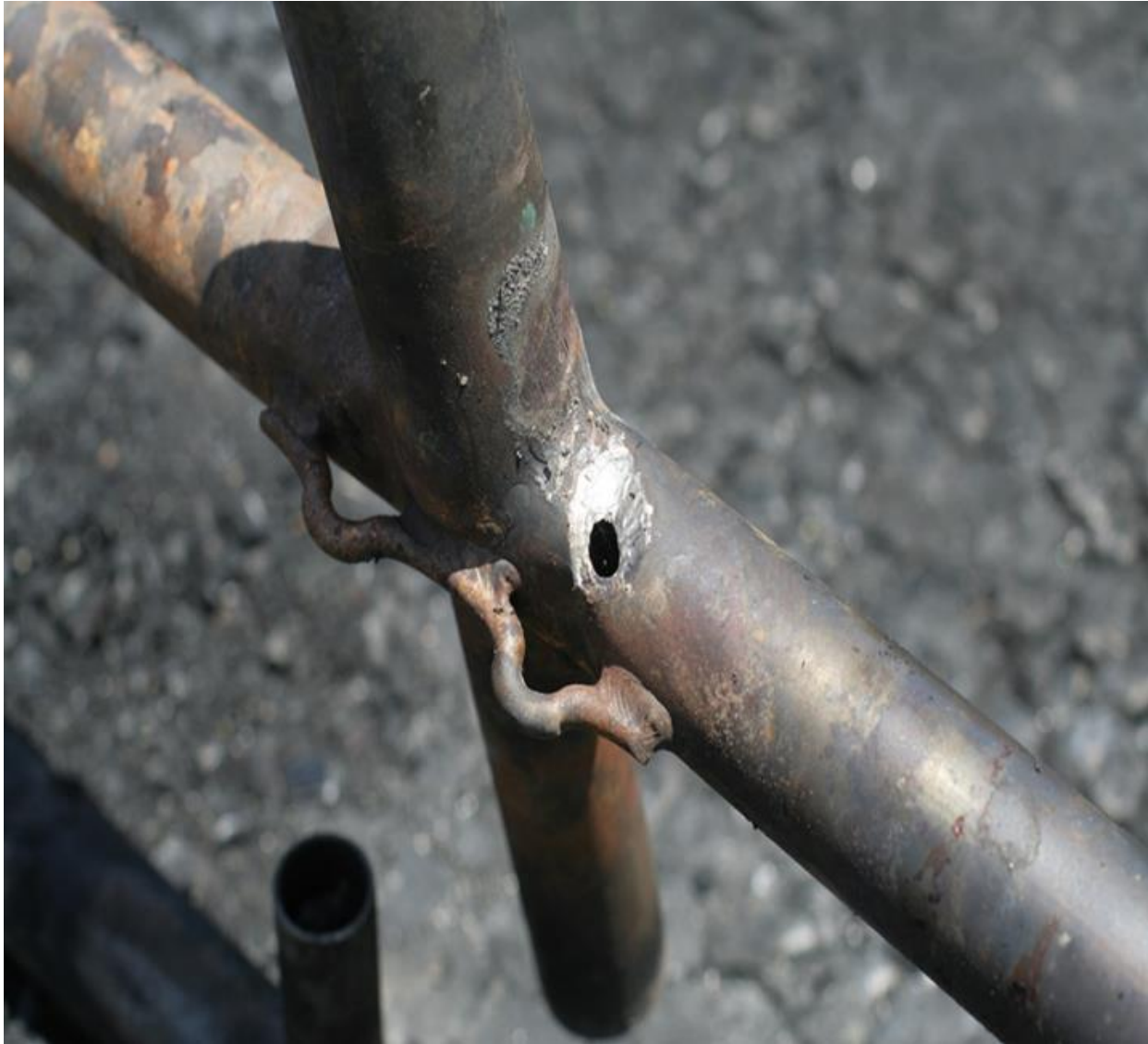
Figure 13. Arcing damage on the basket frame.