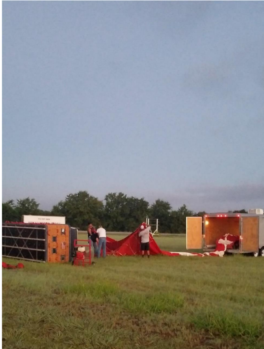
Figure 1. Weather conditions during launch preparation (about 0635).

that the pilot could not see the poles, he would cancel the flight. 7 The NTSB could not identify the poles that the pilot used to verify that visibility was acceptable. However, a passenger photograph of launch preparation showed mostly clear conditions with unrestricted visibility in the immediate vicinity; clouds/fog can be seen in the distance (see figure 1). After the pilot decided that visibility was acceptable, the balloon was inflated. The pilot also released another pibal at the launch site to evaluate the wind before making the final decision to launch.