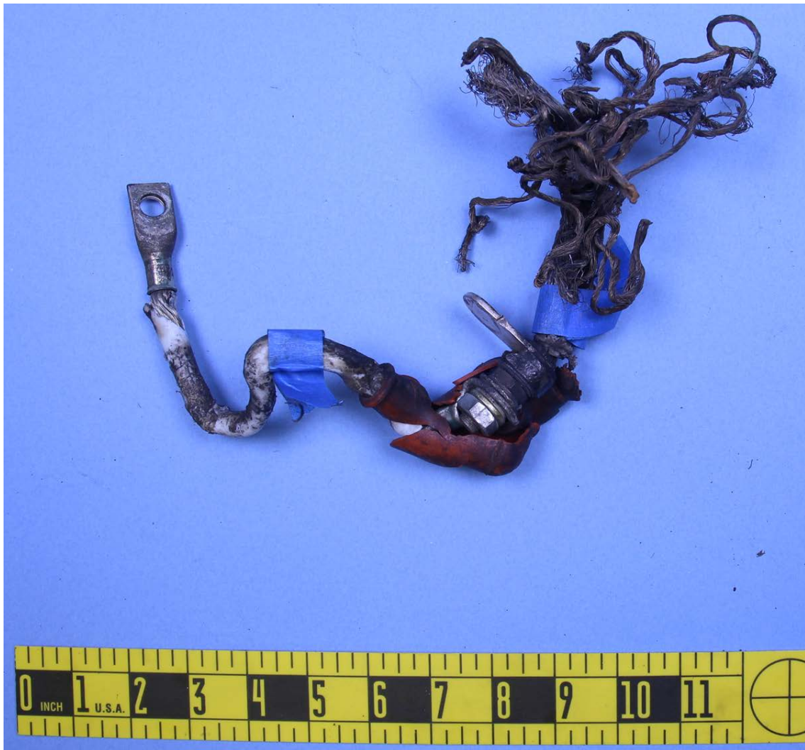
Figure 15. Overall photograph of P2B connected to P3B to Battery.