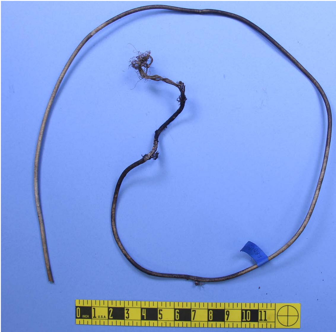
Figure 17. Overall photograph of RAD 1/2 (wire B).