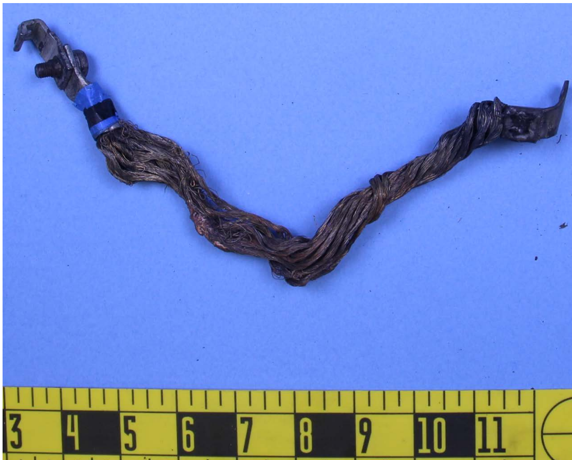
Figure 12. Overall photograph of P3H.