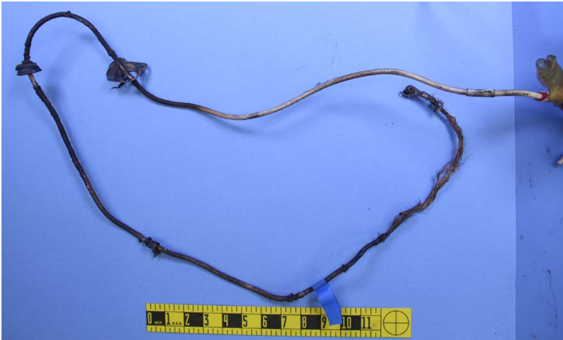
Figure 11. Overall photograph of R MAIN 1.