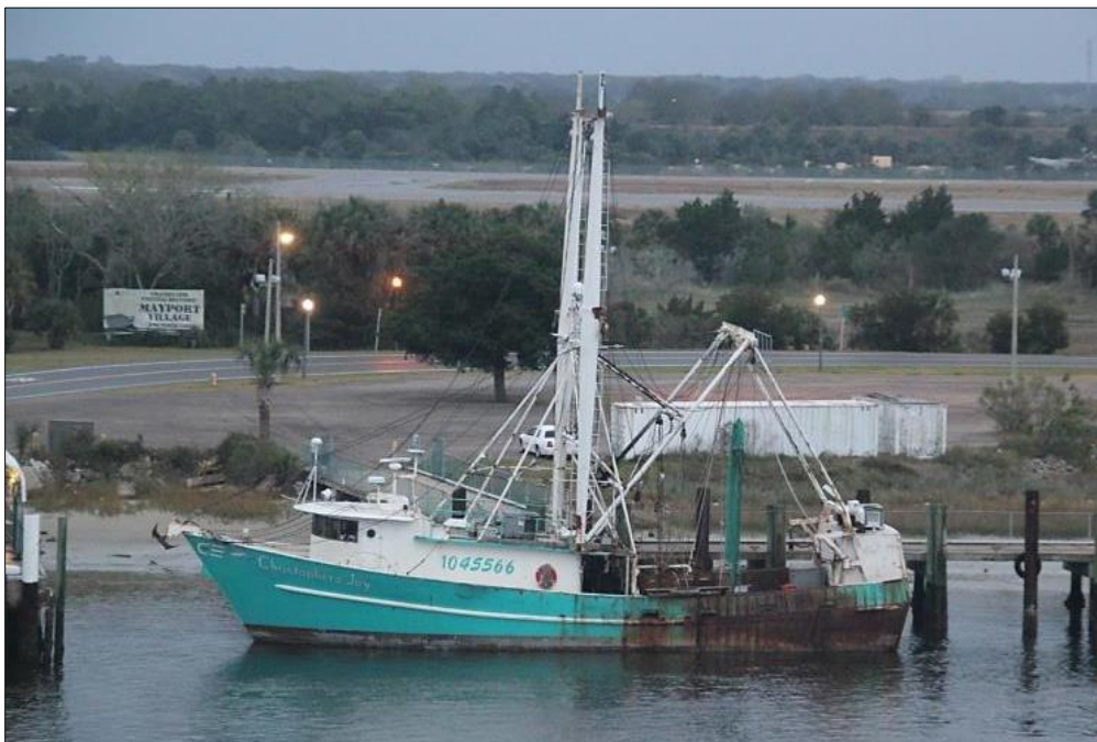
Fishing vessel Christopher's Joy moored in Mayport, Florida, in 2004.

About 1430 on September 23, 2014, the fishing vessel Christopher's Joy capsized while trawling in the Gulf of Mexico near Southwest Pass, Louisiana. The vessel sank later that day at 2057. The master and one crewmember suffered minor lacerations, and the remaining two crewmembers are presumed dead.