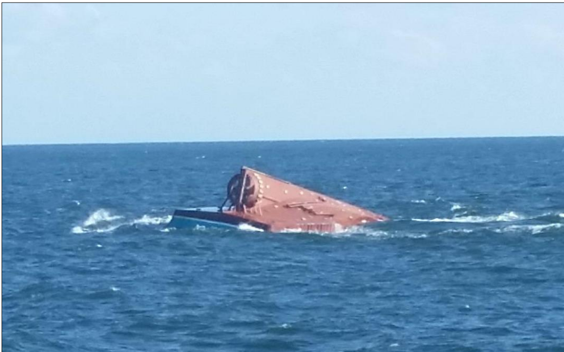
Stern of Christopher's Joy after the two surviving crewmembers were rescued.

Upon notification of the incident, the Coast Guard launched multiple assets from various commands in the area, including a cutter, a helicopter, a fixed-wing airplane, and a small boat, to search for the missing crewmembers. A nearby commercial helicopter also assisted in the search. At 1738, a Coast Guard rescue swimmer deployed to the overturned hull tried to communicate with crewmember 3, who was believed to be trapped in the engine room. The rescue swimmer heard no response, however, and did not attempt to enter the overturned hull.