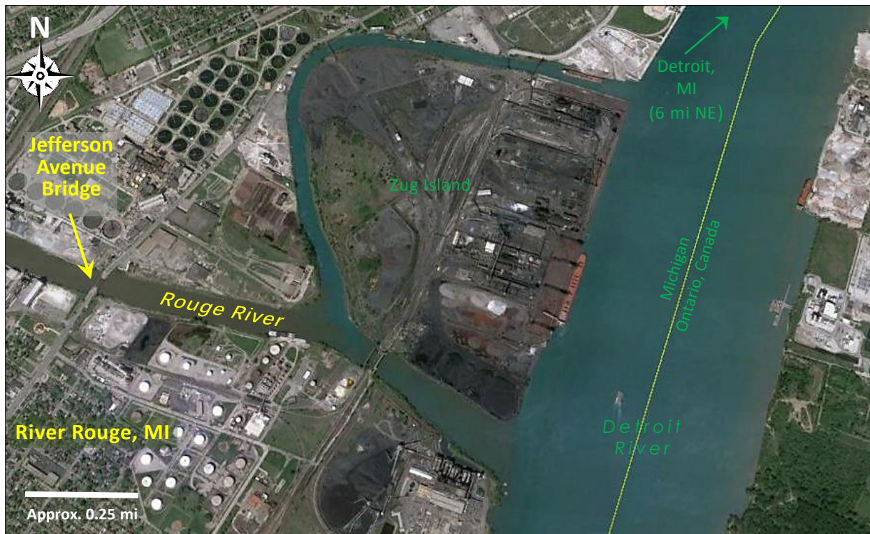
Rouge River area near the Jefferson Avenue Bridge. (Background by Google Earth)

The Herbert C. Jackson was en route to deliver a load of taconite pellets to the Severstal ore processing terminal in Dearborn, Michigan. As the vessel approached the Jefferson Avenue Bridge, the master slowed and sounded one long and one short blast of the ship's whistle to notify the bridge tender of the approach and request a bridge opening. While waiting, the master brought the vessel to a near-complete stop. About 0205, the master saw the bridge begin to open, and when the drawbridge was fully open and green lights were visible on each bridge section, he increased speed.