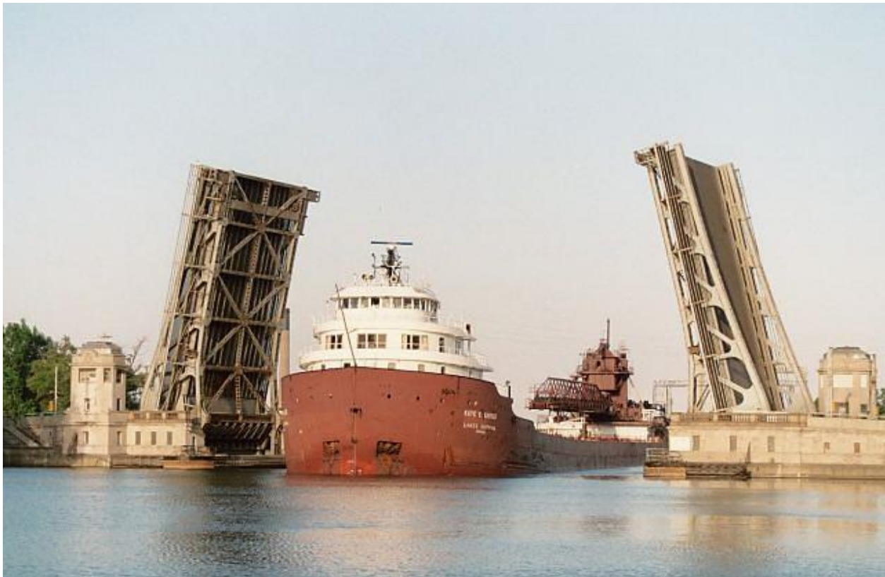
Jefferson Avenue Bridge before the accident, in the open position to allow a vessel to pass.

Damage to the Herbert C. Jackson included a 3- to 4-inch hole in the bow about 2 feet above the anchor pocket. The bridge was closed to traffic, and the cost to repair its structural steel and replace the concrete foundation was estimated at $50 million.