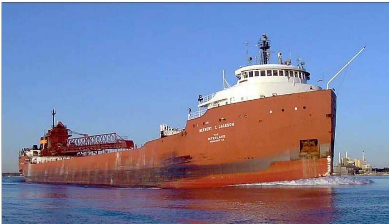
Herbert C. Jackson on the Detroit River.

About 0212 on May 12, 2013, the bulk carrier Herbert C. Jackson was cleared for passage through the Jefferson Avenue Bridge over the Rouge River about 6 miles southwest of Detroit, Michigan, when the bridge tender, who was legally intoxicated at the time, lowered the drawbridge, striking the bulk carrier's bow. Damage to the vessel was estimated at $5,000. The bridge, a registered historic structure, was extensively damaged and expected to remain closed until 2015 for repair and restoration. No one was injured.