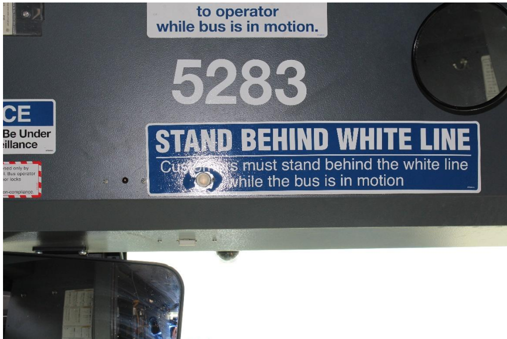
Photo #5: Interior view of signs informing passengers not to speak with driver or stand forward of white line while transit bus is in motion.