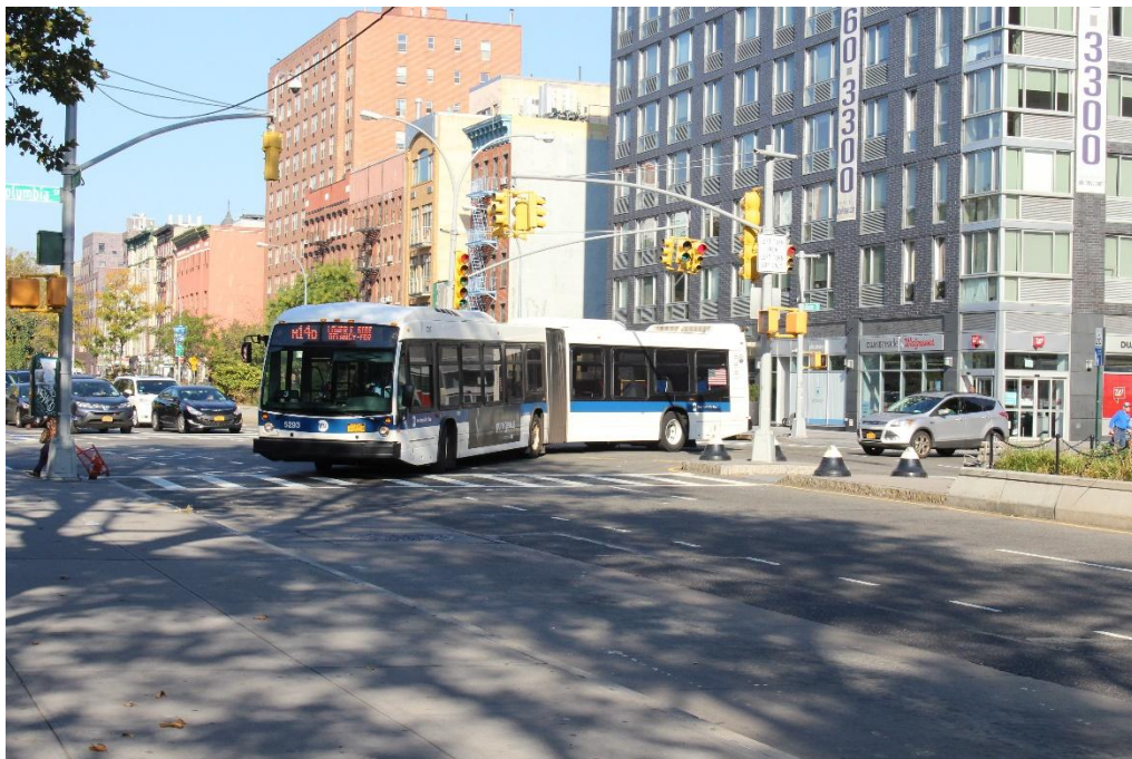
Photo #10: Exemplar transit bus at point where pedestrian in crosswalk is visible to driver.