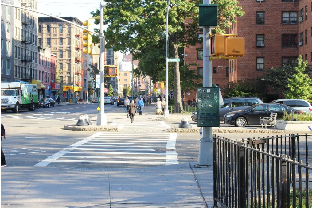
Photo #1: Intersection of East Houston Street and D Street, looking north from Columbus Street.