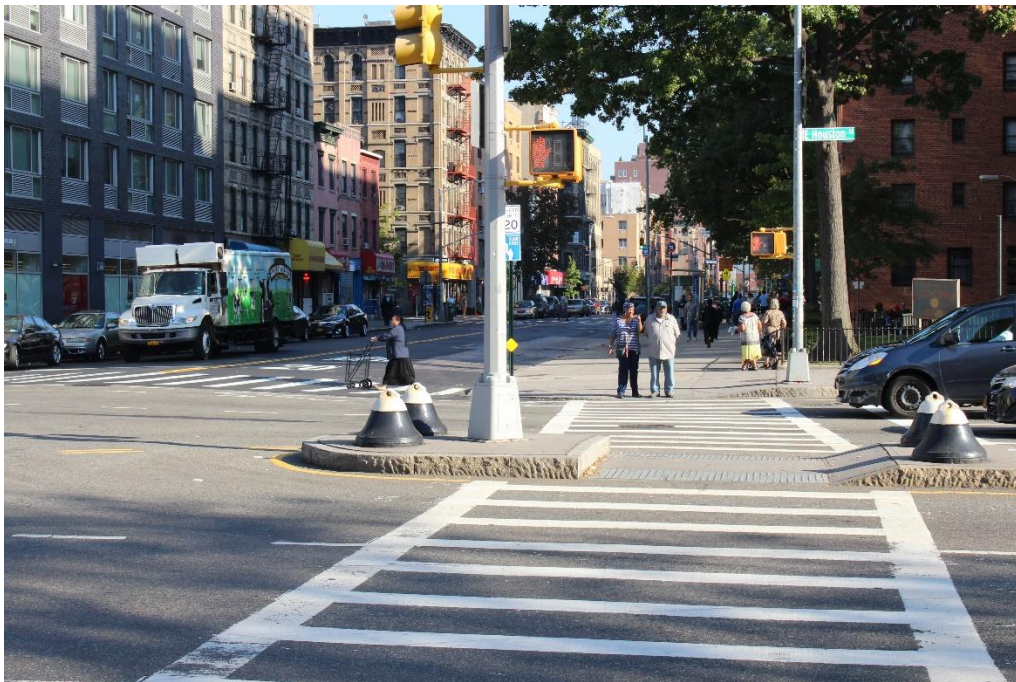
Photo #2: Close-up of marked crosswalks and concrete center median.