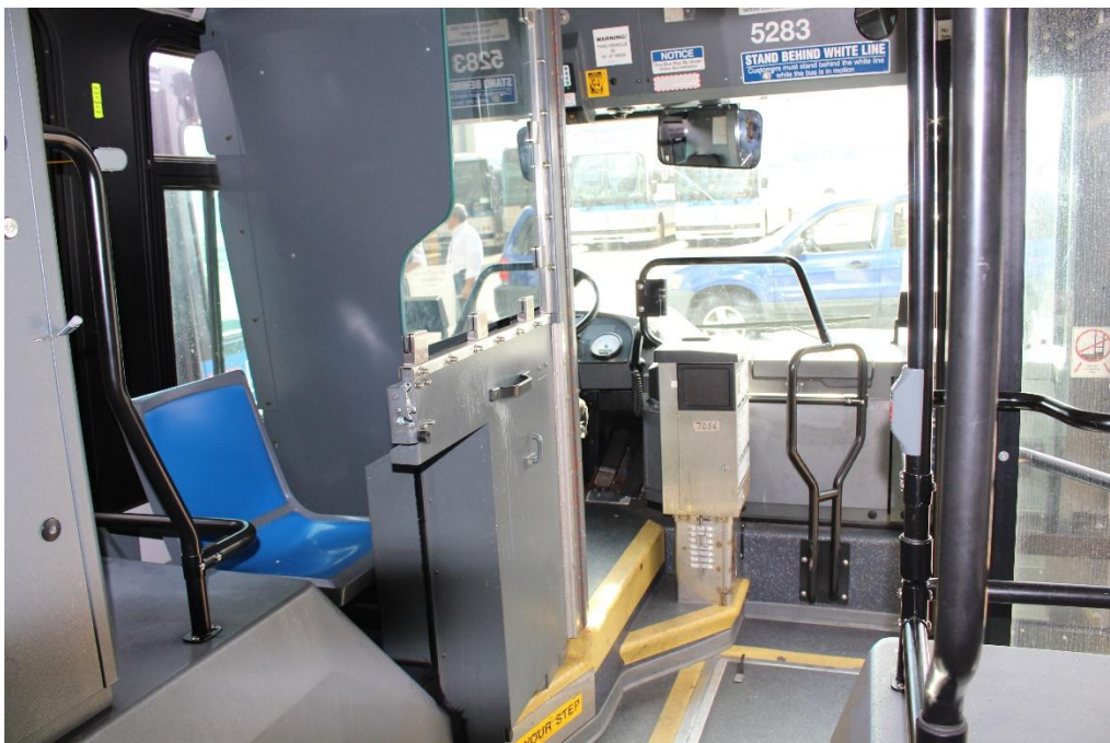
Photo #4: Interior view of front of bus and location of standing passenger during crash.