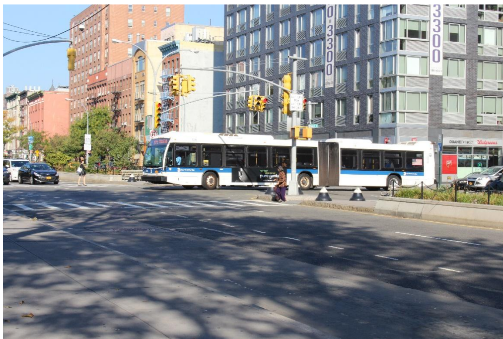
Photo #8: View of exemplar transit bus as it approaches the turn from D Street to East Houston Street.