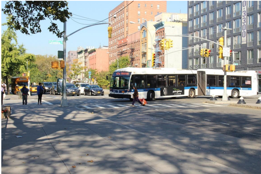
Photo #9: Exemplar transit bus executing the turn onto East Houston Street with pedestrian walking southbound in marked crosswalk.