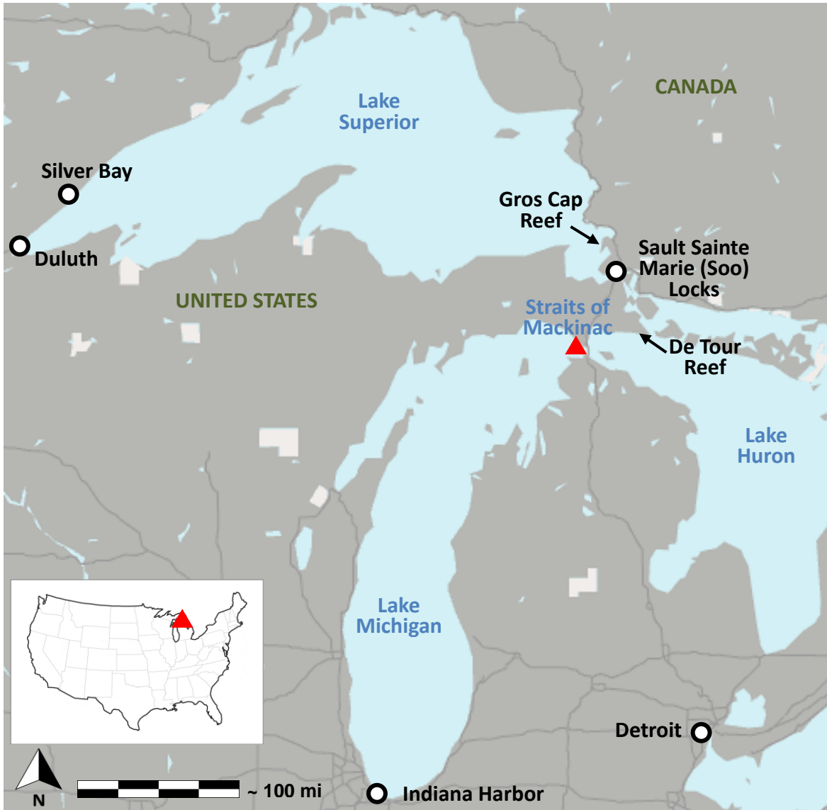
The ATB's travel area. The accident location is marked by a red triangle.

would take the ATB eastbound through Lake Superior to the Sault Sainte Marie locks, colloquially called “the Soo Locks,” on the border between the United States and Canada. After passing through the locks, the ATB would enter Lake Huron before turning west through the Straits of Mackinac and then south through Lake Michigan to its destination port of Indiana Harbor.