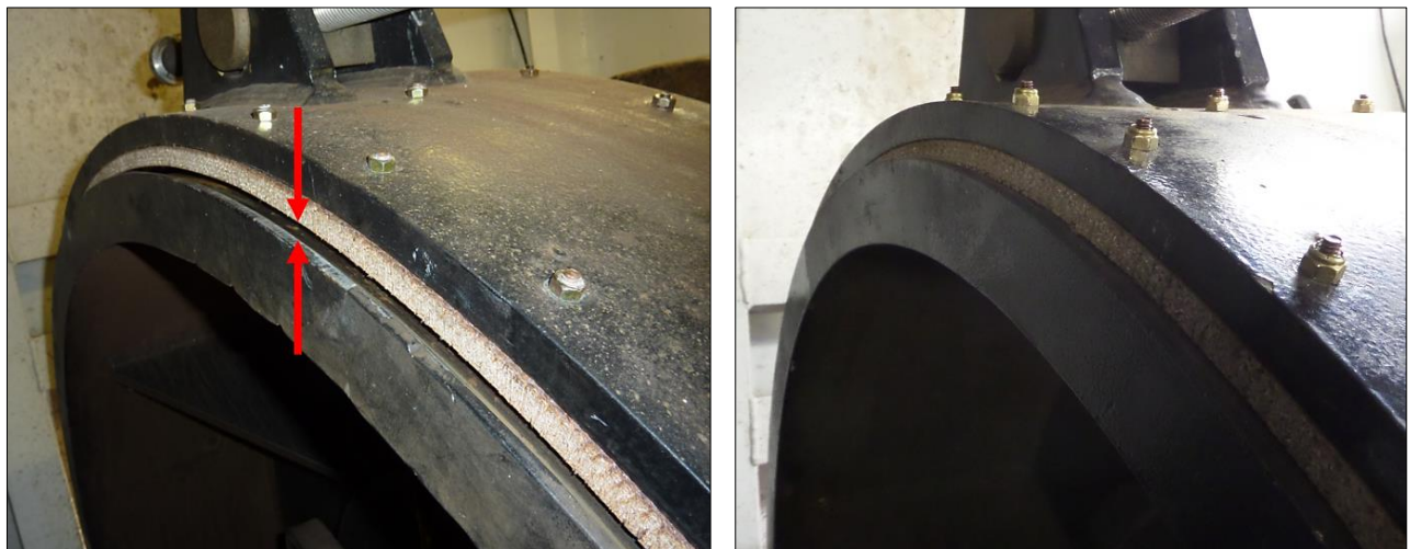
Left: Postaccident photo of the starboard anchor windlass' upper brake band liner with the brake closed. The red arrows highlight the gap at the top between the drum and liner. Right: Photo of the upper brake band liner with the brake closed after the CME technician supervised the installation and adjustment. Note the lack of gap between the brake band liner and the drum.

According to CME's field service report, "upon inspection at winch, noticed brake band was out of adjustment." CME noted no problems with the anchor windlass assembly and, after the adjustment, the anchor was tested with satisfactory results.