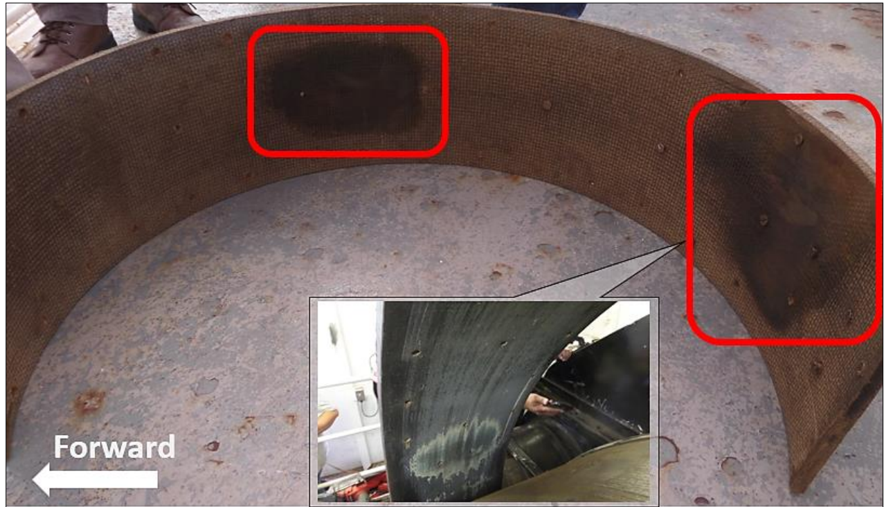
Photo of the upper brake band liner for the starboard anchor. Highlighted in red are the friction marks on the liner. The inset shows the paint worn from heat accumulation through the liner aft section of the upper band.

According to CME's field service report, "upon inspection at winch, noticed brake band was out of adjustment." CME noted no problems with the anchor windlass assembly and, after the adjustment, the anchor was tested with satisfactory results.