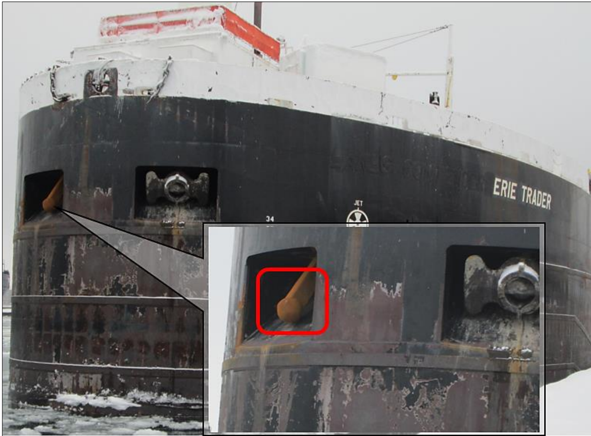
The bow of barge Erie Trader after the accident. An inset highlights the remnant shank of the starboard anchor in the anchor pocket.

The anchor also struck the west leg of Enbridge's Line 5 dual pipeline, causing one minor dent in one pipeline and two minor dents in the other. Both lines were determined to be structurally sound.