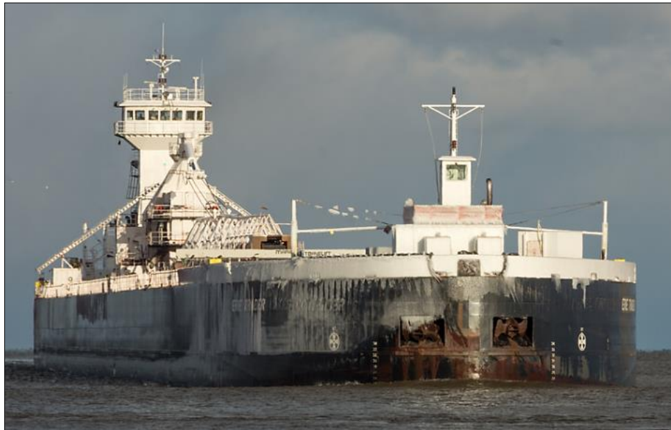
ATB Clyde S VanEnkevort/Erie Trader.

At 1732 local time on April 1, 2018, the articulated tug and barge (ATB) Clyde S VanEnkevort/Erie Trader was westbound with a crew of 14 in the Straits of Mackinac, Michigan, when the barge's starboard anchor, which had unknowingly released and was dragging on the bottom, struck and damaged three underwater electrical transmission cables and two oil pipelines. About 800 gallons of dielectric mineral oil leaked into the water from the cables; the oil pipelines sustained only superficial damage. Repair and replacement of the cables was estimated at more than $100 million. No injuries were reported.