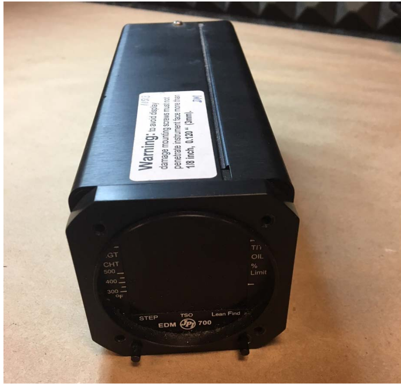
Figure 2. View of side of engine data monitor