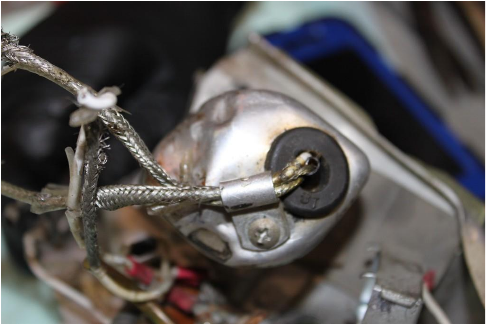
Photo 19 - NTSB Digital Photograph. View of the Aft Portion of the Ignition Switch. Note the Impact Damage to the Rear Cover