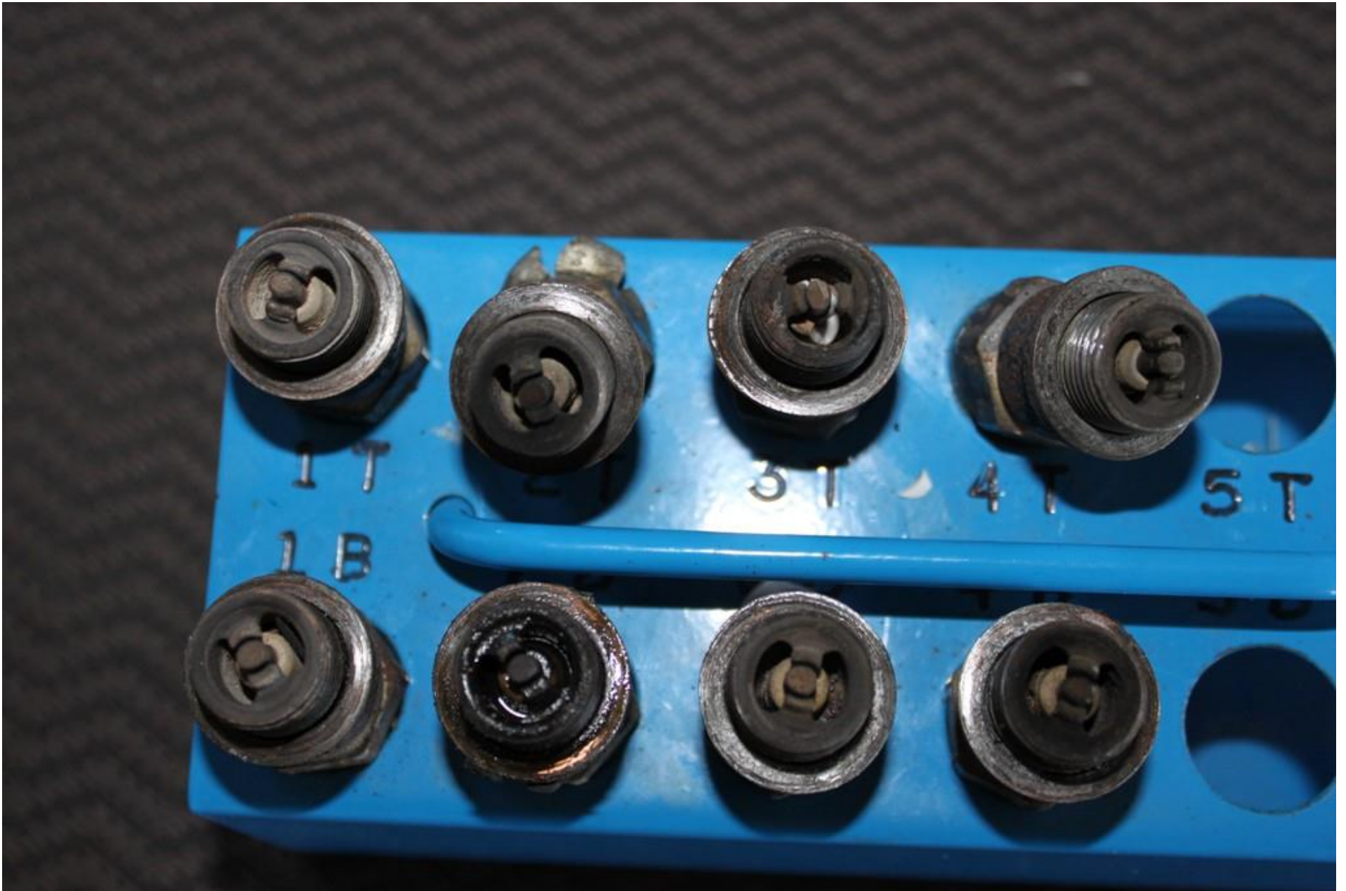
Photo 17 - NTSB Digital Photograph. View of the Upper and Lower Spark Plugs