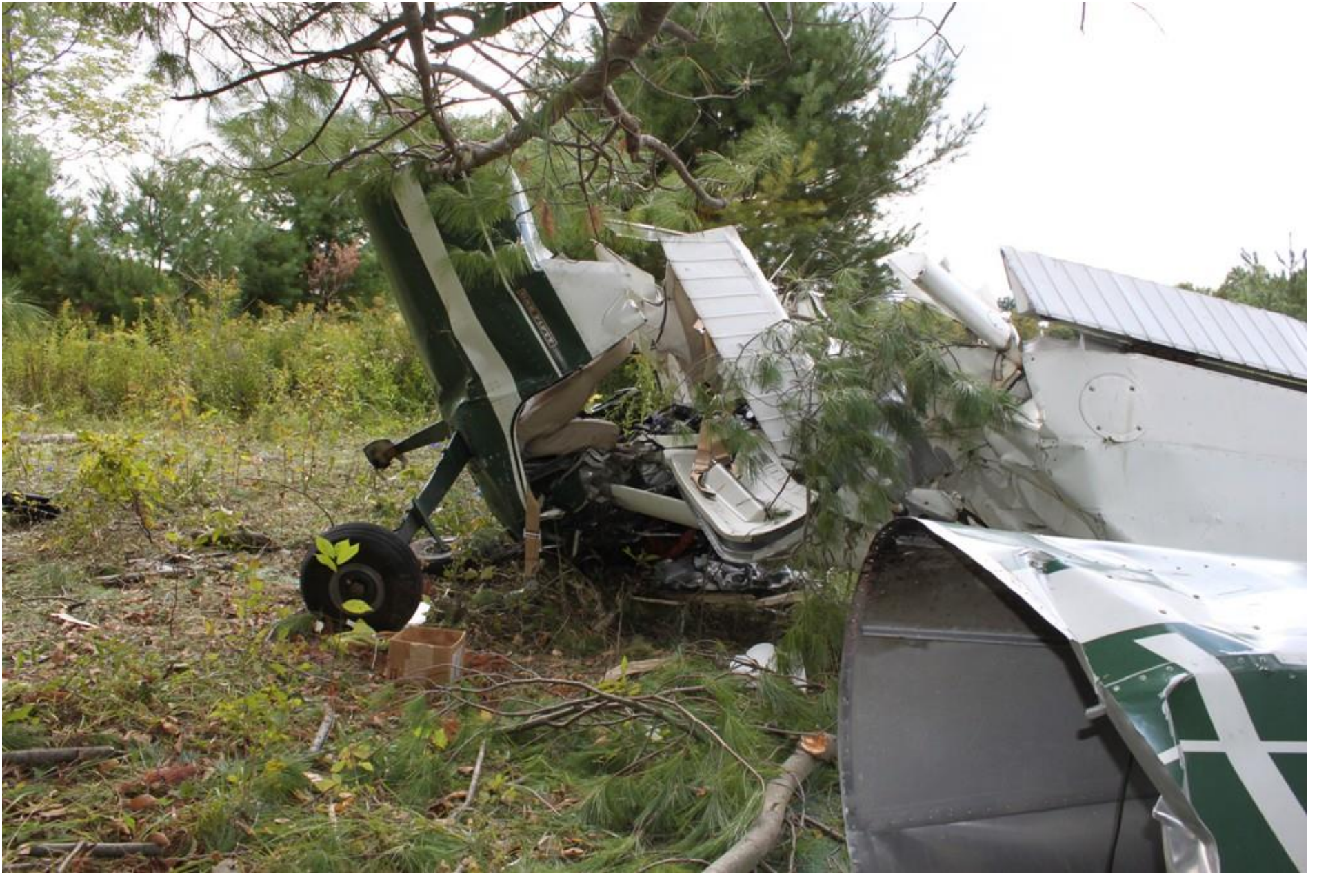
Photo 3 - NTSB Digital Photograph. Right Side View of the Wreckage.