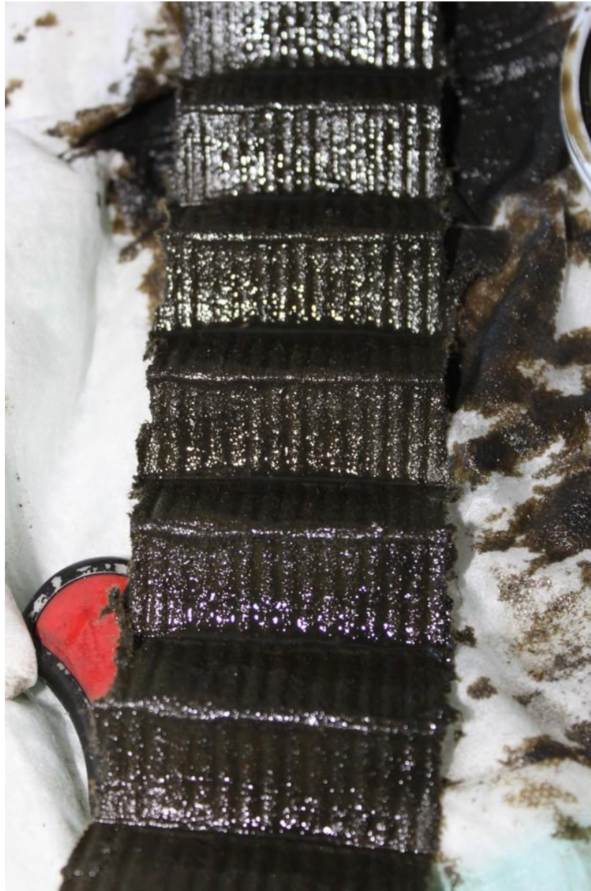
Photo 18 - NTSB Digital Photograph. View of the Oil Filter Element