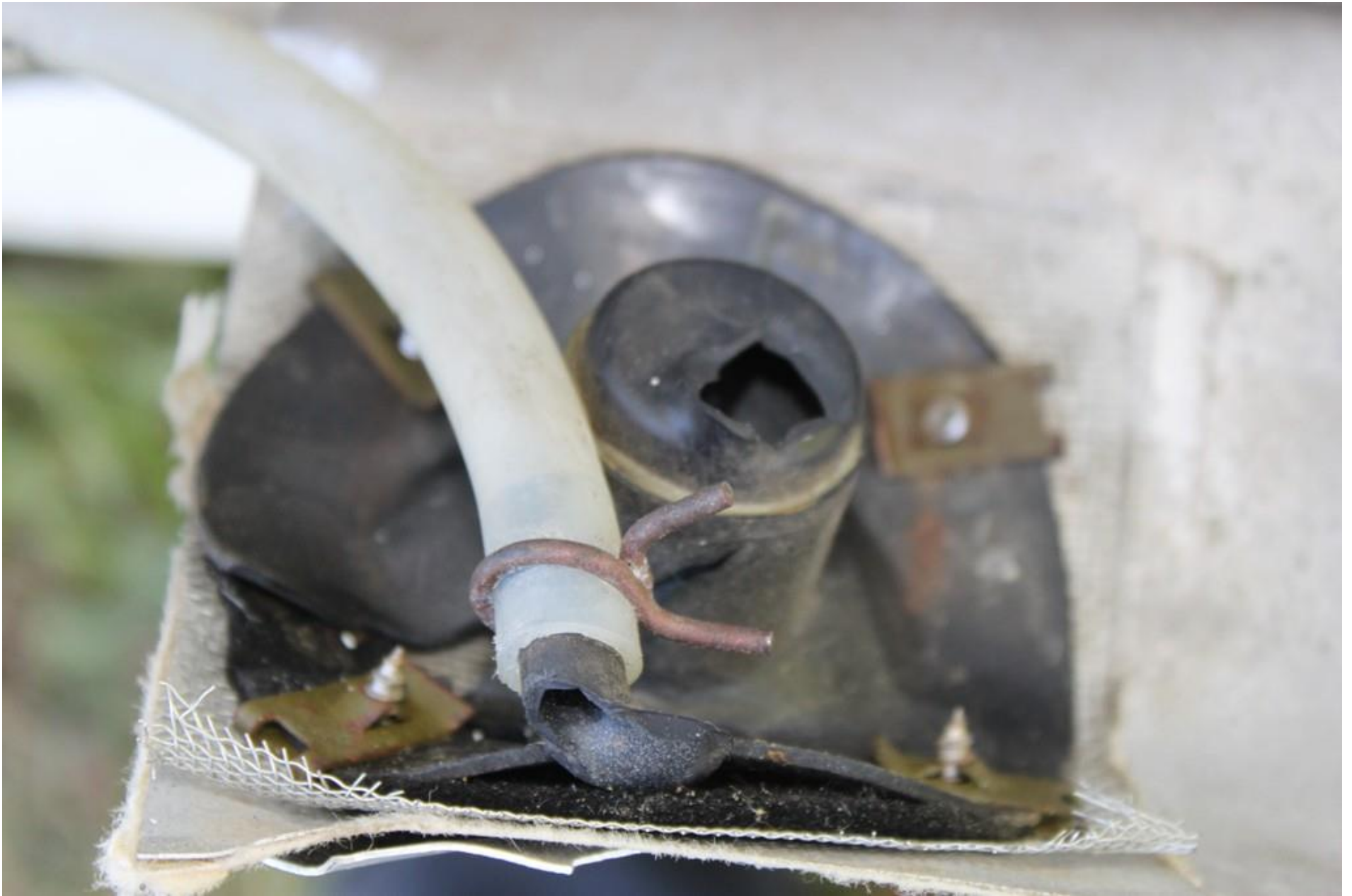
Photo 13 - NTSB Digital Photograph. View of the Stall Warning Horn Housing