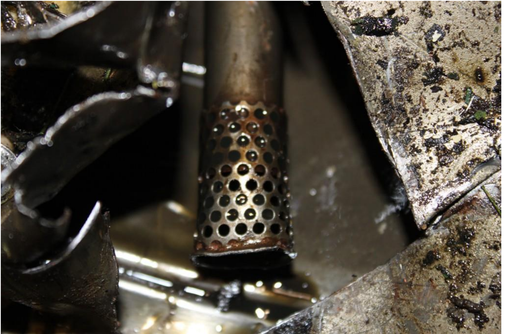
Photo 15 - NTSB Digital Photograph. View of the Oil Pickup Screen