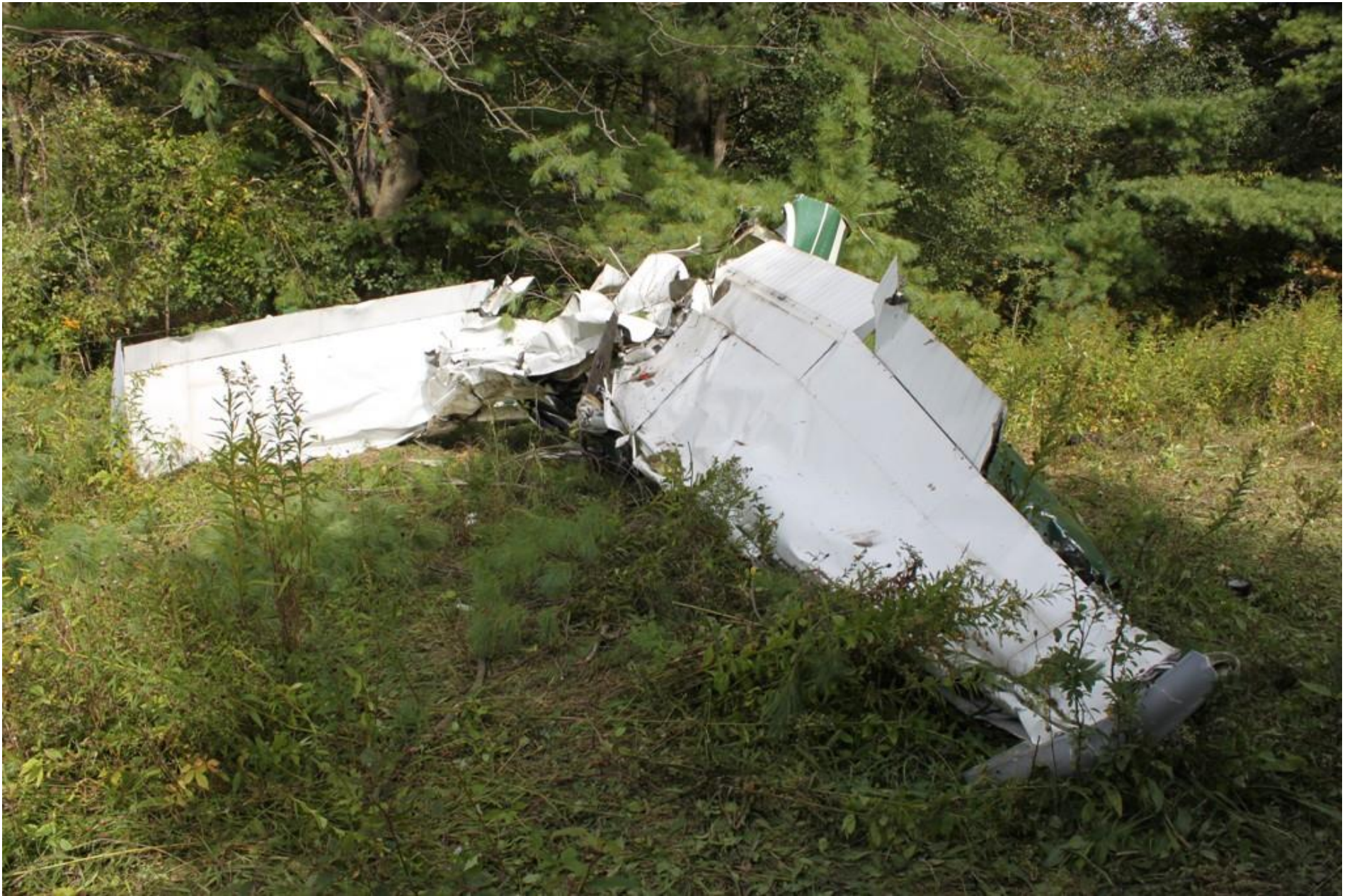
Photo 1 – NTSB Digital Photograph. Left Forward Quartering View of the Wreckage.