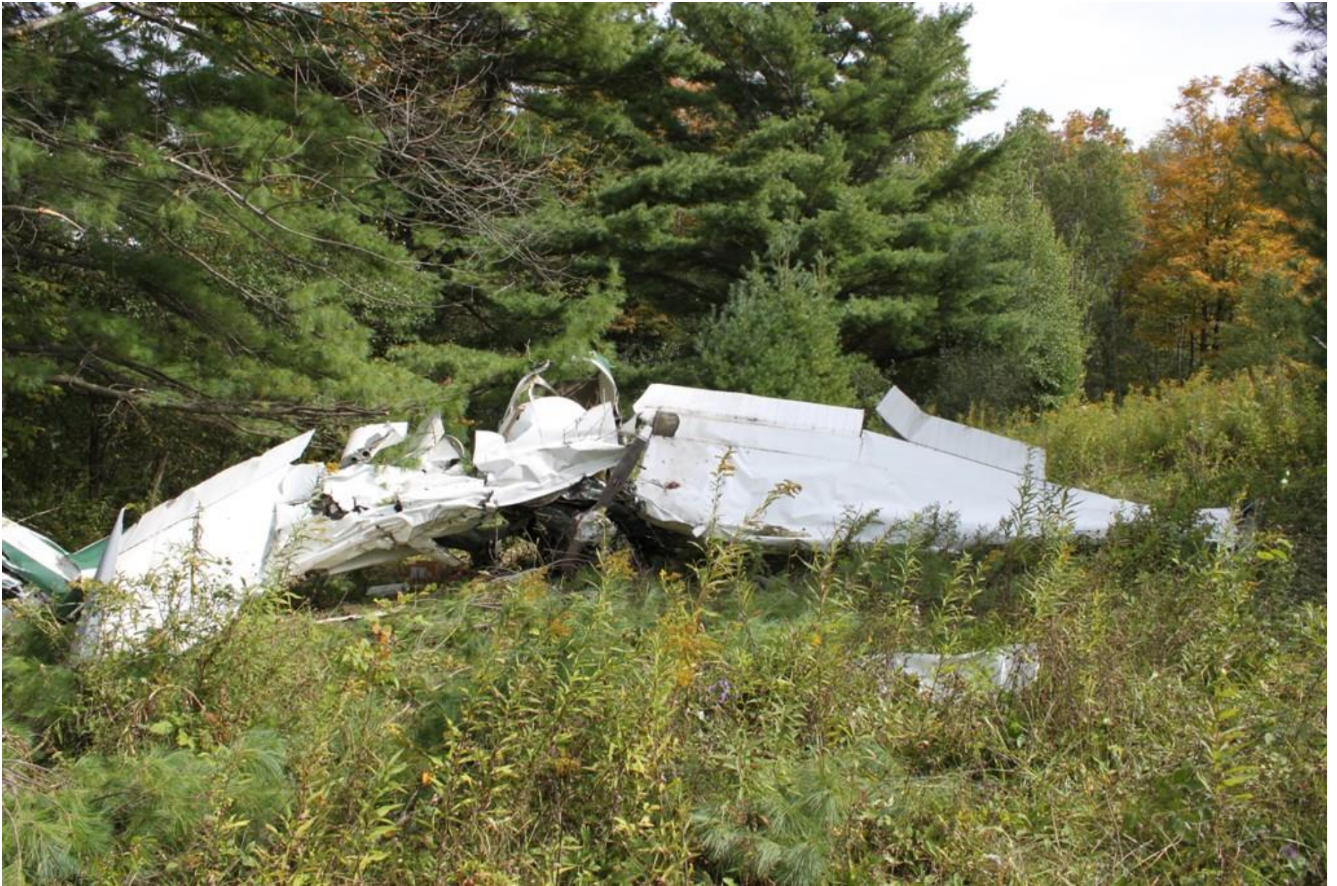
Photo 2 - NTSB Digital Photograph. Forward View of the Wreckage.