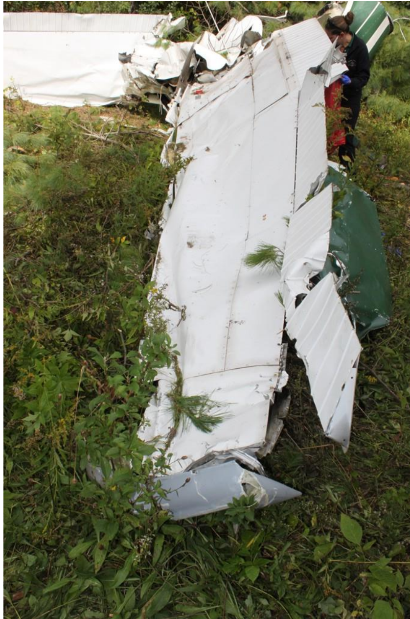
Photo 7 - Left Side View of the Left Wing