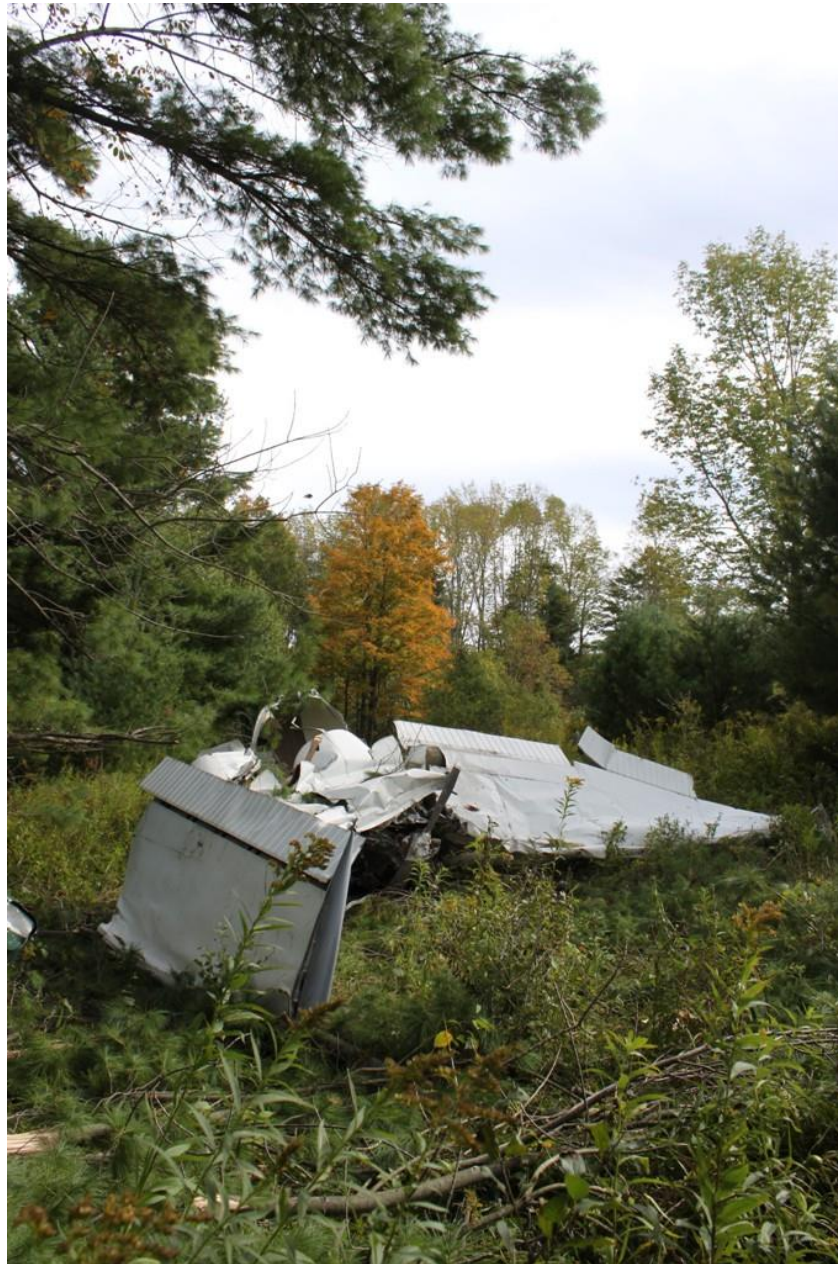
Photo 6 - NTSB Digital Photograph. Right Forward Quartering View of the Main Wreckage