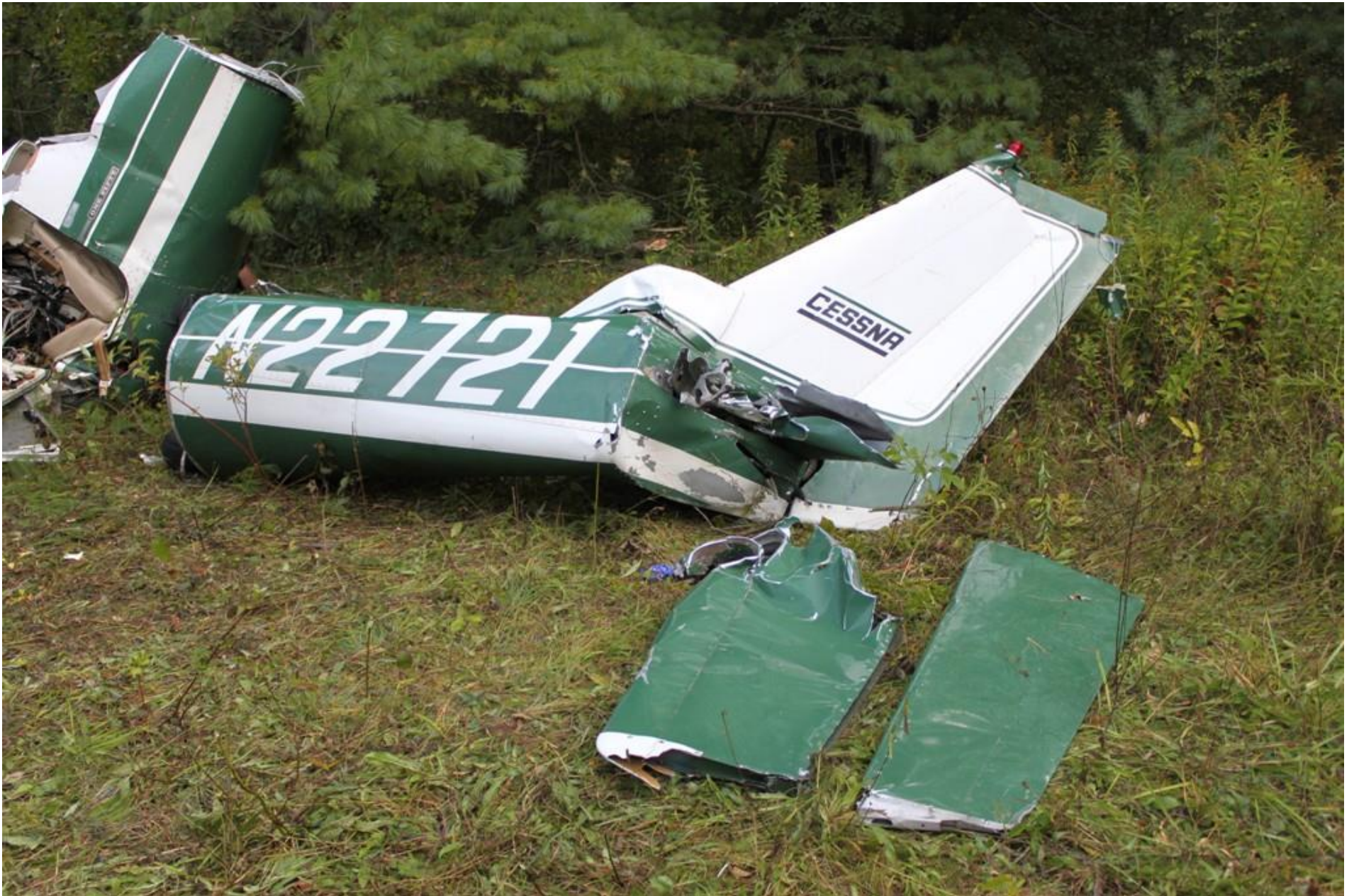
Photo 8 - Left Side View of the Empennage