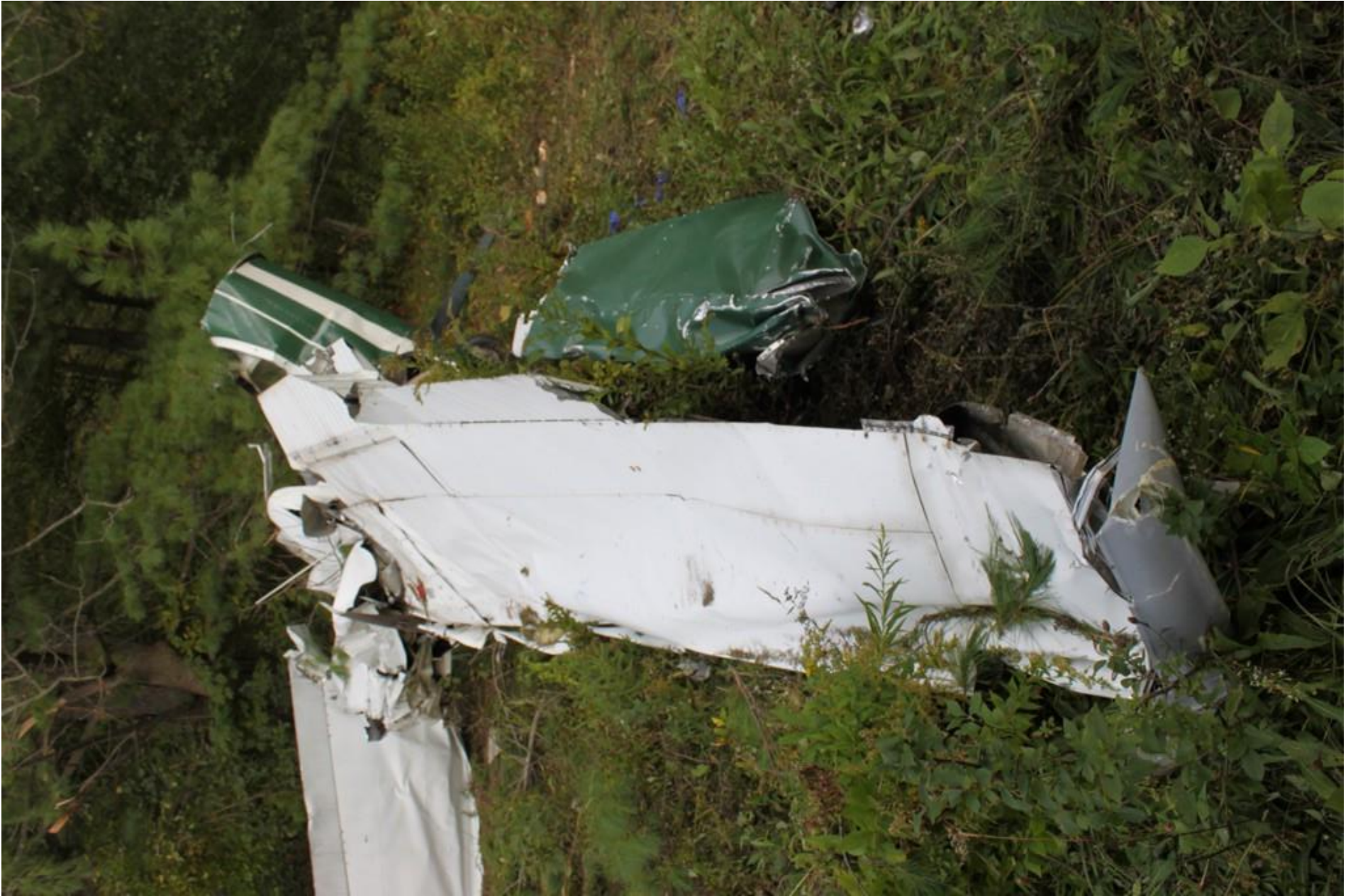
Photo 5 - NTSB Digital Photograph. View of the Left Wing