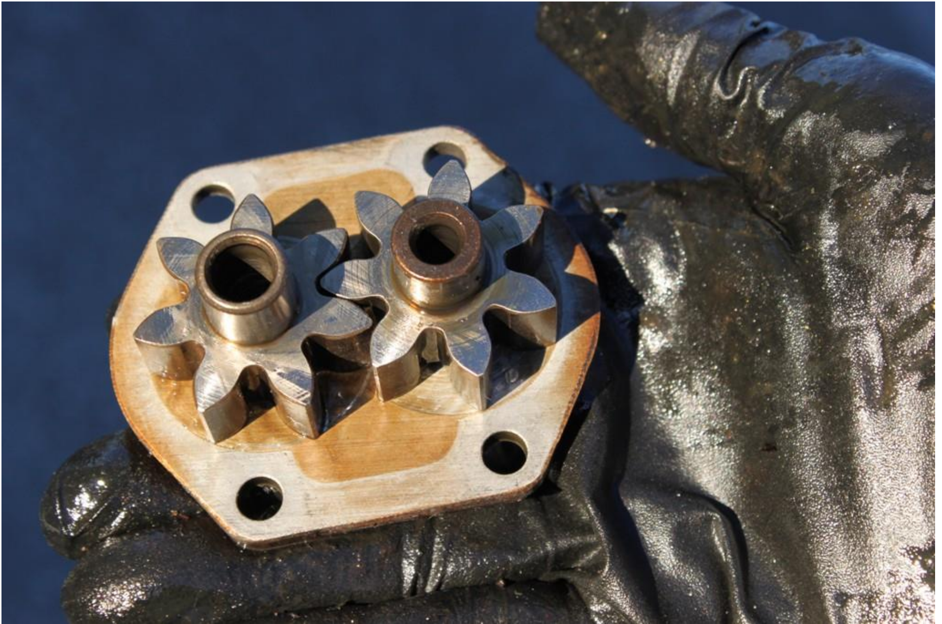
Photo 20 - NTSB Digital Photograph. View of the Oil Pump Gears