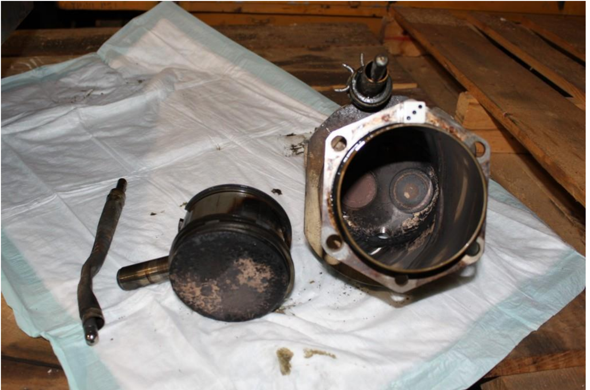
Photo 16 - NTSB Digital Photograph. View of the No. 3 Cylinder and Piston