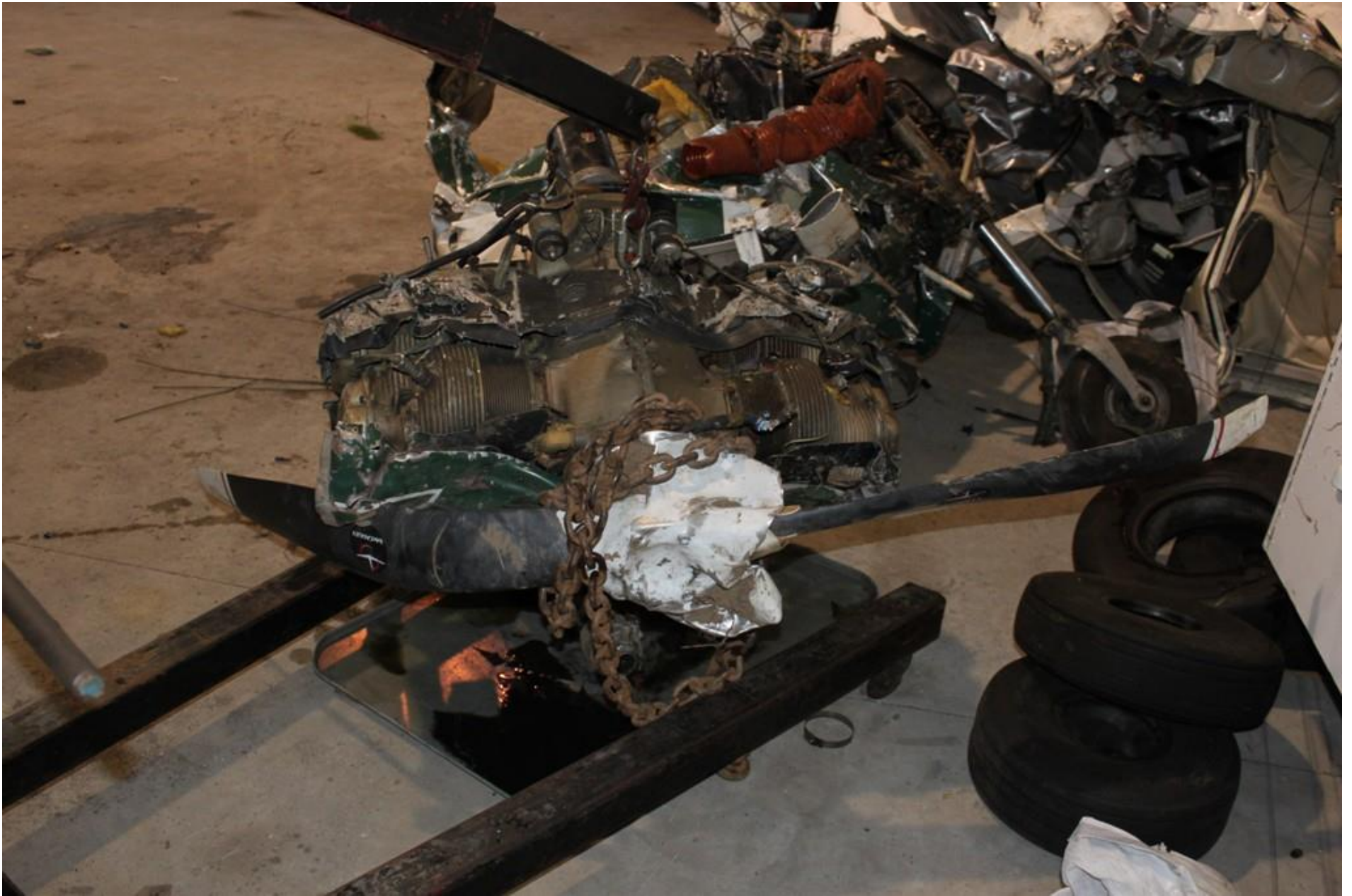
Photo 14 - NTSB Digital Photograph. Forward View of the Engine Assembly with Attached Propeller