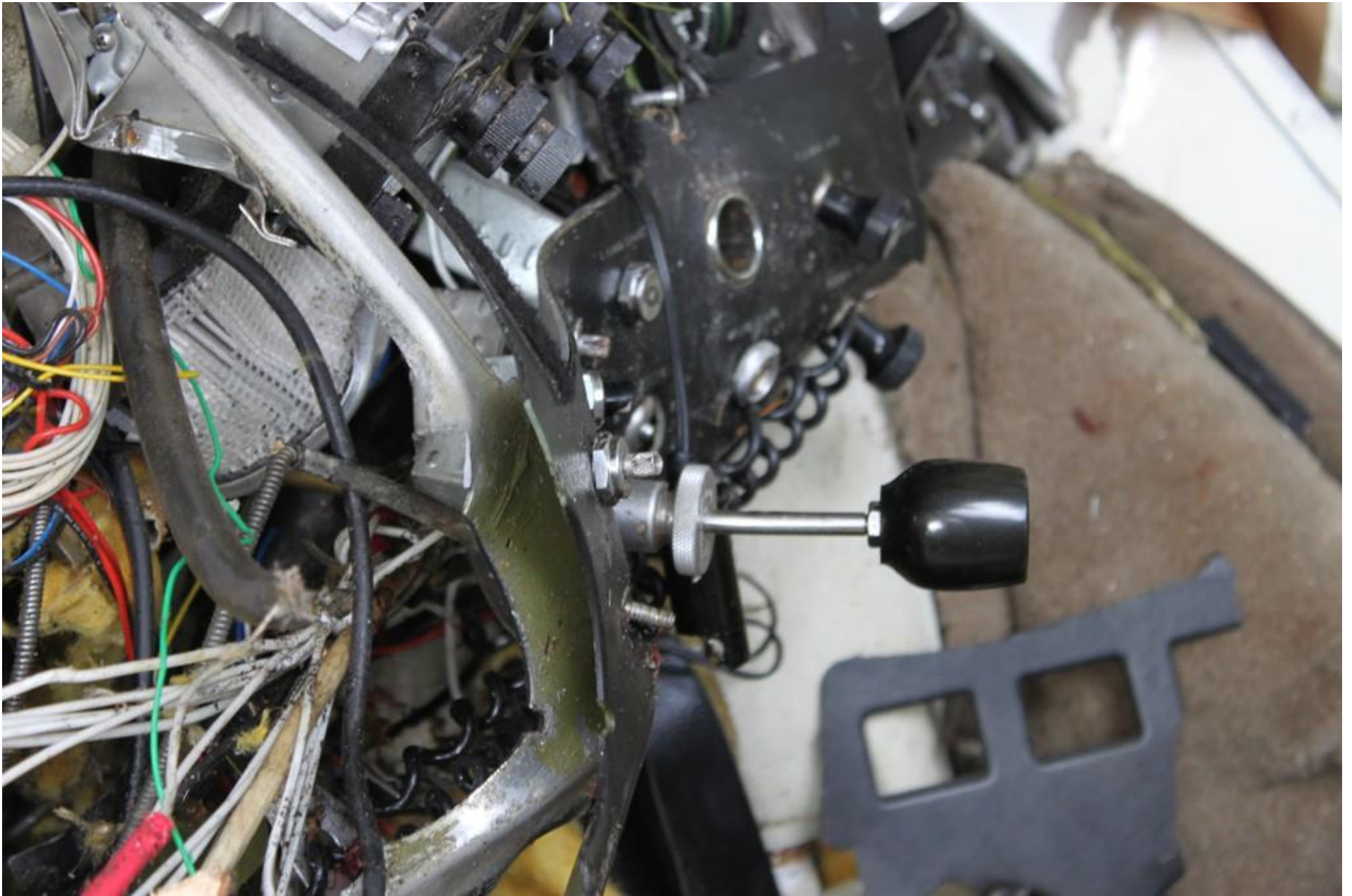
Photo 4 - NTSB Digital Photograph. View of the Throttle Control Extended 1.75 inches