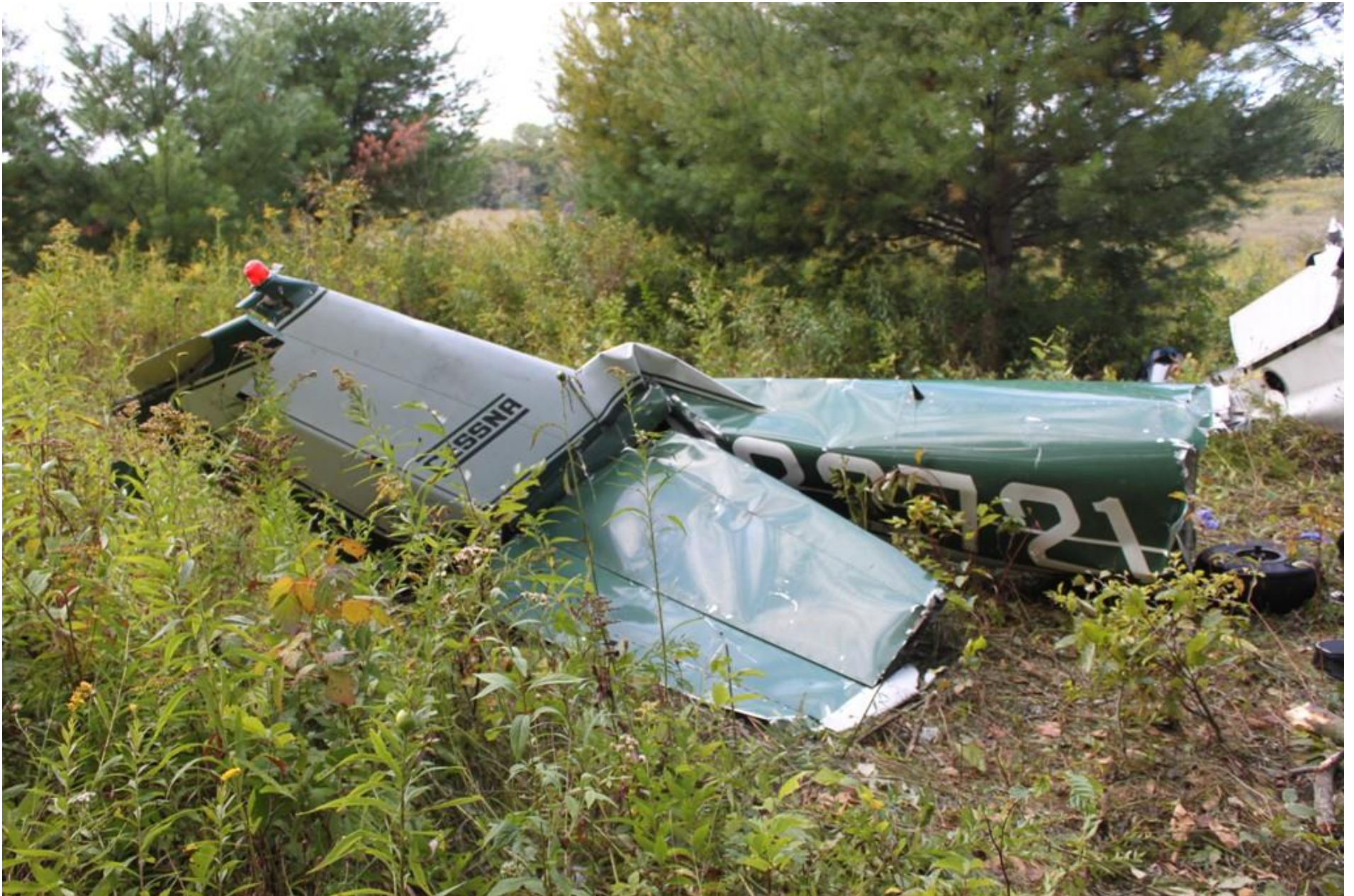
Photo 9 – NTSB Digital Photograph. Right Side View of the Empennage