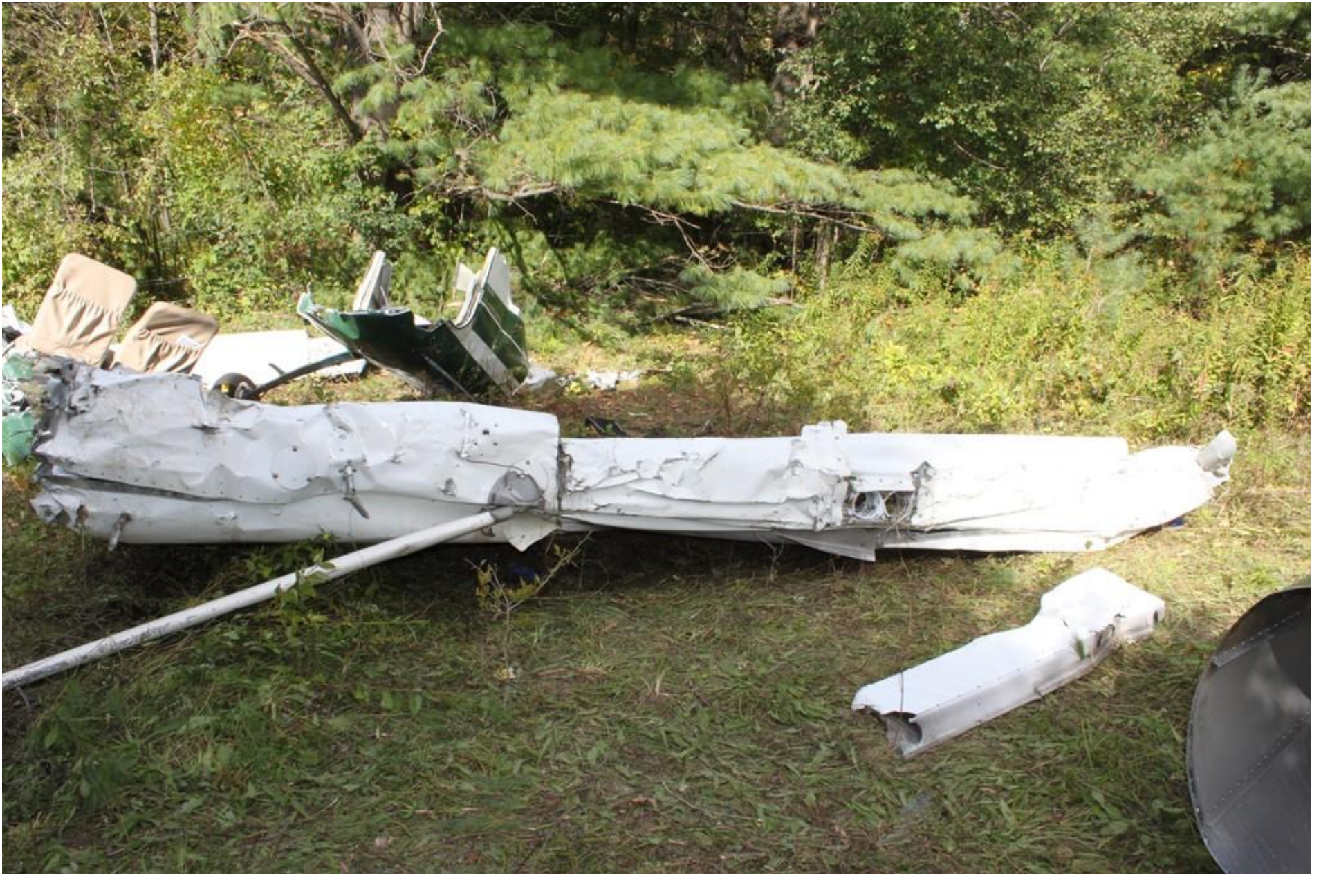
Photo 12 - NTSB Digital Photograph. Forward View of the Left Wing. Note the Full Span Leading Edge Crushing