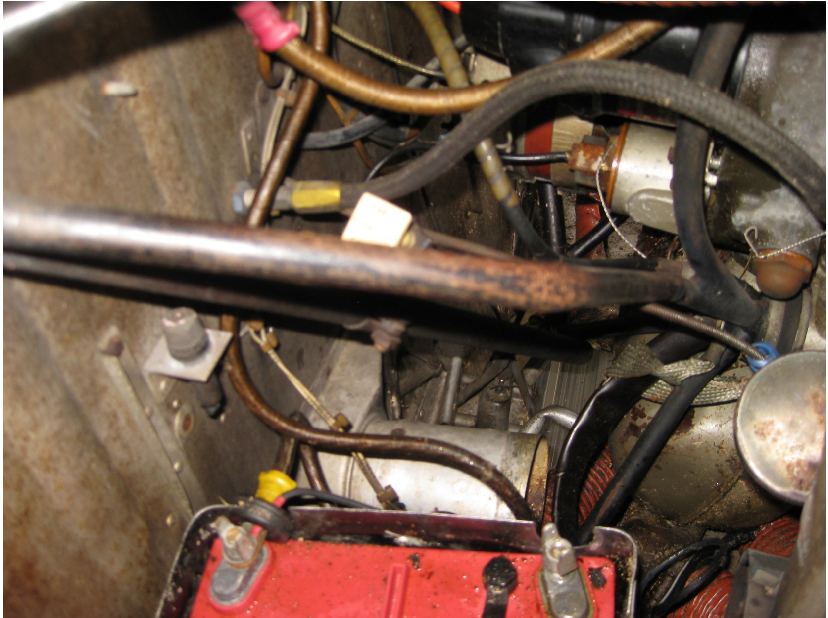
Photo 2 – View of Bent Engine Mount [the closest one]