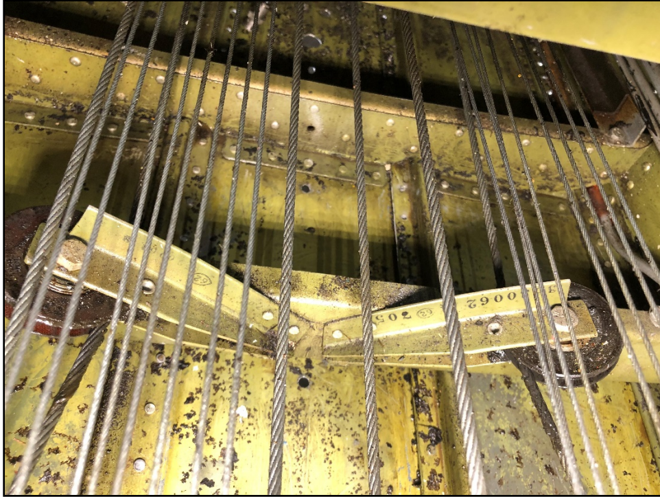
Photograph 2 2 – Damaged former (station 134).