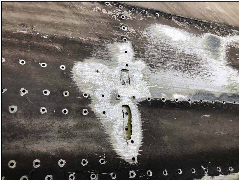
Photograph 4 5 – Lower fuselage skin damage to station 180.