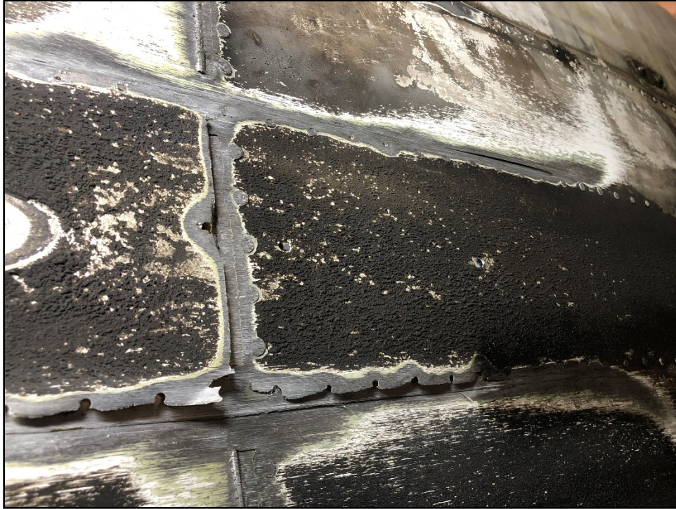
Photograph 4 4 – Lower fuselage skin damage between stations 134 and 165.