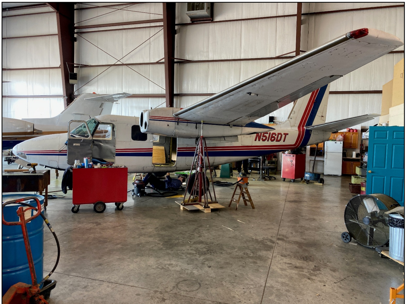
Photograph 1 1 – Accident airplane – left side view.