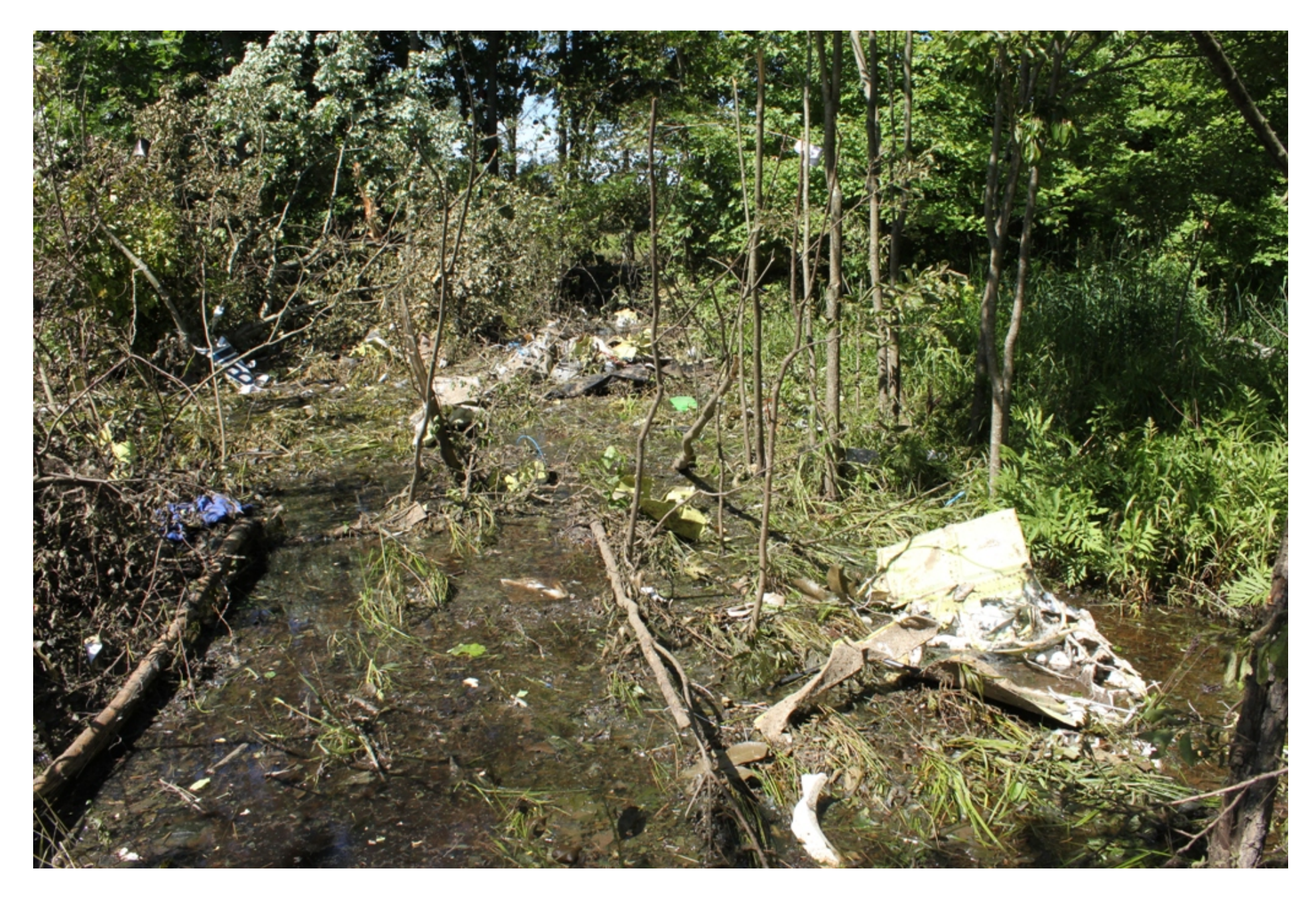
Photo 6 - NTSB Digital Photograph. Another View of Fragmented Wreckage at Accident Site.