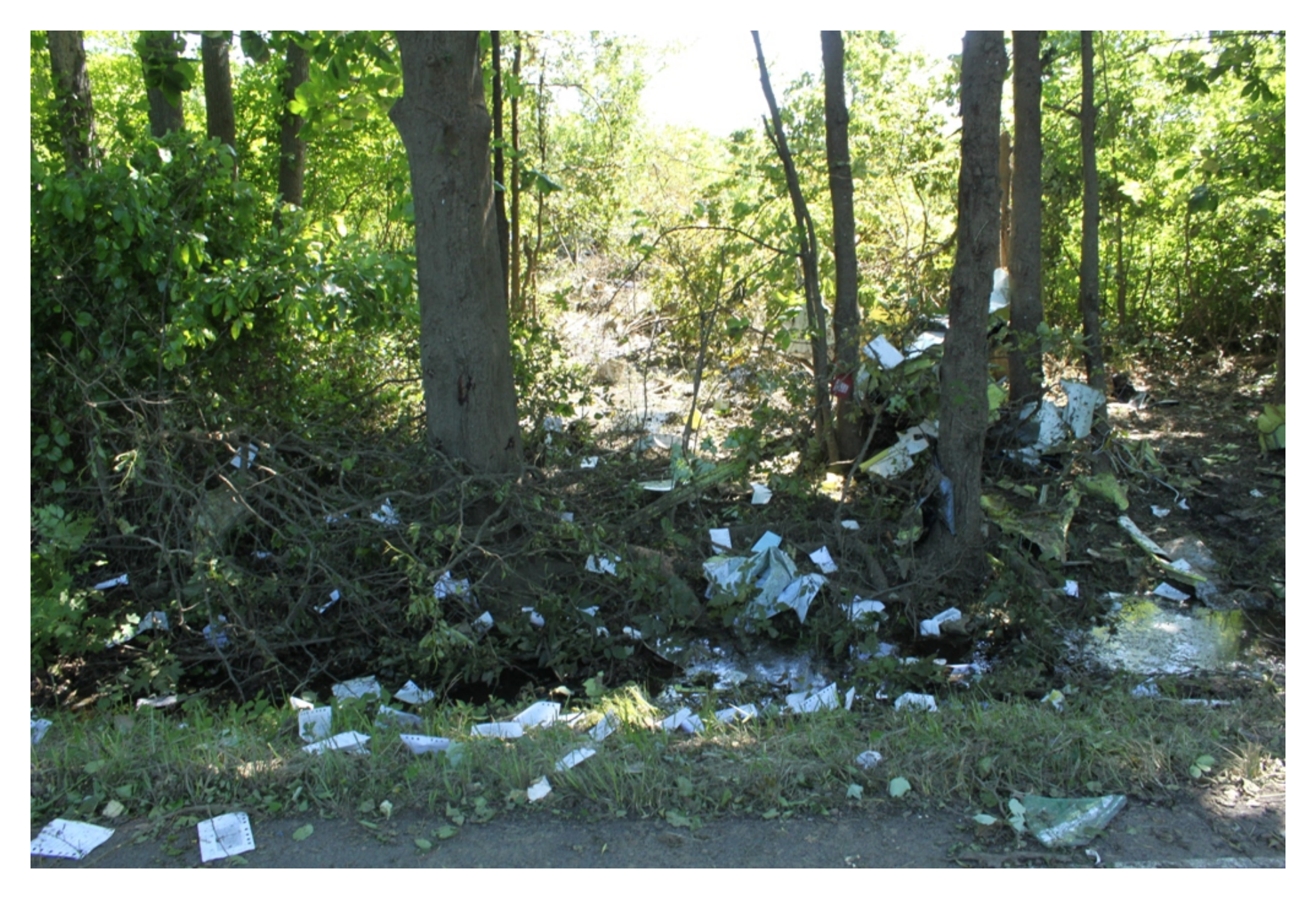
Photo 4 - NTSB Digital Photograph. View of Charts, Papers, and Wreckage located Adjacent to Road.