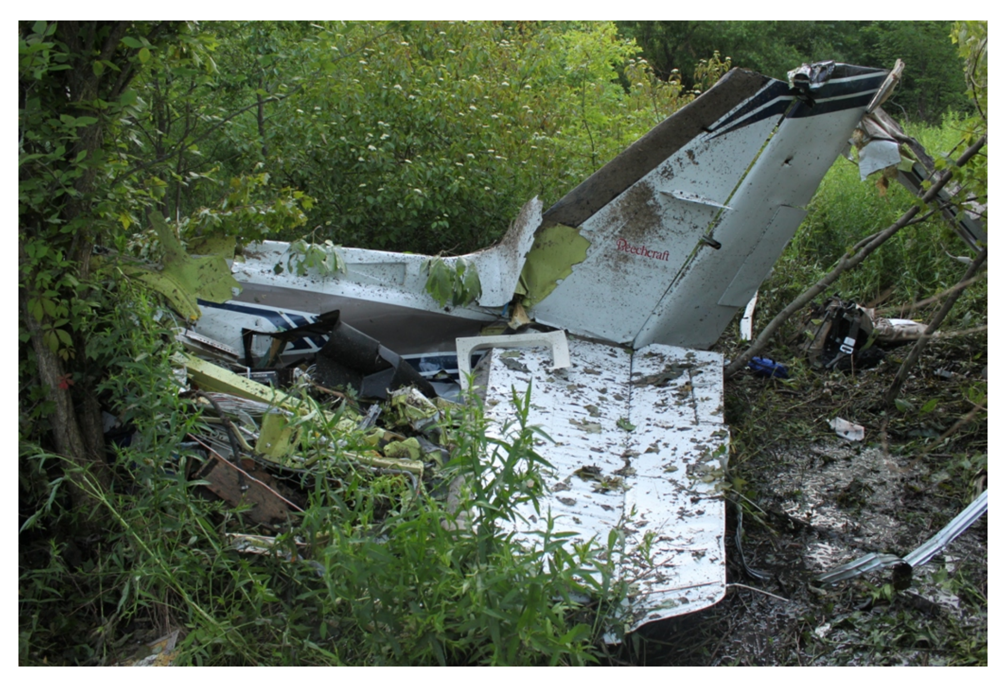
Photo 7 - NTSB Digital Photograph. Left Side View of Aft Empennage at the Accident Site.