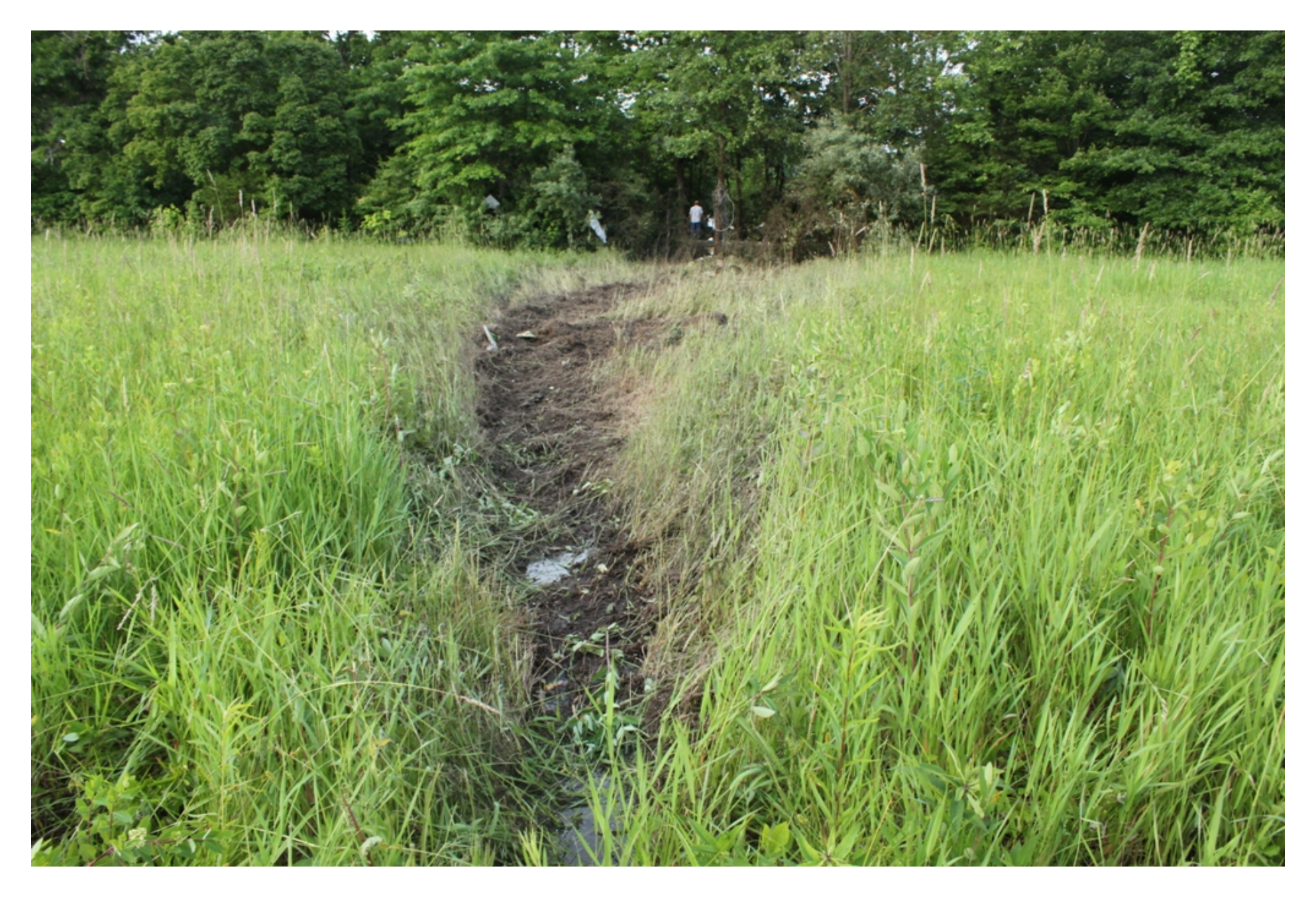
Photo 2 - NTSB Digital Photograph. View of the Initial Impact Ground Scar.