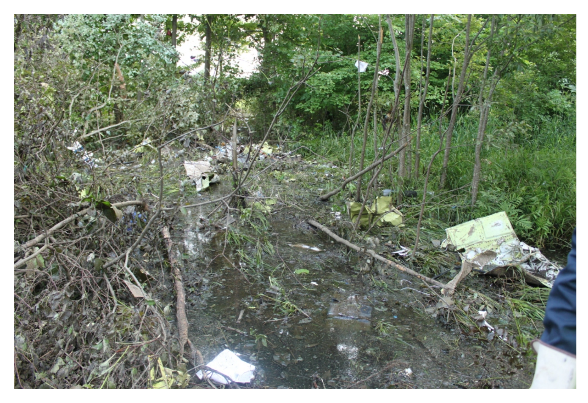
Photo 5 - NTSB Digital Photograph. View of Fragmented Wreckage at Accident Site.