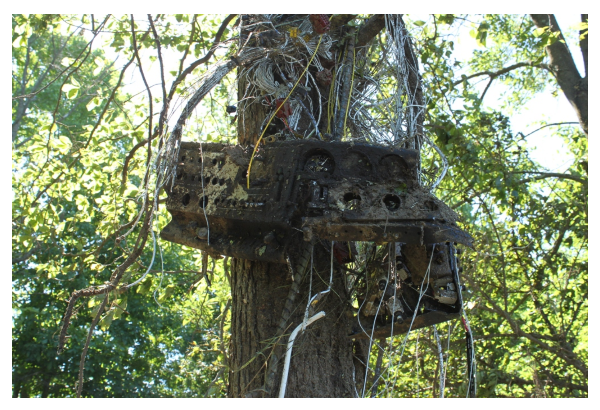
Photo 3 - NTSB Digital Photograph. View of a Portion of the Instrument Panel in a Tree.