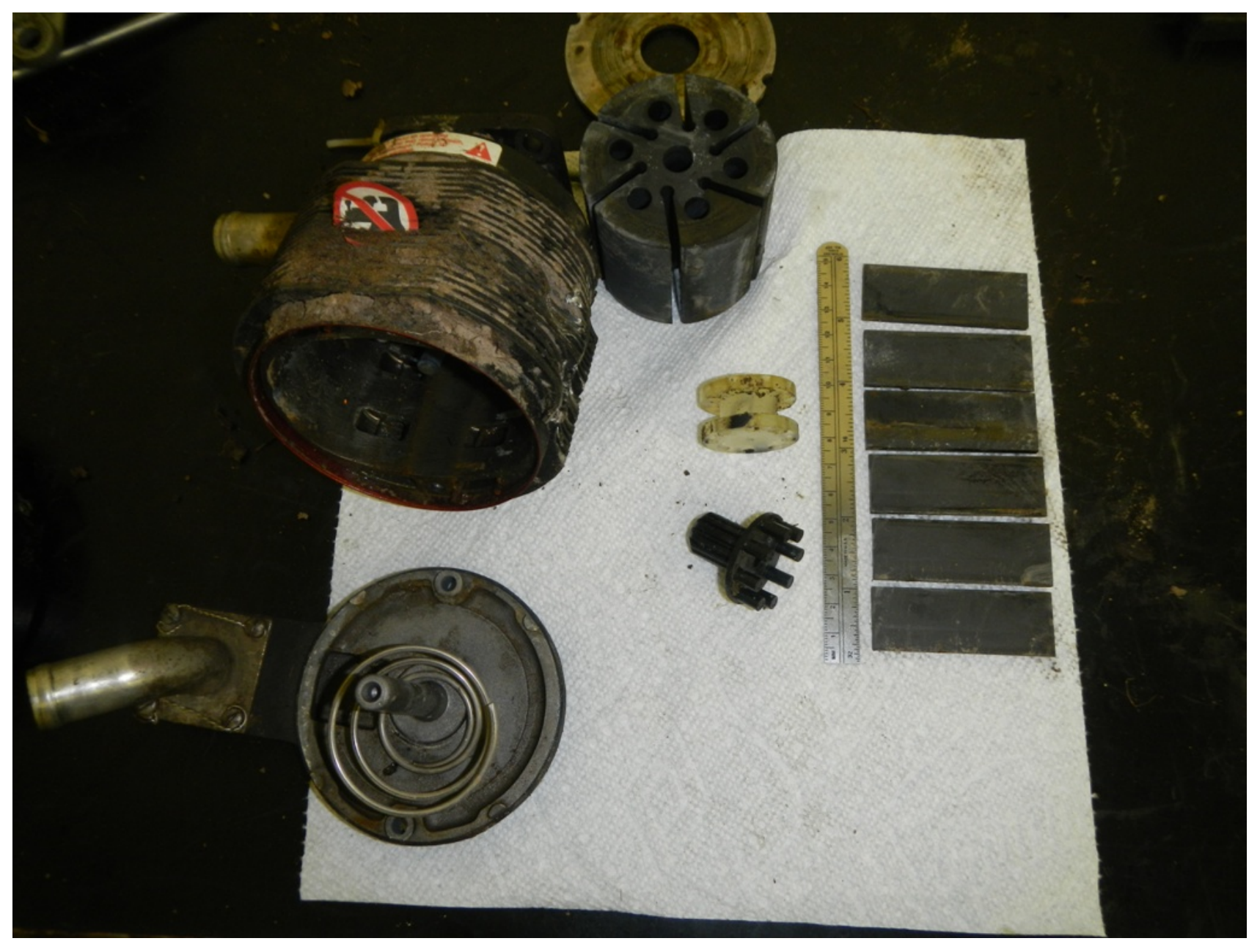
Photo 11 - Continental Aerospace Technologies Digital Photograph. View of the Right Engine-Driven Vacuum Pump Following Disassembly.