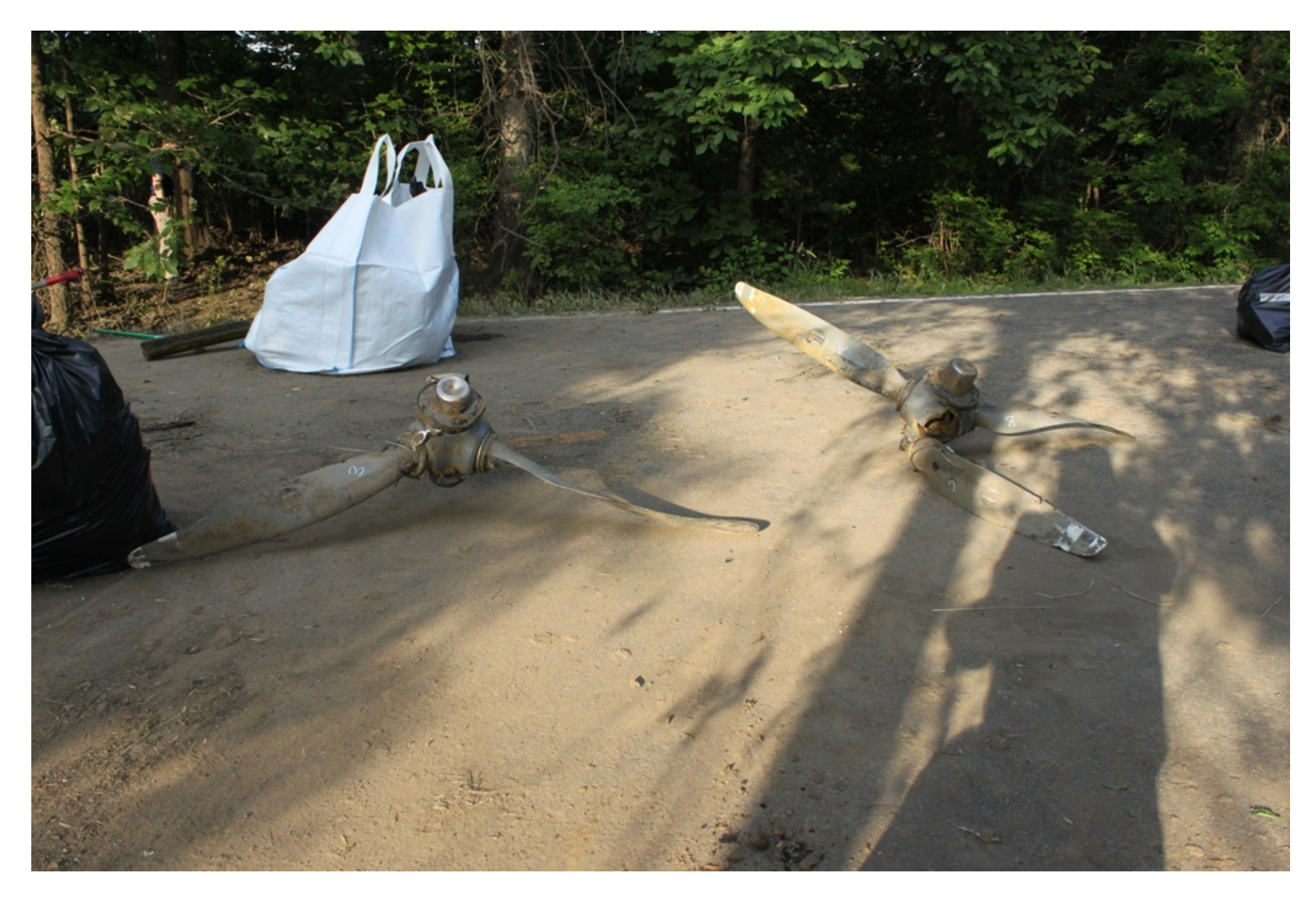
Photo 8 - View of Both Propellers at the Accident Site Following Recovery.