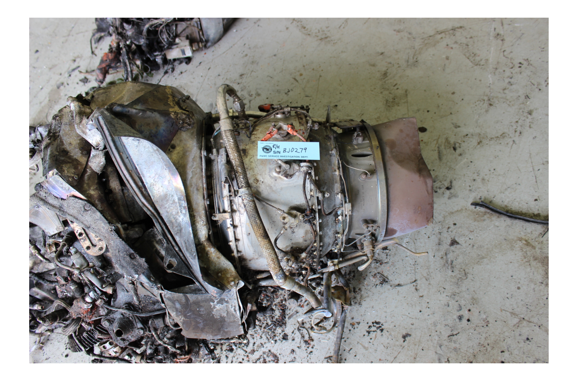
Photo 4 – View of Right Engine