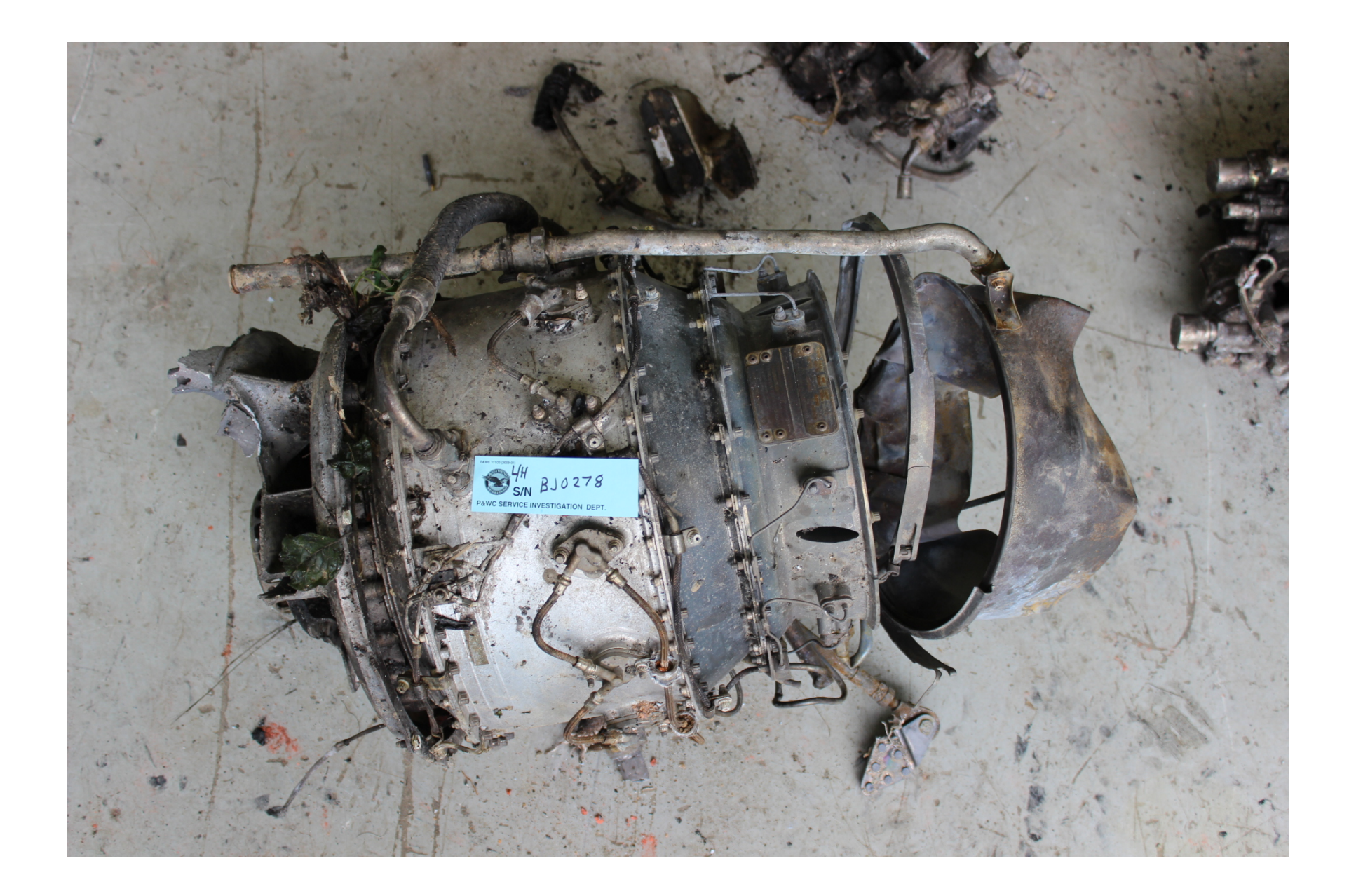
Photo 5 – View of Left Engine