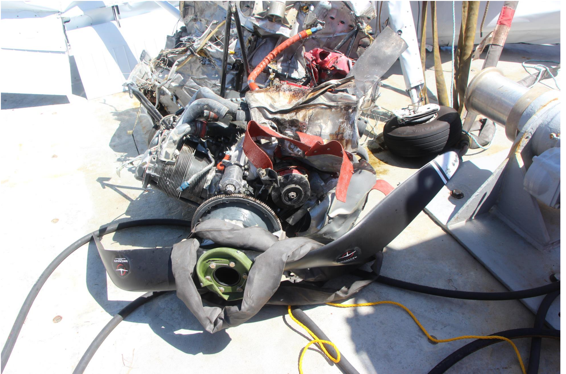
Photo 3 -Engine and Propeller