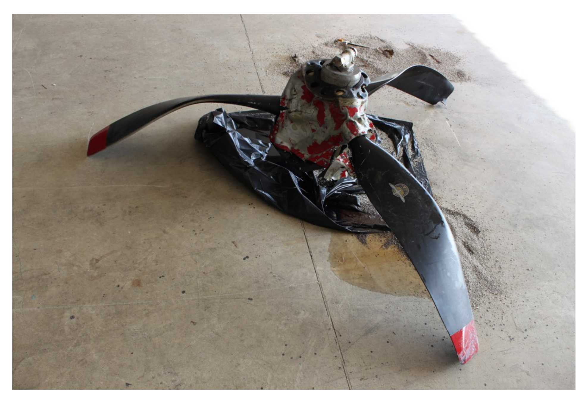
Photo 13 - NTSB Digital Photograph. View of the Separated Propeller.