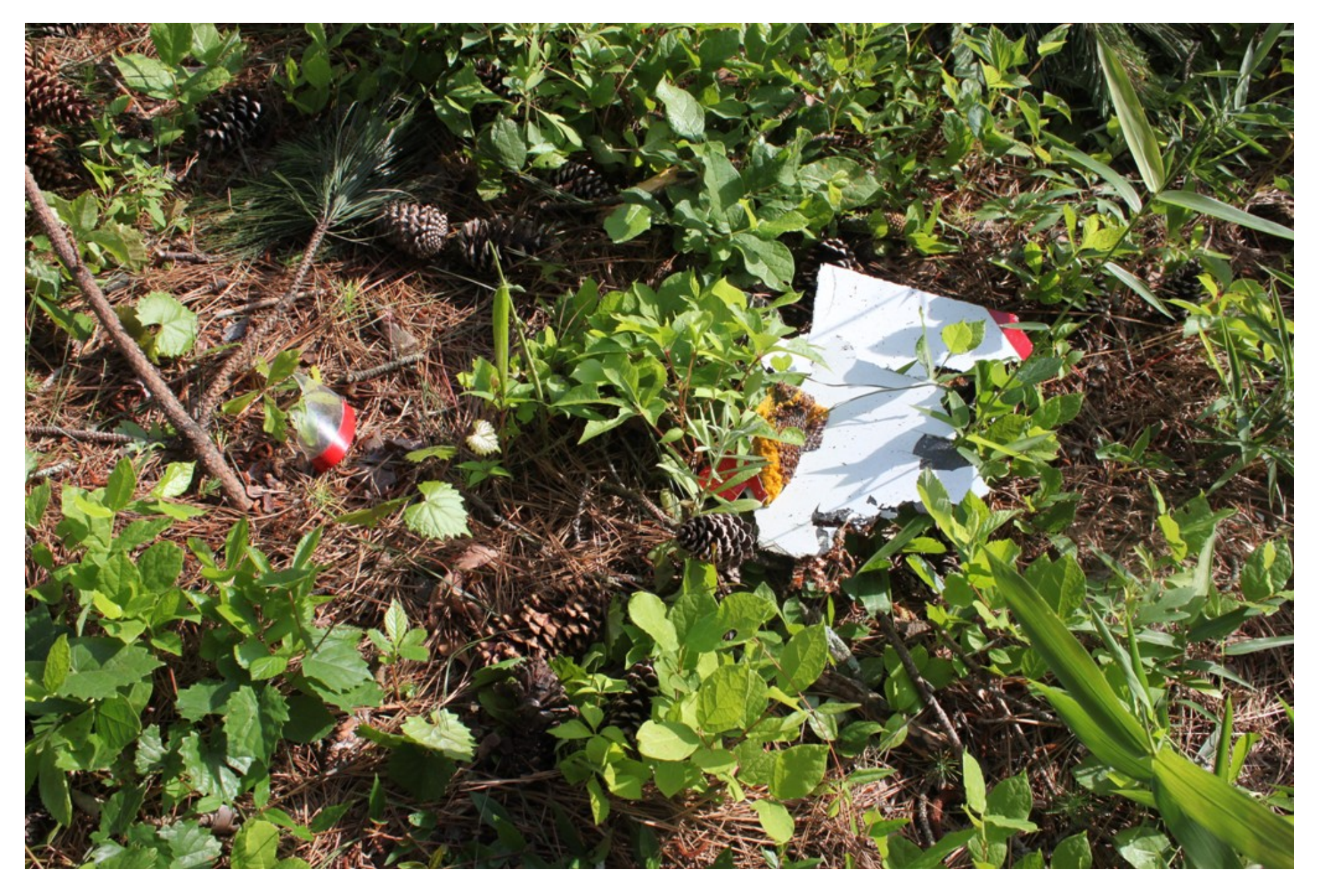
Photo 3 – NTSB Digital Photograph. View Depicting Airplane Debris at Base of Impacted Tree.