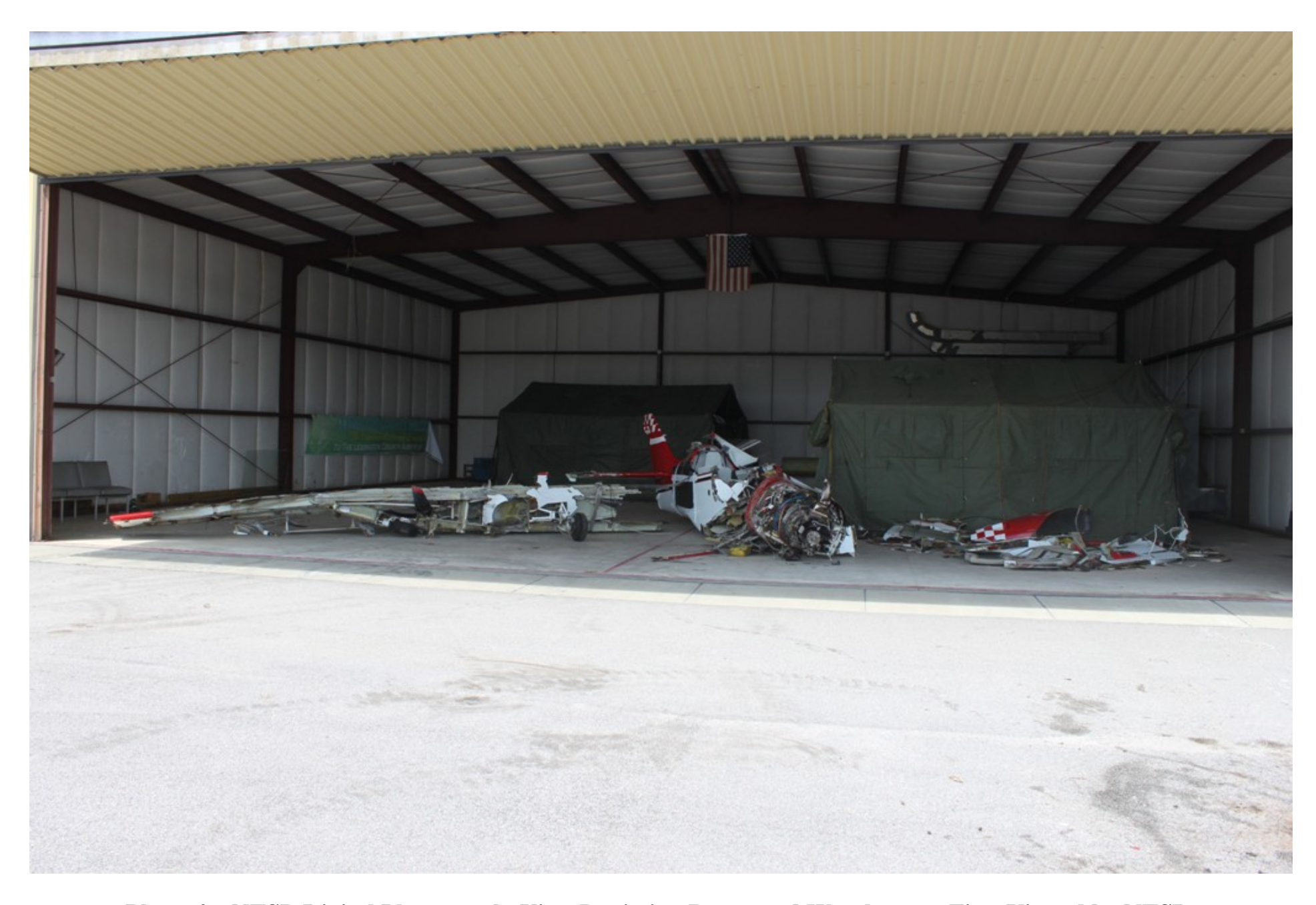
Photo 4 – NTSB Digital Photograph. View Depicting Recovered Wreckage as First Viewed by NTSB.