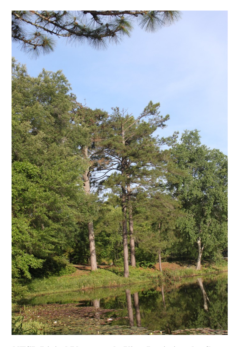
Photo 1 – NTSB Digital Photograph. View Depicting the Contacted Tree.