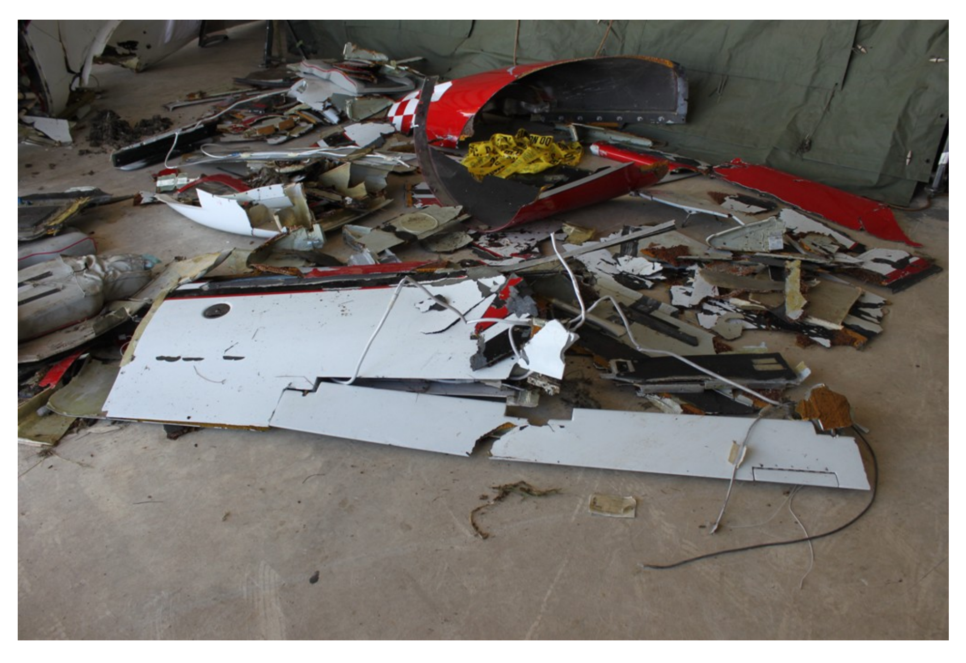
Photo 8 - NTSB Digital Photograph. View of Portion of Left Wing, Left Aileron, and Recovered Debris in Background.