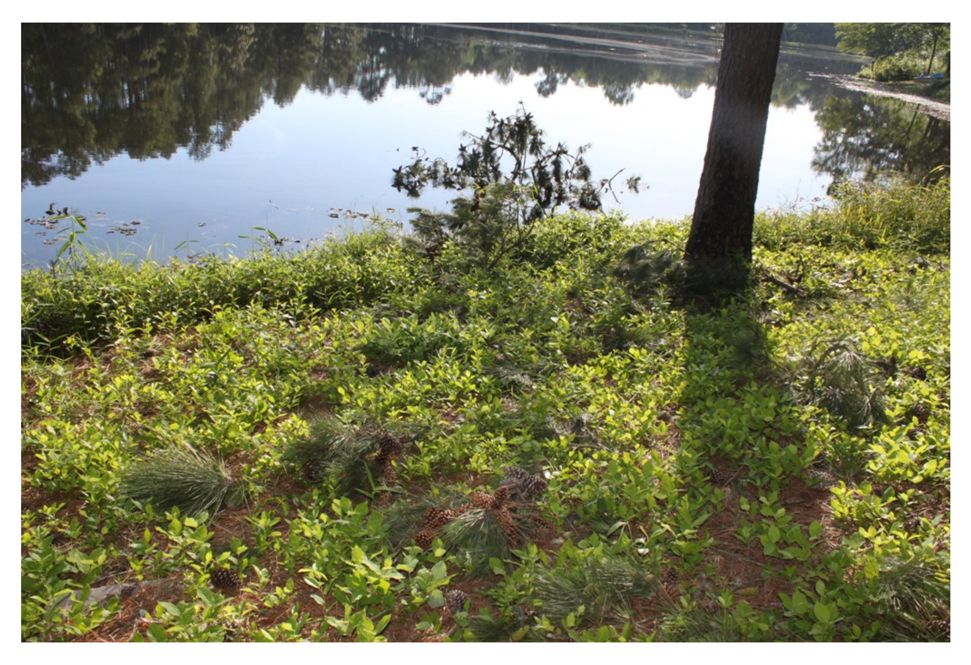
Photo 2 – NTSB Digital Photograph. View Depicting Broken Tree Branch at Base of Impacted Tree.