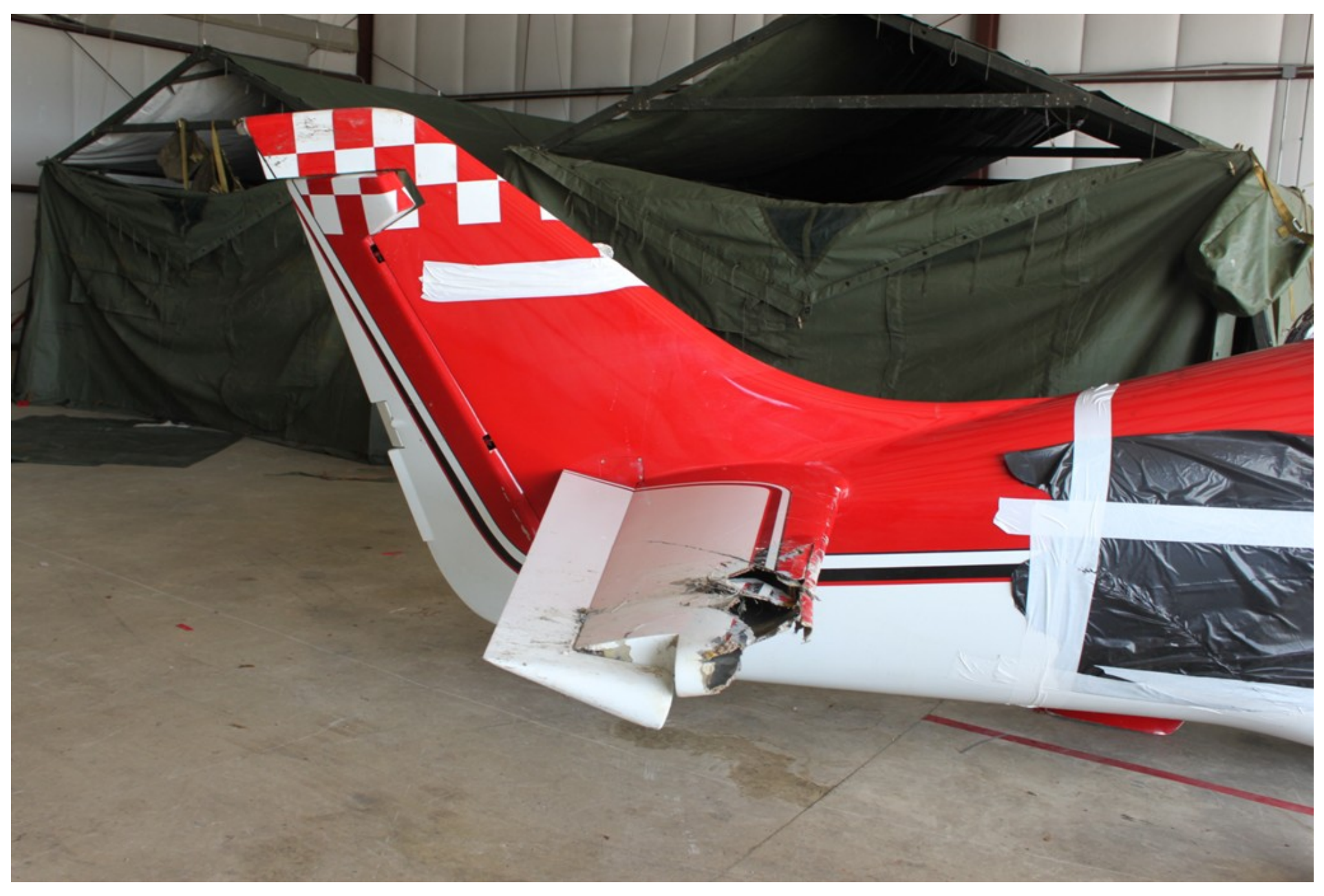
Photo 7 - NTSB Digital Photograph. Right Side of Aft Empennage with Damaged Right Horizontal Stabilizer, Elevator, Vertical Stabilizer and Rudder.