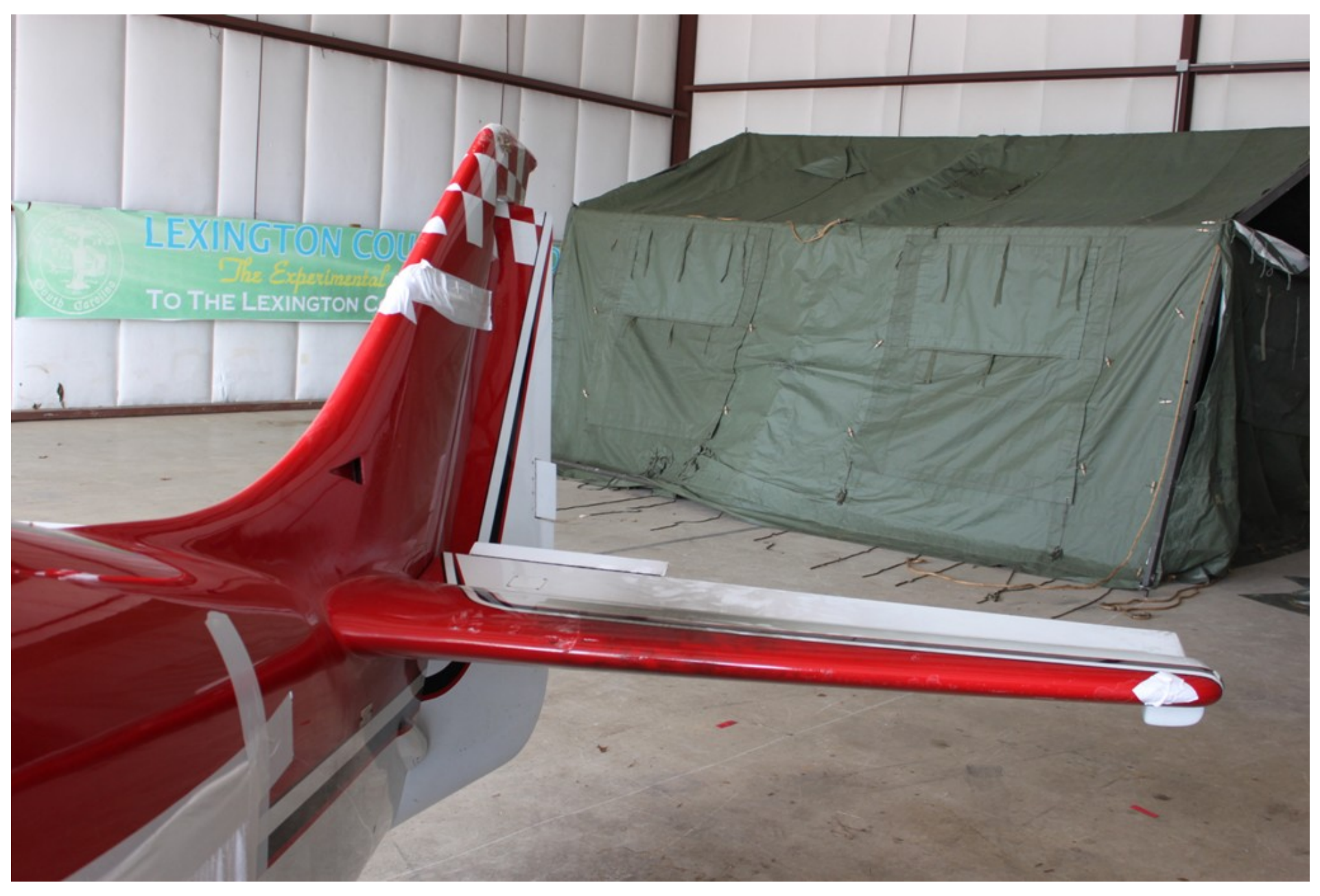
Photo 6 - NTSB Digital Photograph. Left Side of Aft Empennage with Left Horizontal Stabilizer, Elevator, Vertical Stabilizer and Rudder.