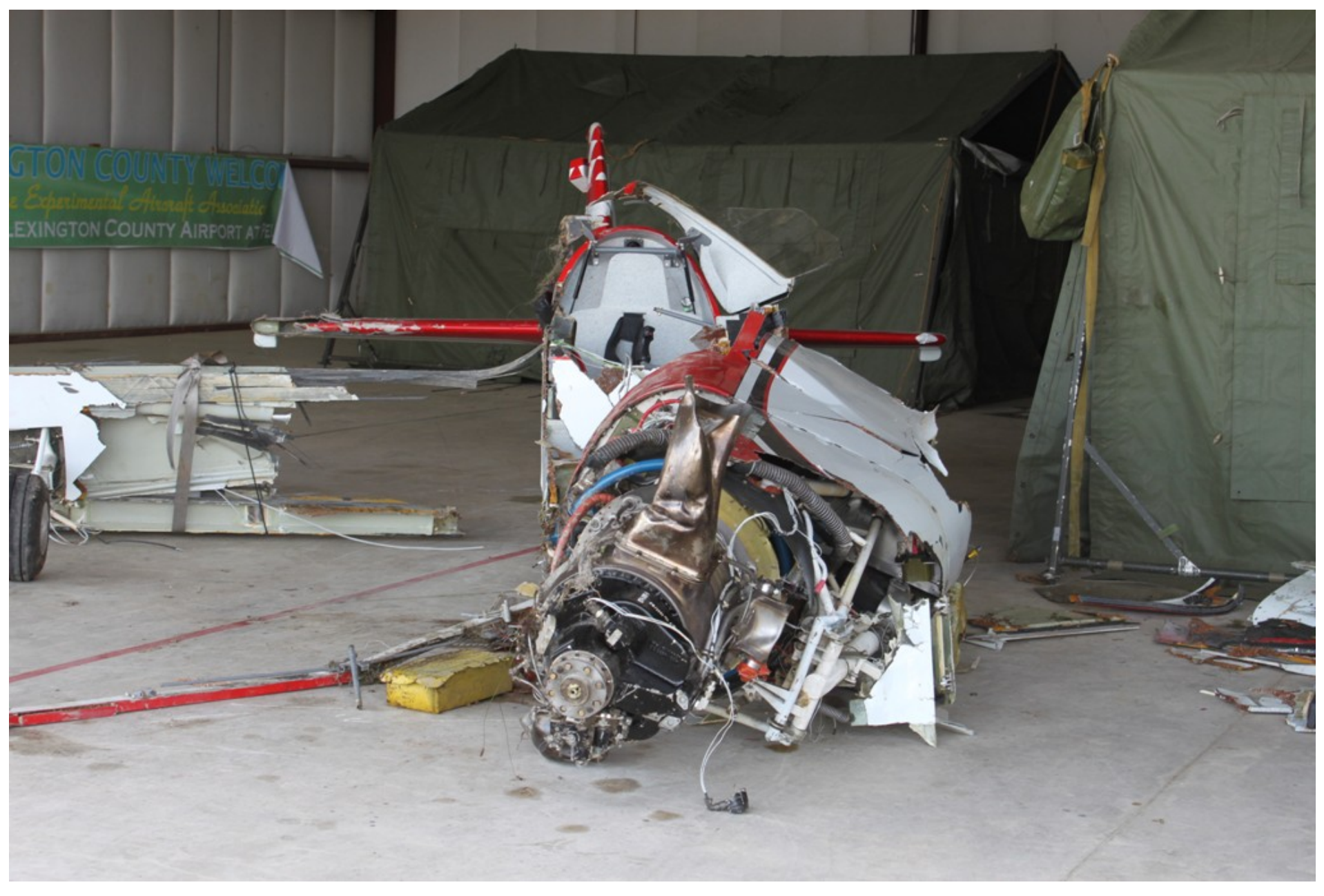
Photo 5 - NTSB Digital Photograph. Front View Depicting Installed Engine, and Fuselage, with Portion of Right Wing Visible.