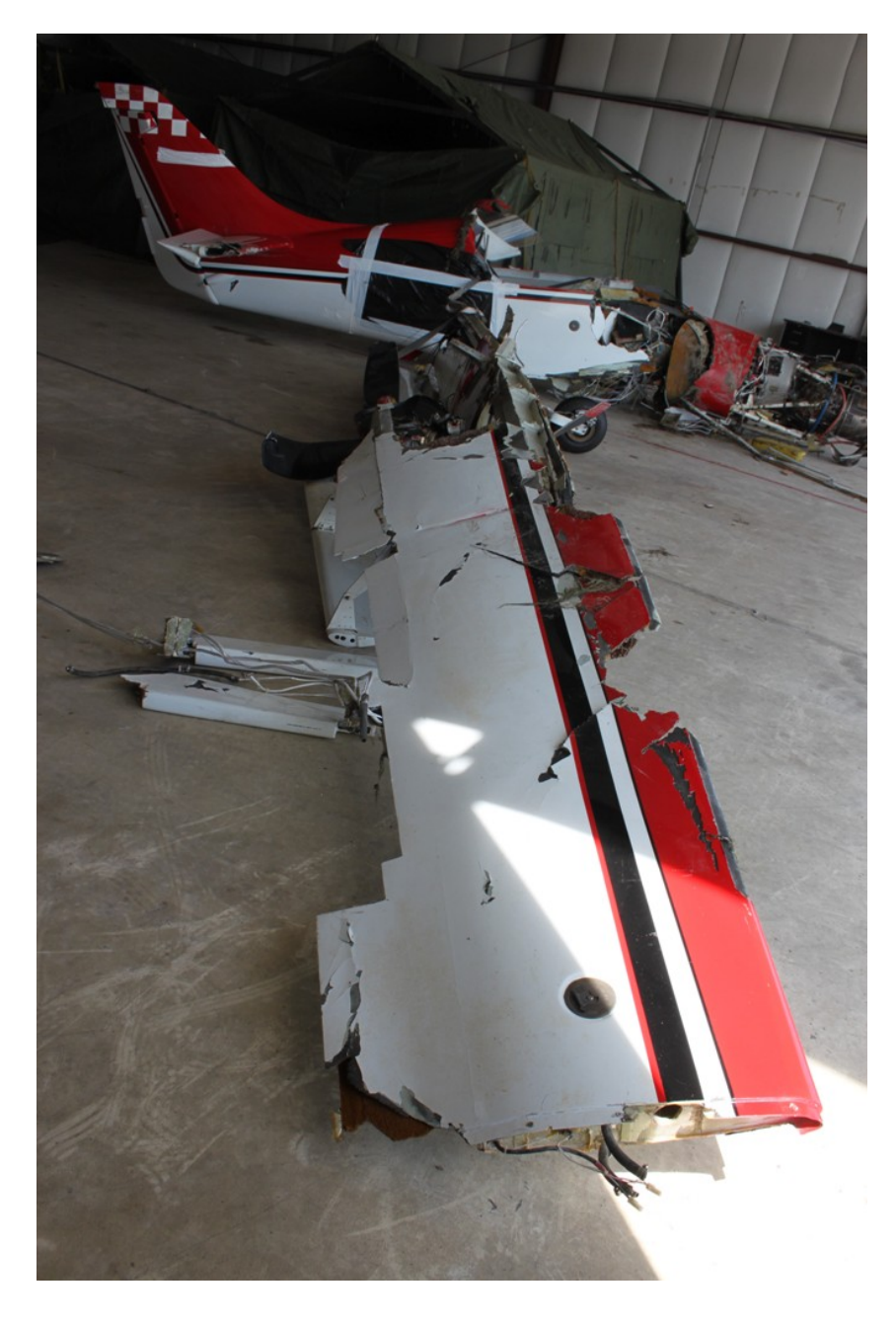
Photo 9 - NTSB Digital Photograph. View of Right Wing, Right Aileron, and Right Side of Fuselage in Background.