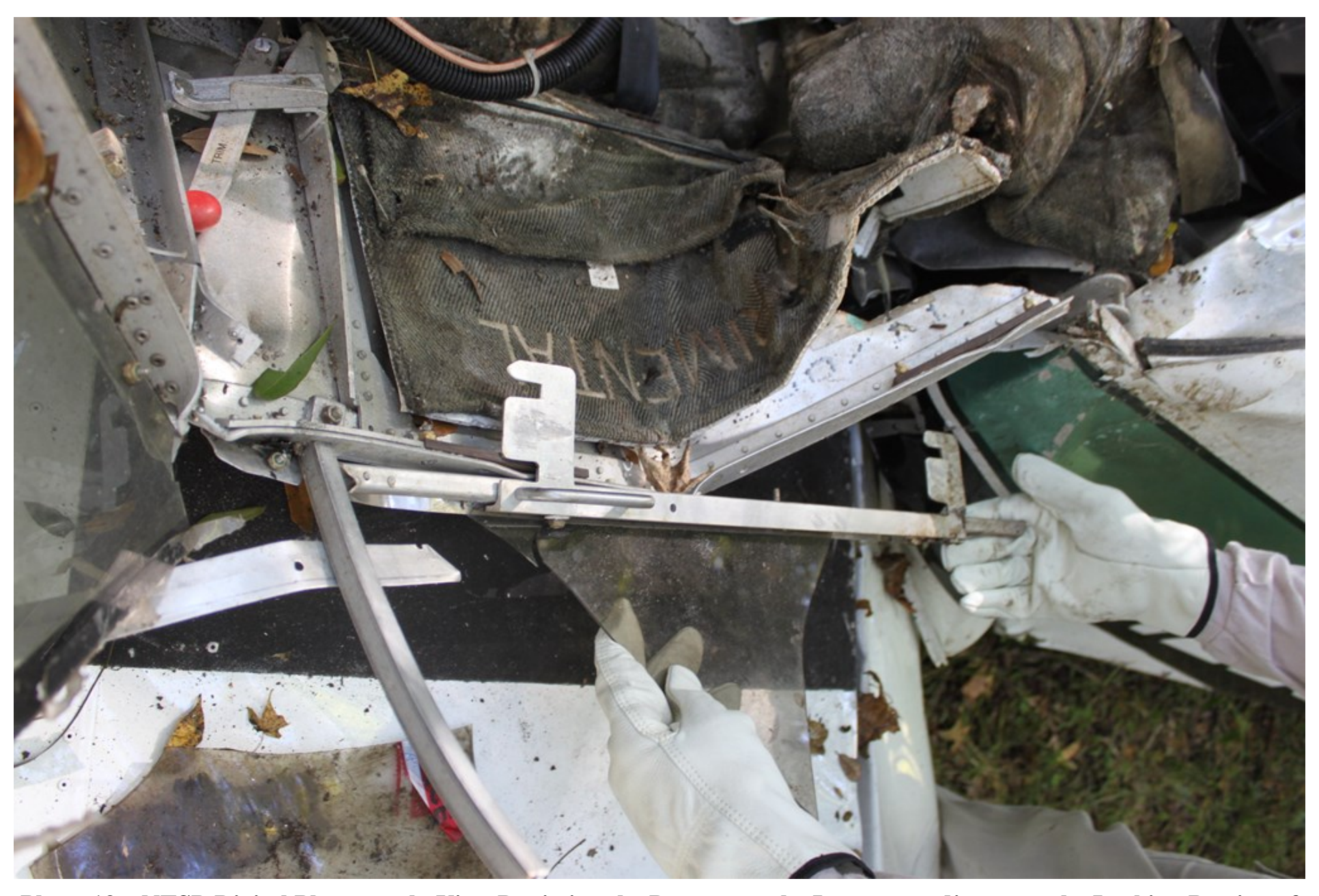
Photo 13 – NTSB Digital Photograph. View Depicting the Damage to the Longeron adjacent to the Locking Portion of the Canopy Frame, and the Locking Portion of the Canopy Frame