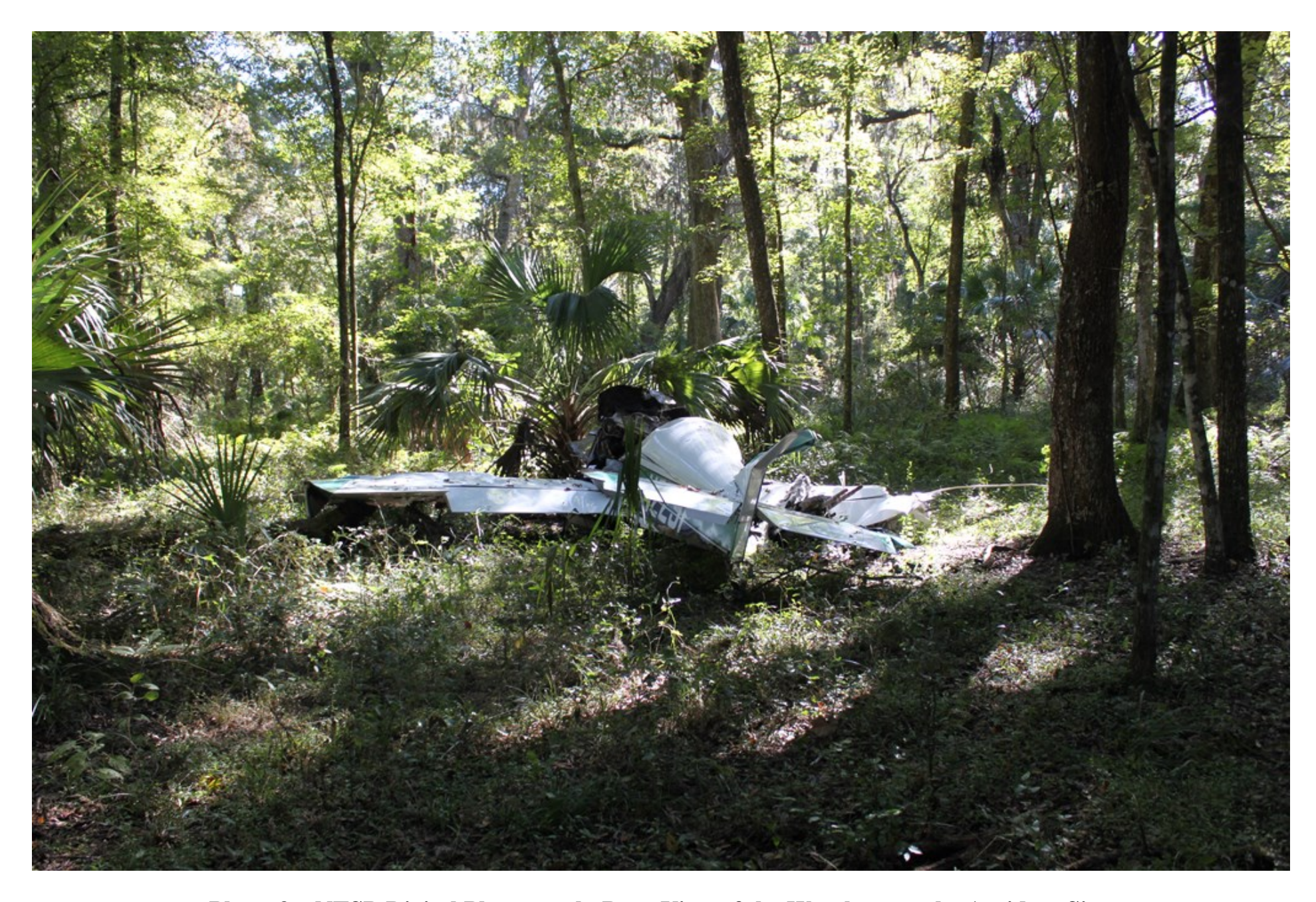
Photo 3 – NTSB Digital Photograph. Rear View of the Wreckage at the Accident Site.