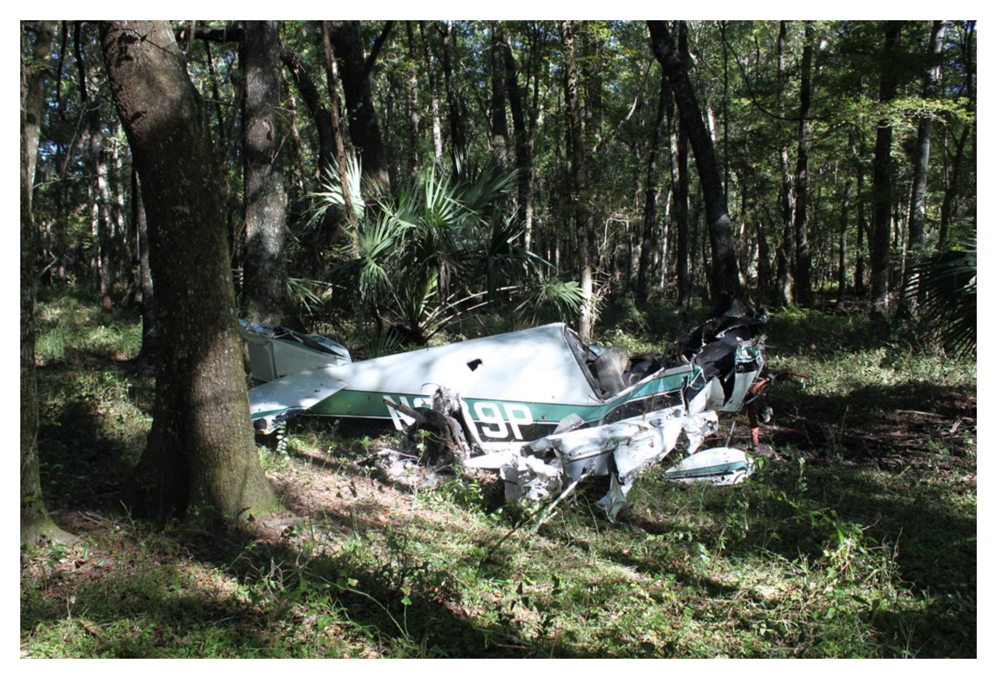
Photo 2 – NTSB Digital Photograph. Right Side View of the Wreckage at the Accident Site and Being Uprighted.