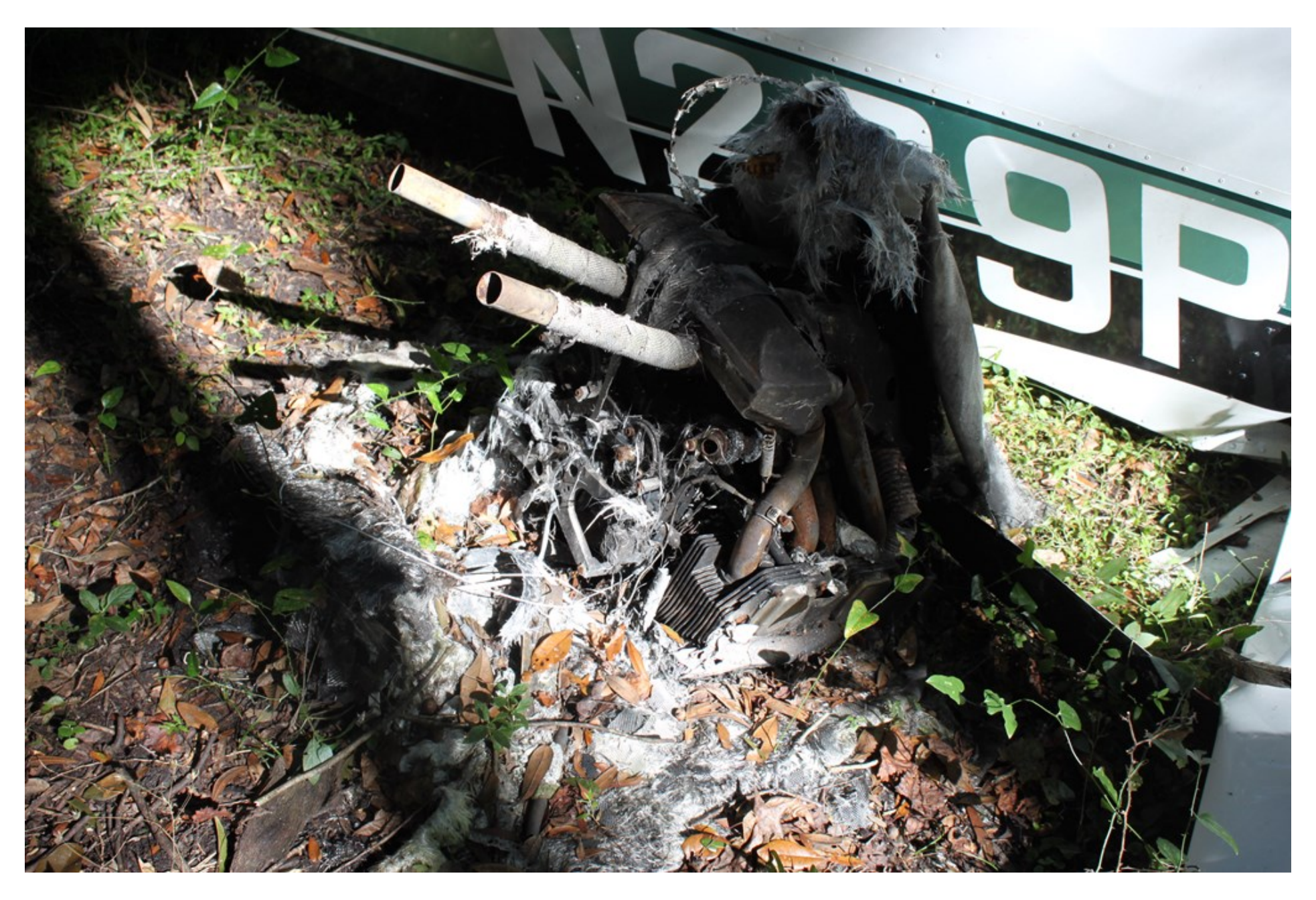
Photo 6 – NTSB Digital Photograph. View of the Separated Engine Assembly.