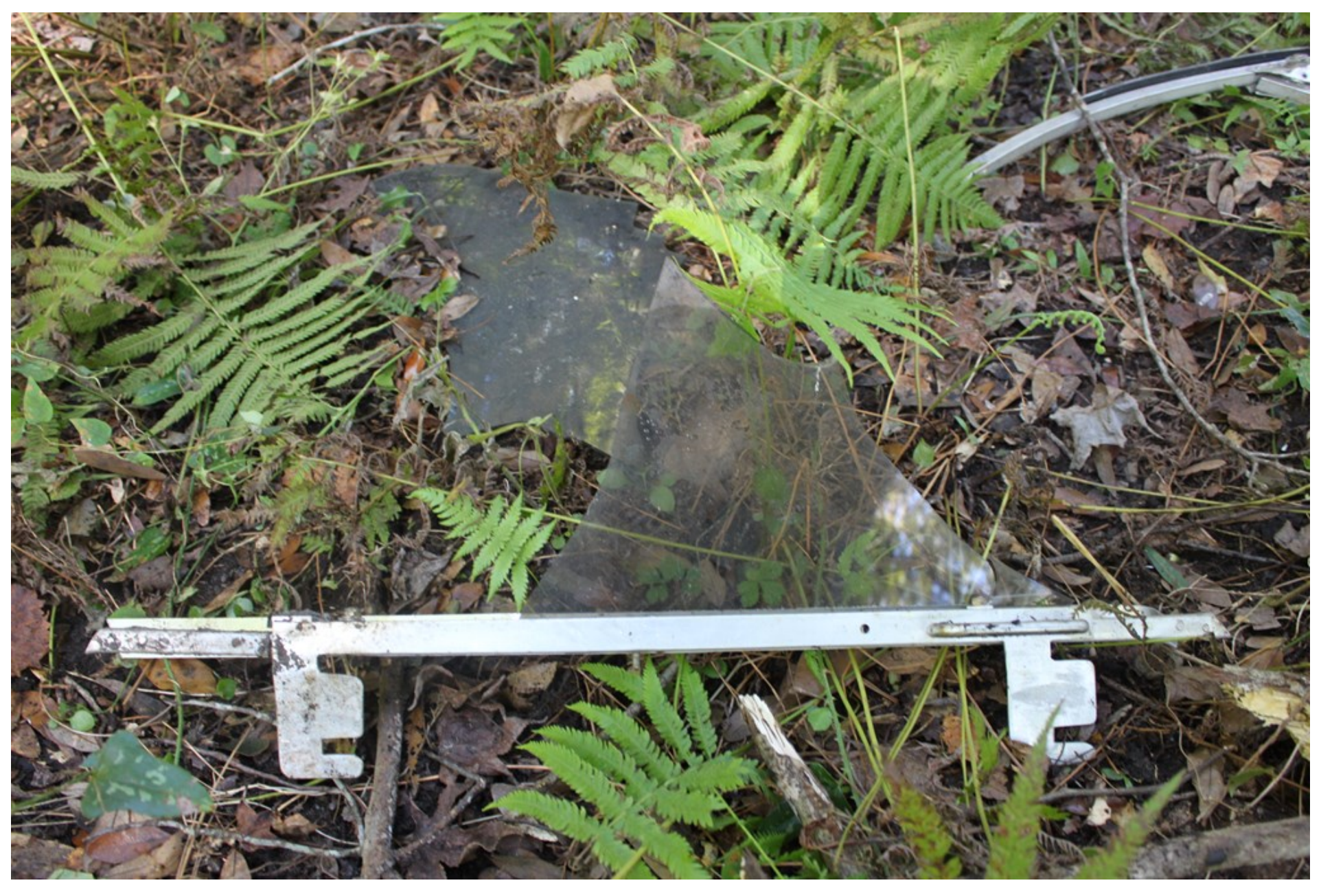
Photo 12 View depicting the locking portion of the canopy. Note the undamaged latches for taxi (lower) and takeoff (upper) positions