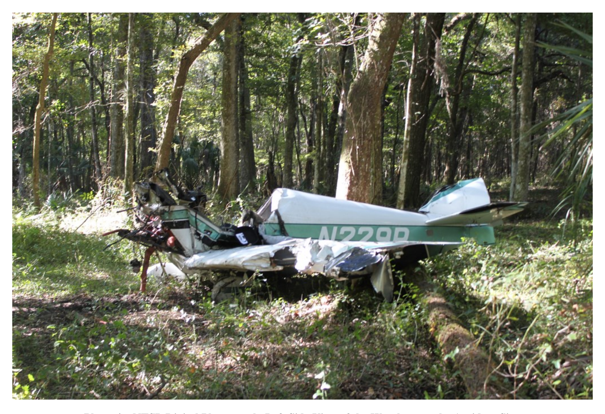
Photo 4 – NTSB Digital Photograph. Left Side View of the Wreckage at the Accident Site.