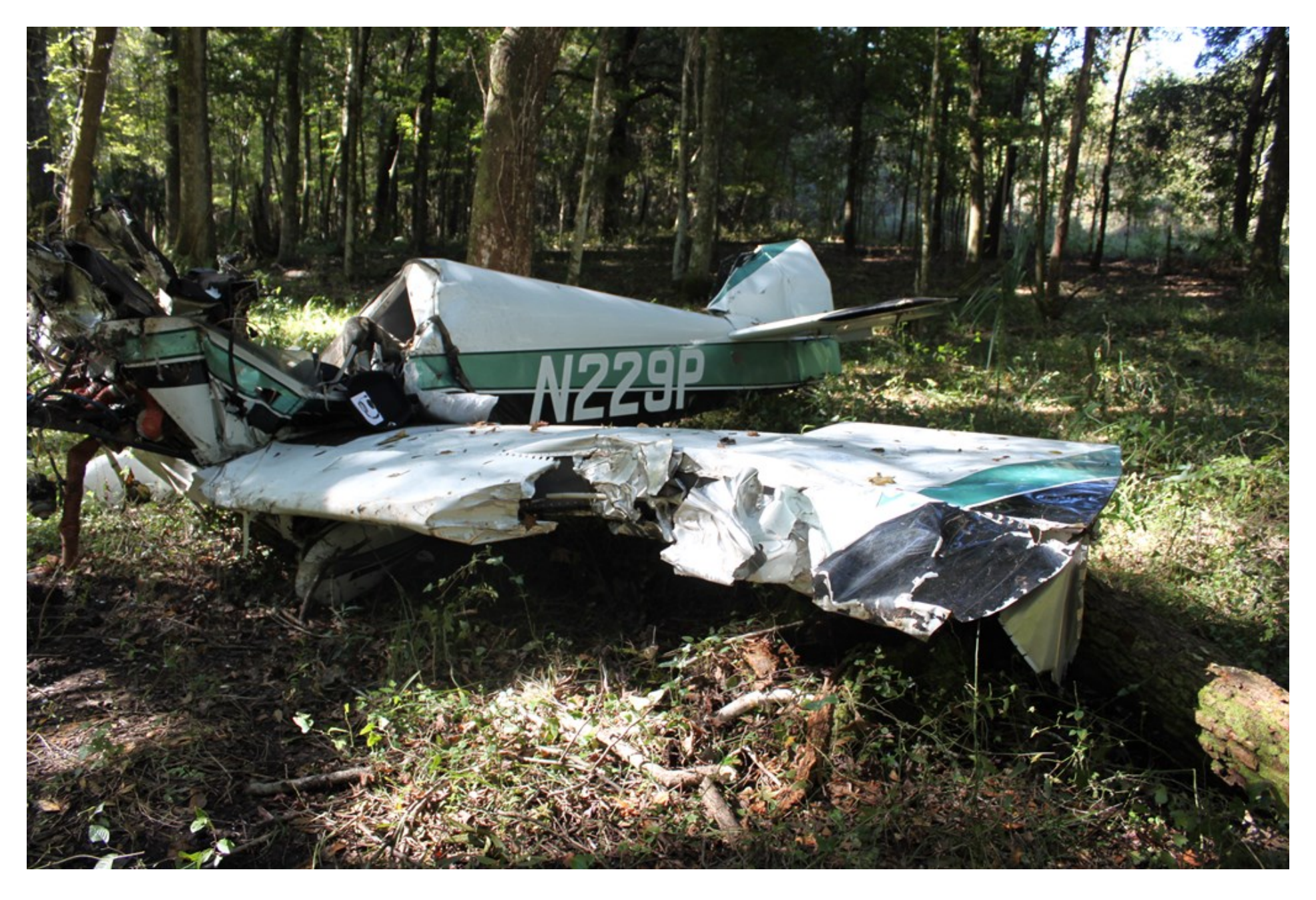
Photo 8 – NTSB Digital Photograph. View of the Left Wing. Note the Leading Edge Tree Contact Damage