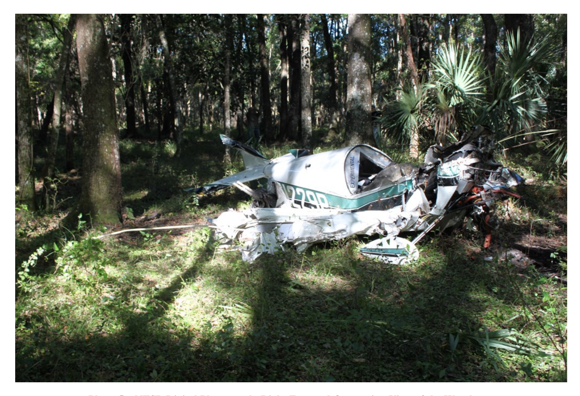
Photo 5 – NTSB Digital Photograph. Right Forward Quartering View of the Wreckage.