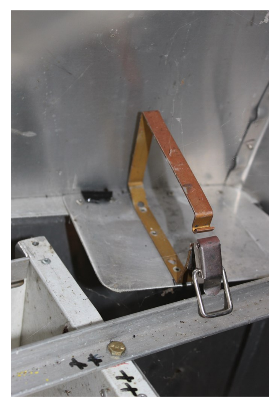
Photo 14 – NTSB Digital Photograph. View Depicting the ELT Bracket and Lower Mount Tray