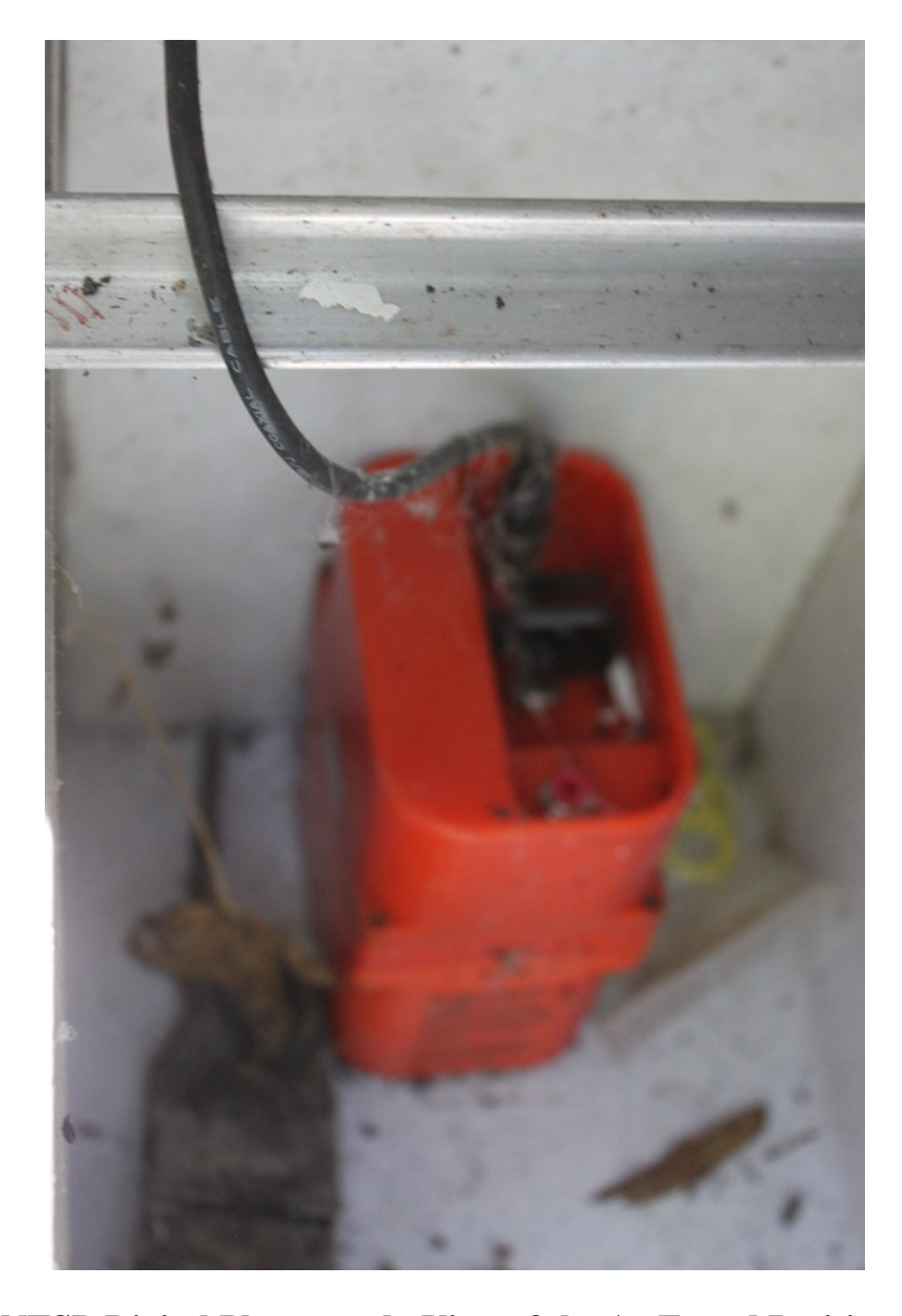
Photo 15 – NTSB Digital Photograph. View of the As-Found Position of the ELT.