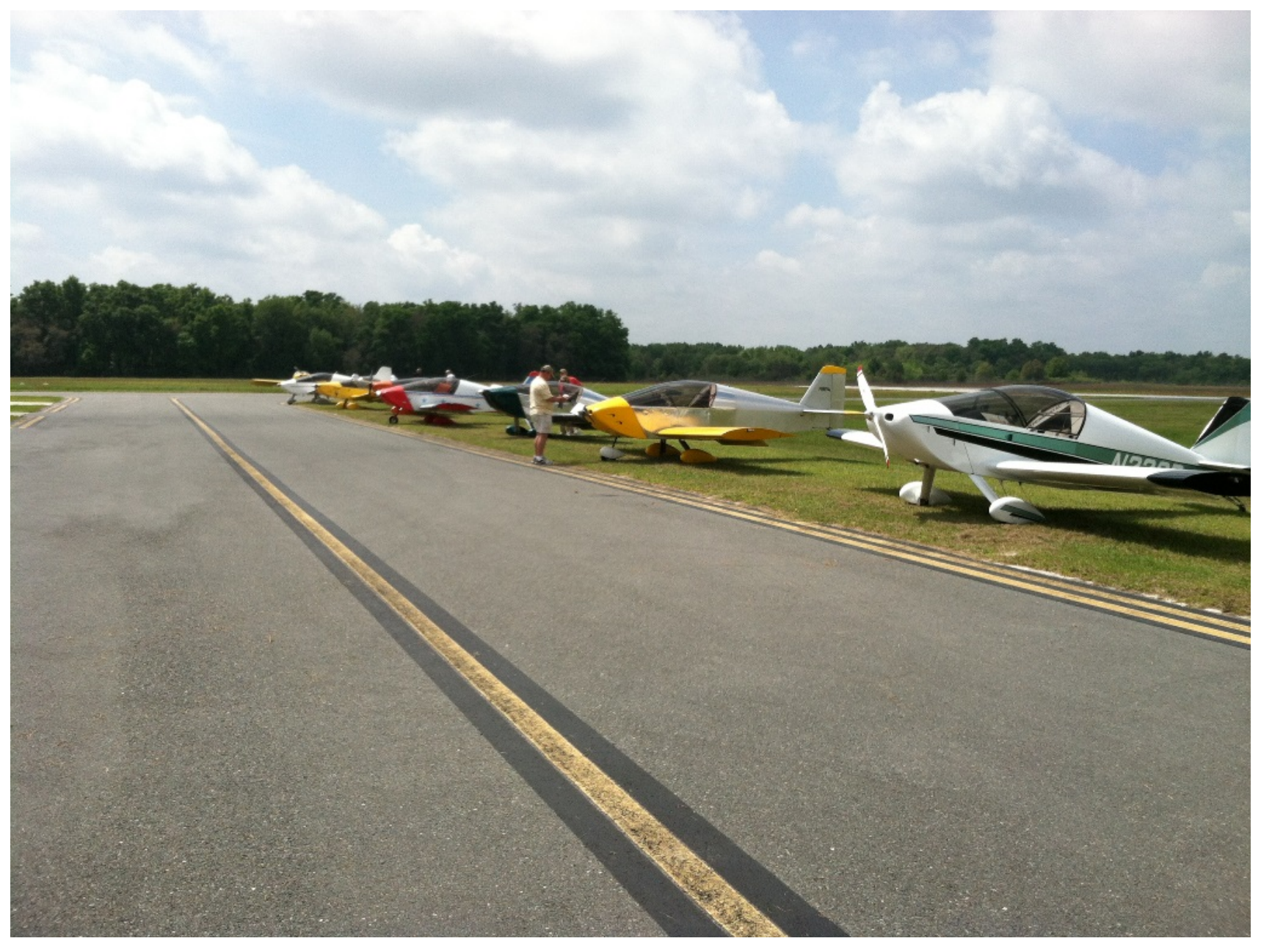
Photo 1 – Digital Photograph Provided by X35 Airport Manager. Picture taken 4/5/2014 at 1221:24. View of the airplane at X35.