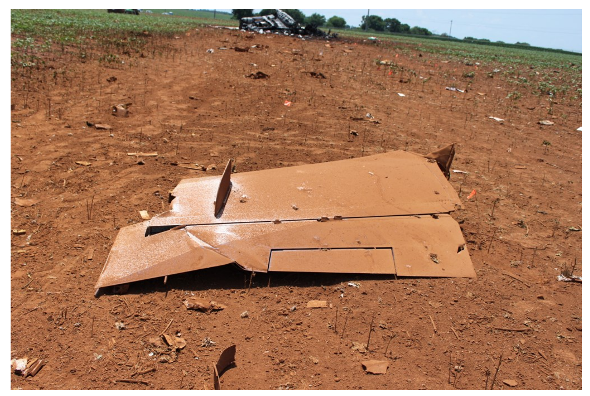
Photo 4 - NTSB Digital Photograph. View depicting the separated vertical stabilizer, rudder, and attached rudder trim tab, with wreckage in the background.