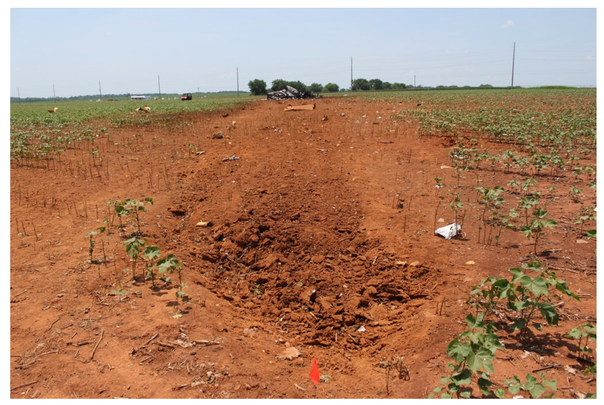
Photo 3 - NTSB Digital Photograph. View of the energy path taken from the impact crater containing glass fragments.