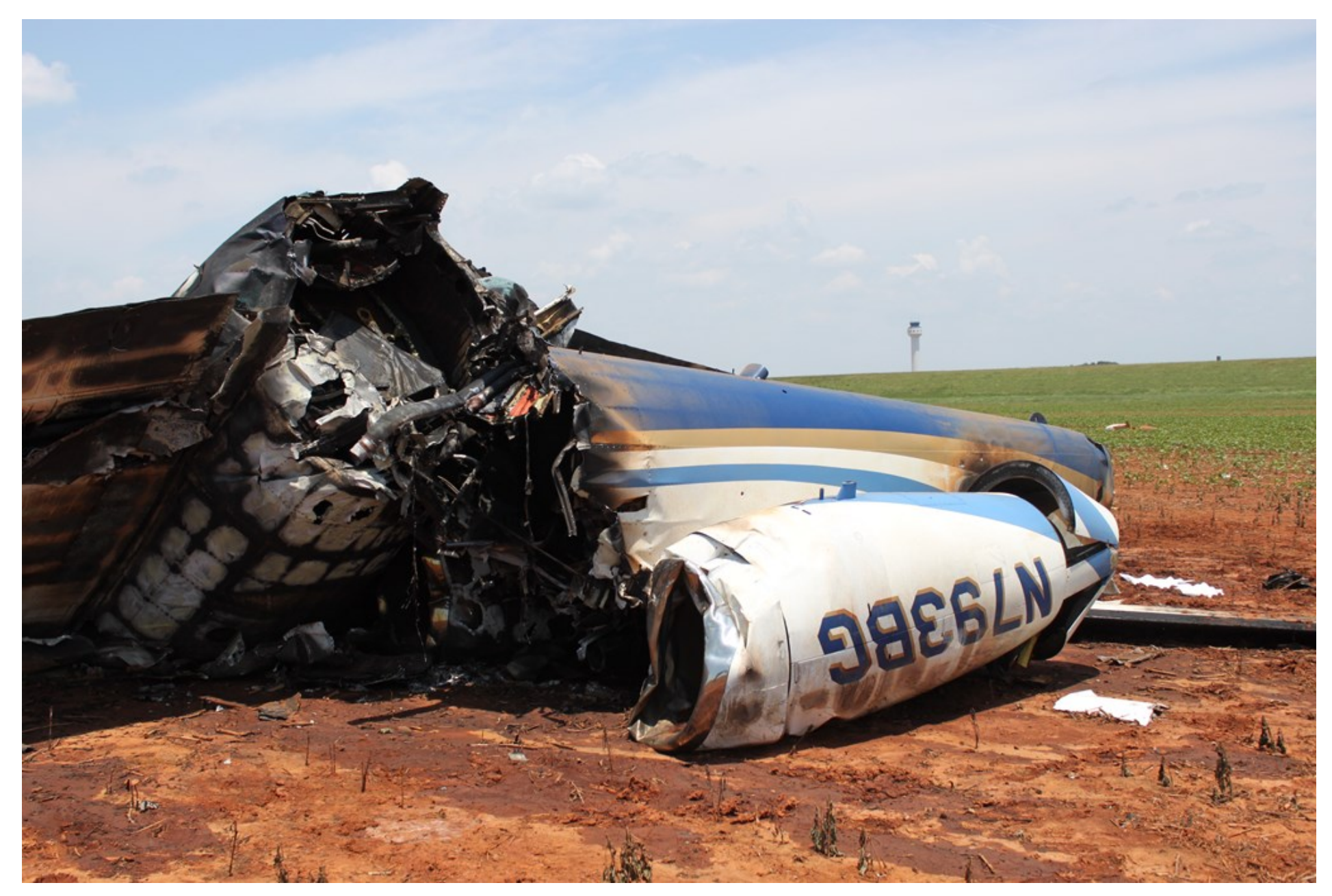
Photo 7 - NTSB Digital Photograph. View depicting the inverted wing and fuselage. Note the attached right engine and partially deployed upper and lower right thrust reverser clamshell doors.