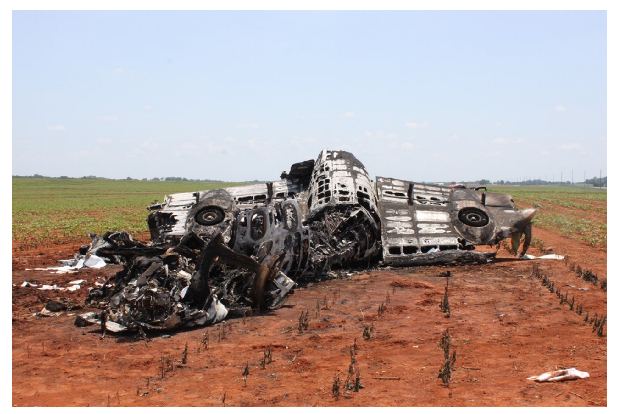
Photo 6 - NTSB Digital Photograph. Another view depicting the resting position of the inverted wing and fuselage section of the wreckage.