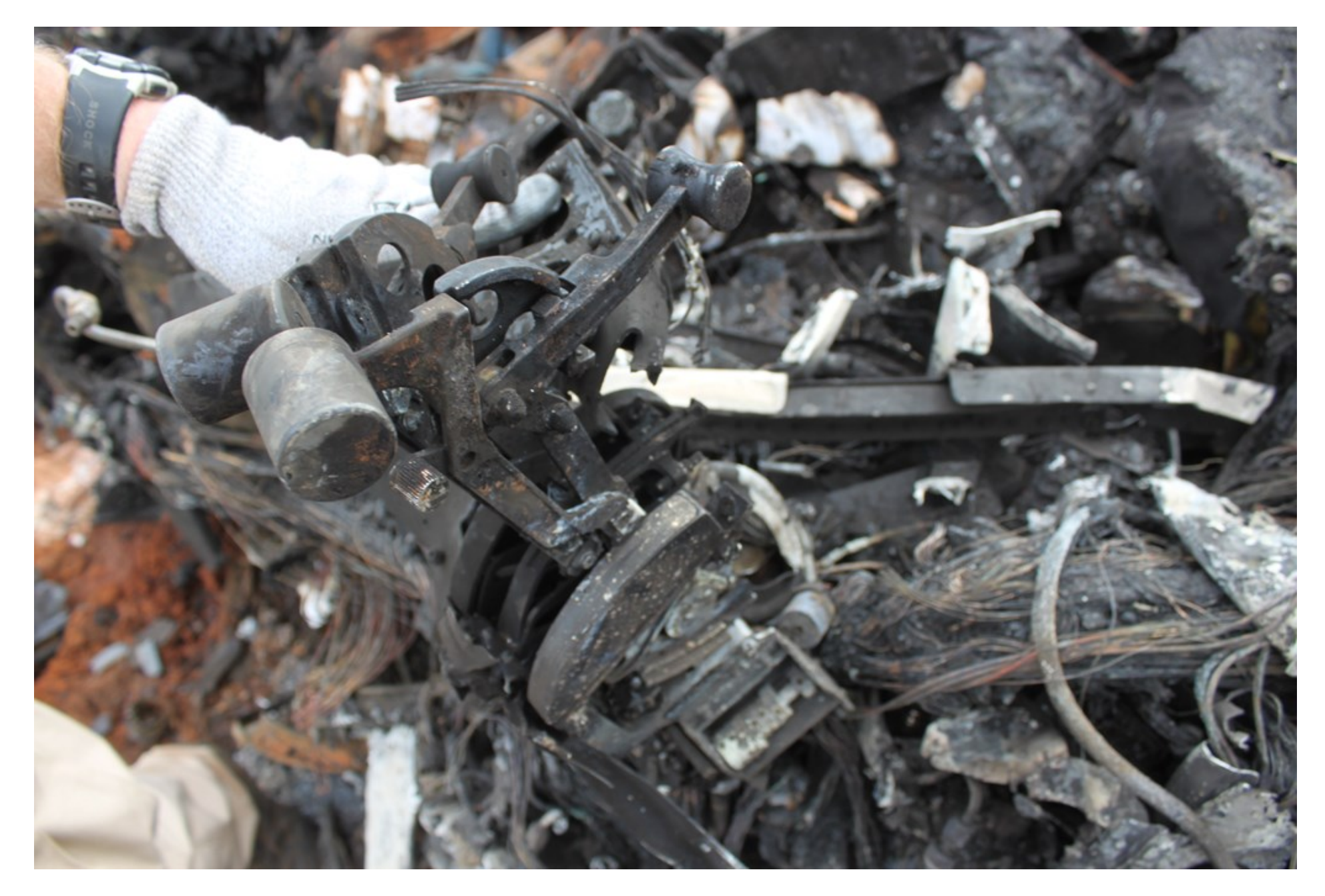
Photo 10 - NTSB Digital Photograph. View of the right side of the throttle quadrant.