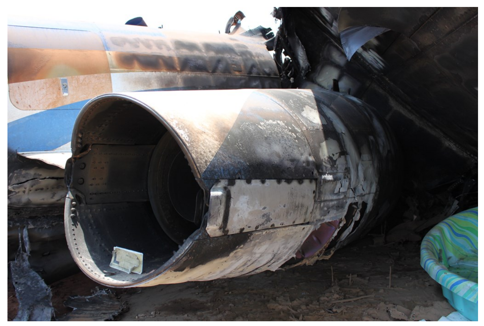
Photo 8 - NTSB Digital Photograph. View depicting the left engine upper and lower thrust reverser clamshell doors.