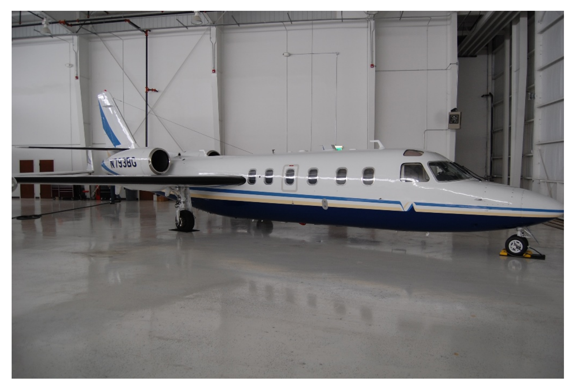
Photo 1 – Right side view of the Accident Airplane.