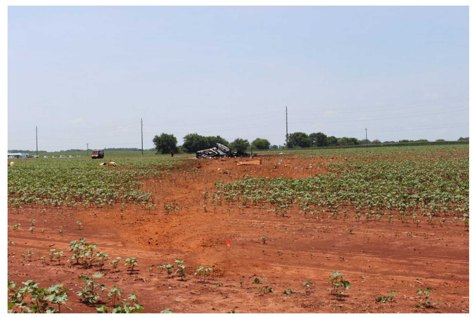
Photo 2 - NTSB Digital Photograph. View depicting the first impact crater and the energy path of the airplane with the wreckage in the background.