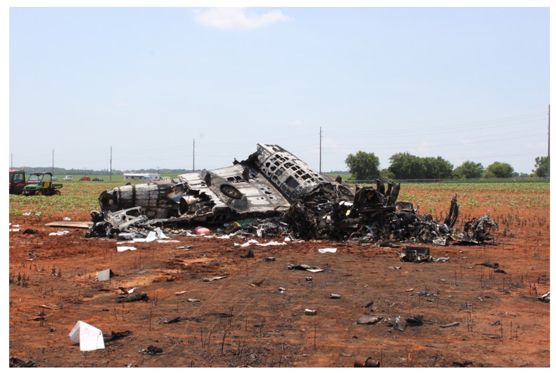
Photo 5 - View depicting the resting position of the inverted wing and fuselage section of the main wreckage.