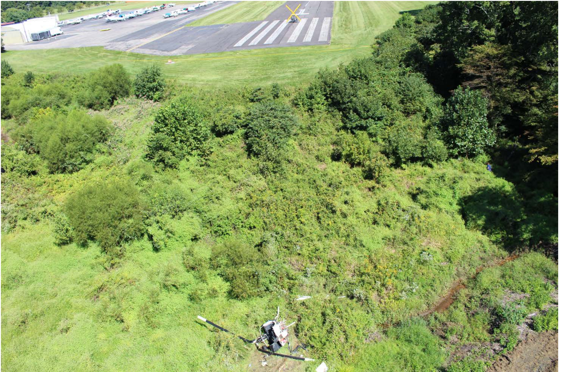
Photo 1 – View of Helicopter as Found Relative to Landing Runway (Medford FD)