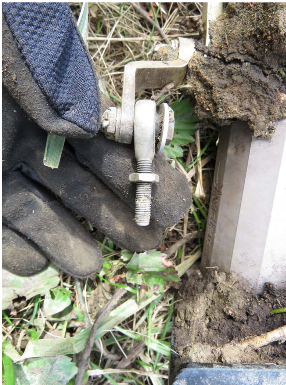
Photo 4 – View of Throttle Control Arm of Carburetor with externally-threaded portion of the two-piece throttle control tie rod still attached to the throttle arm.