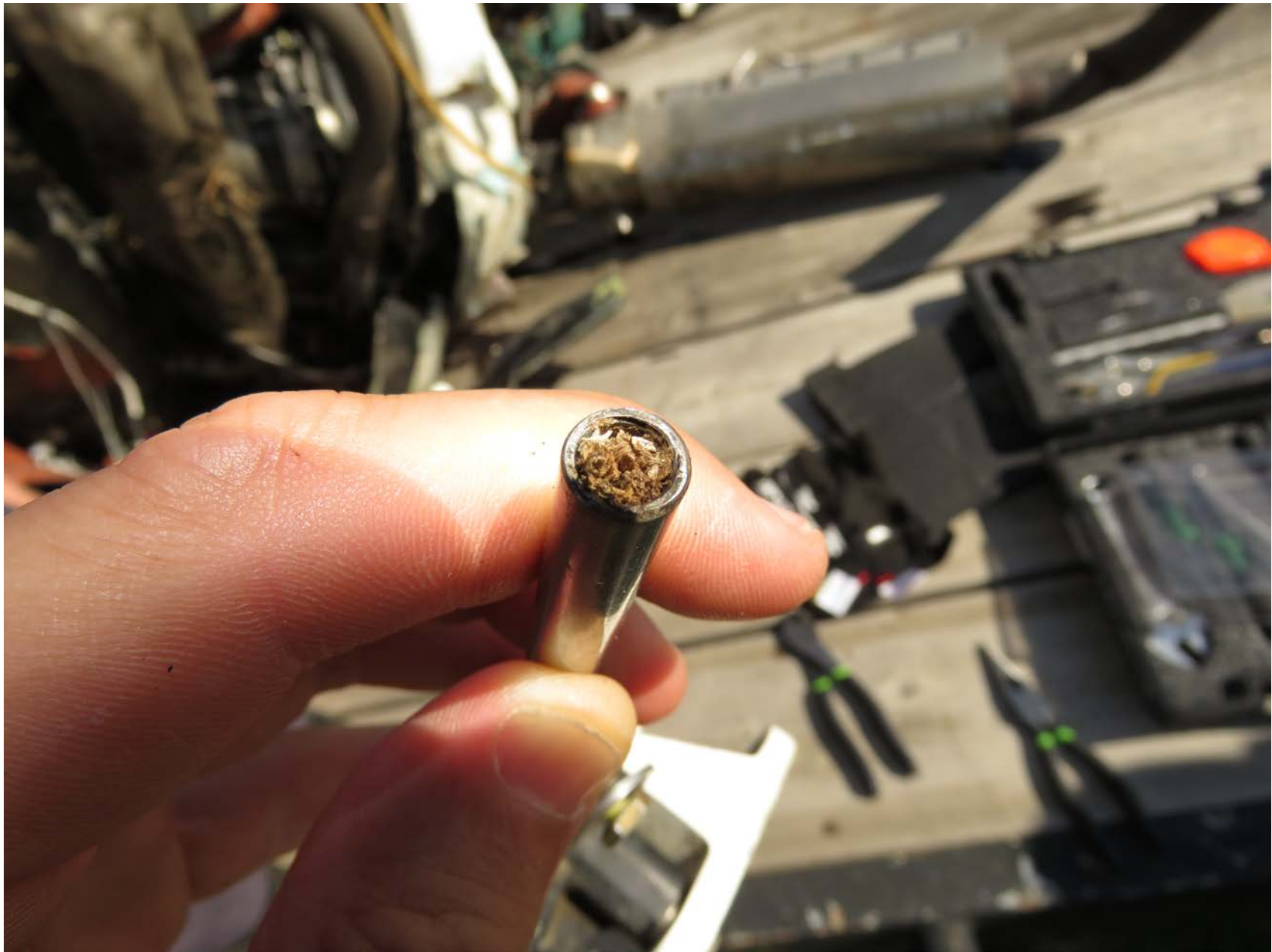
Photo 6 - Photo 5 - View of cellulose material (wood) imbedded in internally-threaded portion of the two-piece throttle control tie rod still attached to the throttle control bellcrank.