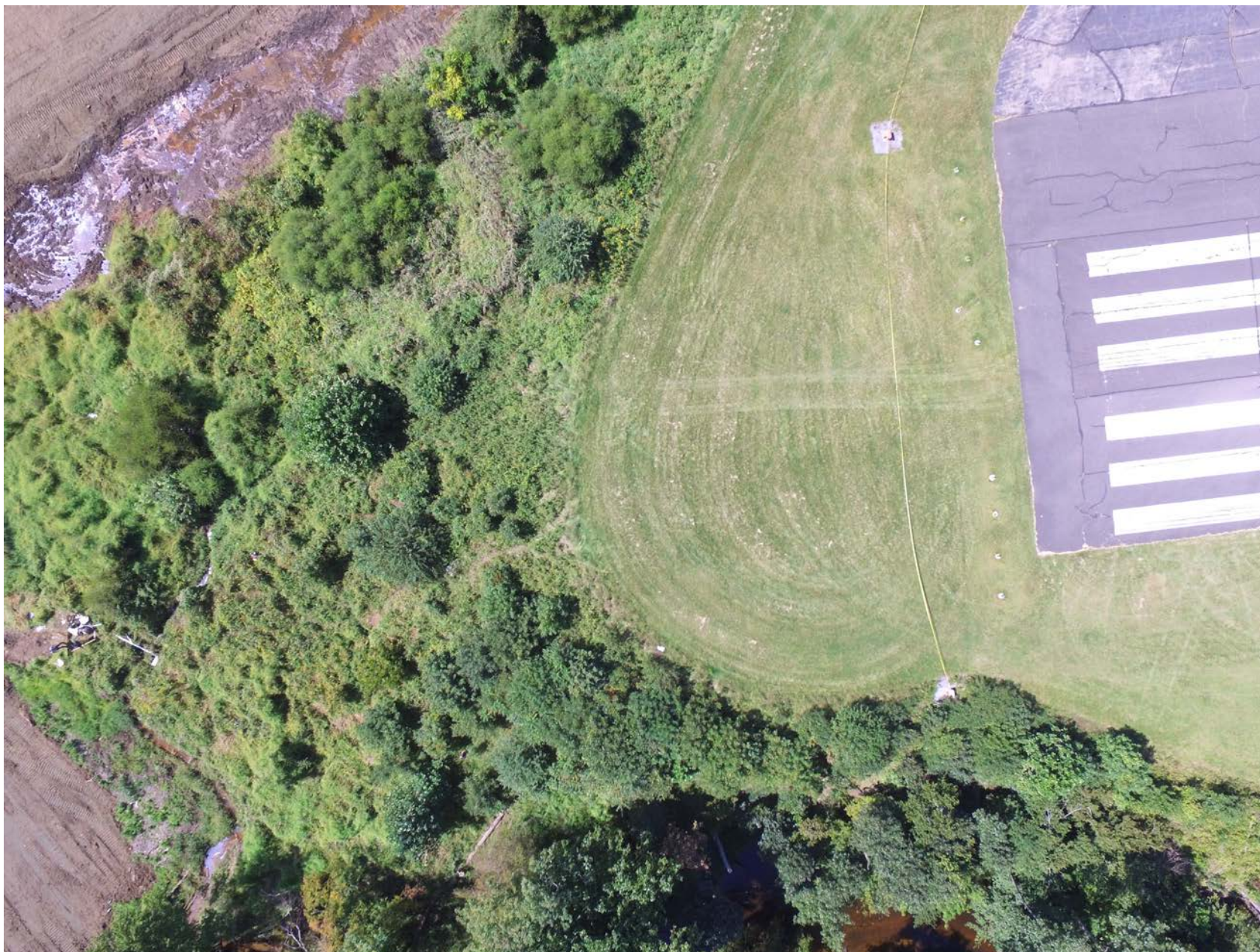
Photo 8 – Overhead view of wreckage in proximity to approach end of Runway 01.