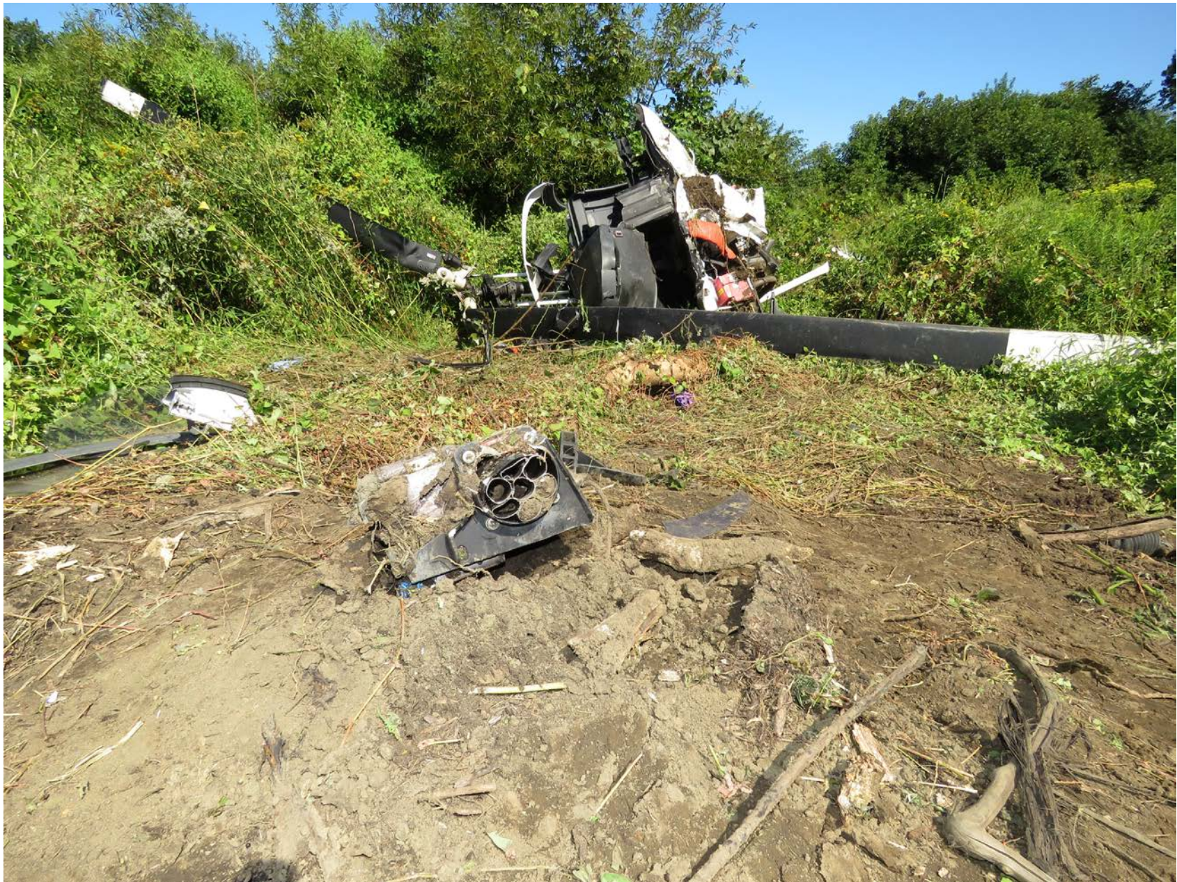
Photo 3 – View of Main Wreckage with Carburetor in Foreground (Lycoming Engines)