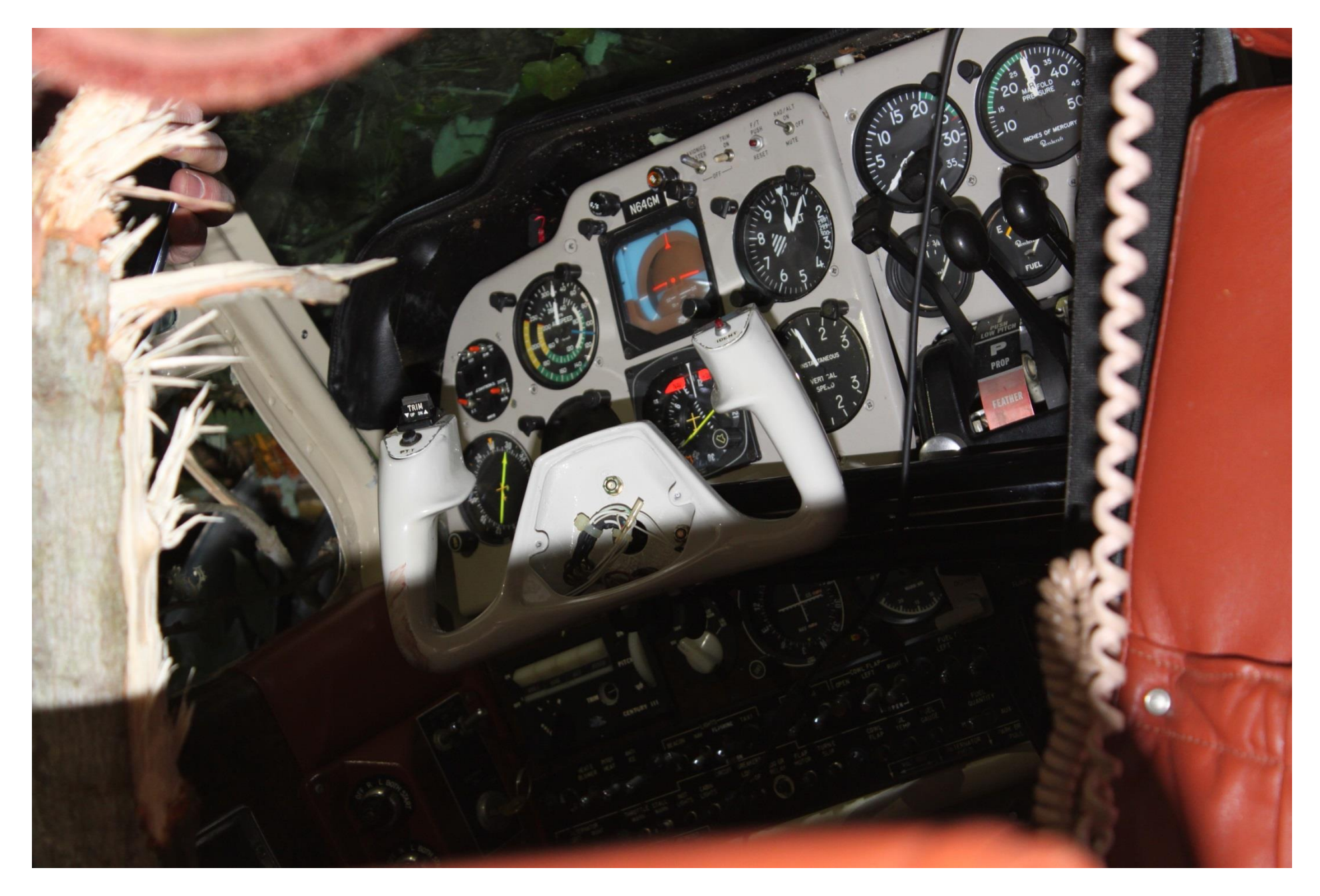
Photo 3 – View from left front pilot seat (note position of flight control yoke)