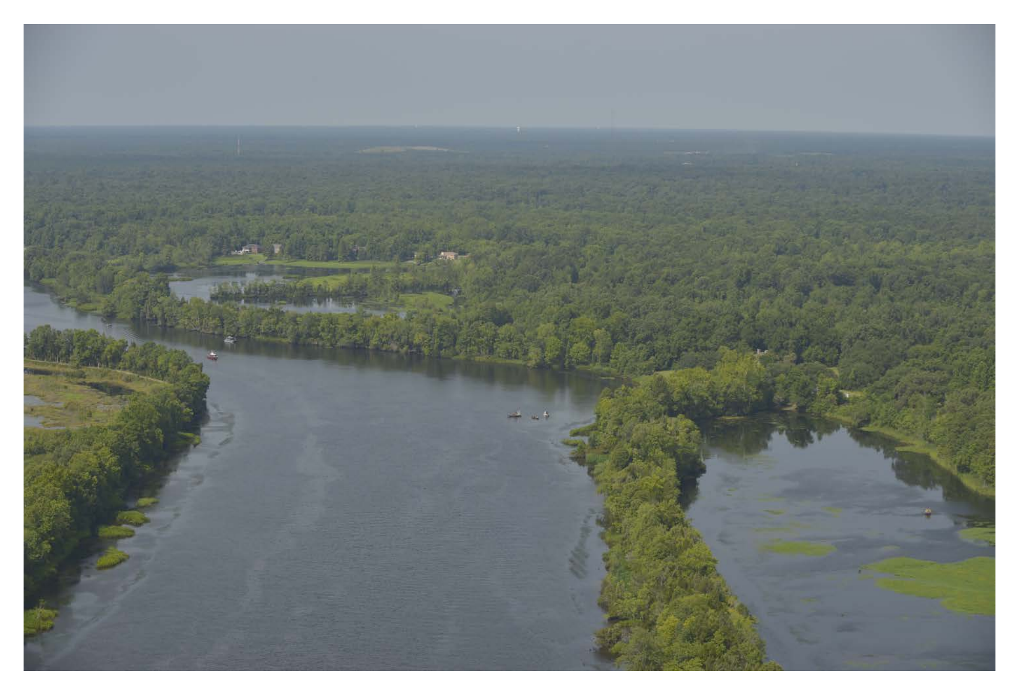
Photo 1 – Aerial View of Collision Location