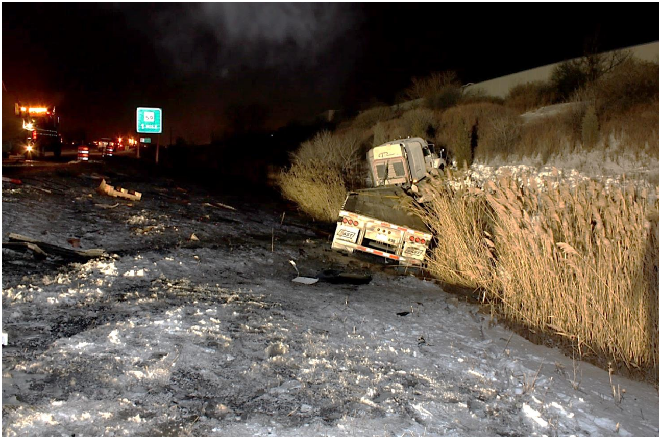
Photo 8 – Accident scene photo looking into the ditch to the south of eastbound Interstate 88, showing a closer view of the 2004 Freightliner tractor and flatbed trailer combination unit at final rest.