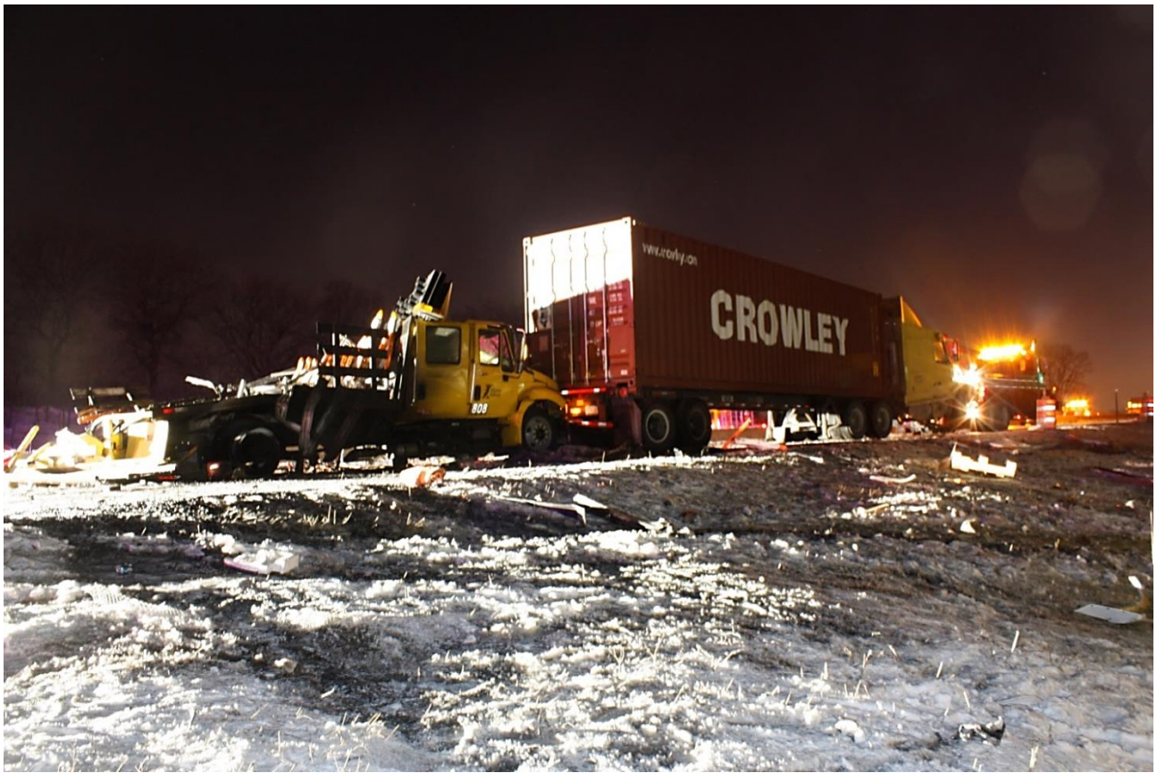
Photo 7 – Accident scene view looking north, up from the ditch. The heavy duty tow truck, disabled intermodal combination unit, and the Illinois State Toll Highway Authority help truck are shown at final rest in the right lane of eastbound Interstate 88.