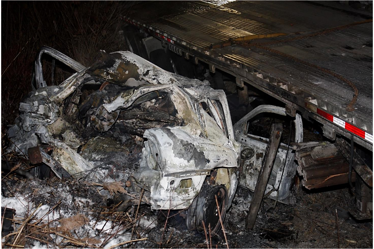
Photo 11 – Accident scene photo showing a rear view of the damage and fire consumption to the Illinois State Police patrol car.