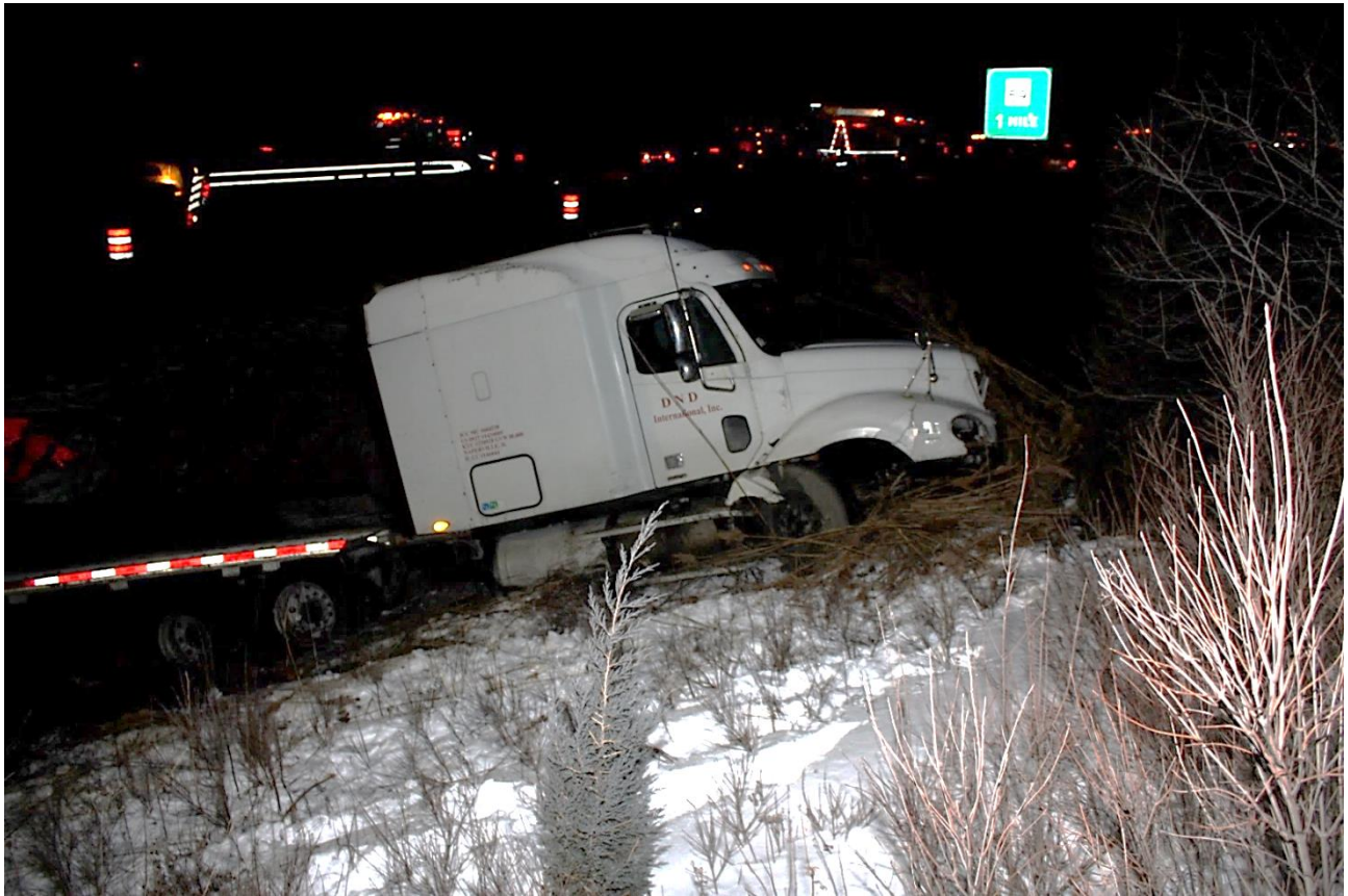
Photo 9 – Accident scene photo showing a closer view of the 2004 Freightliner tractor at final rest.