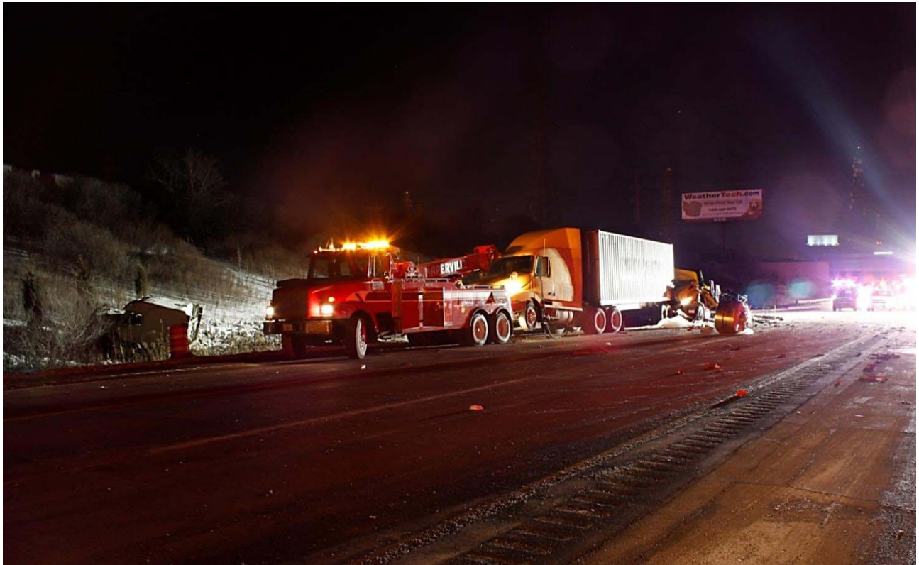
Photo 2 – Accident scene view looking west. The heavy duty tow truck, disabled intermodal combination unit, and the Illinois State Toll Highway Authority help truck are shown at final rest in the right lane of eastbound Interstate 88. The 2004 Freightliner tractor can be seen in the ditch to the south, and one of the steel coils from its flatbed trailer can be seen at rest in the center lane of the interstate.