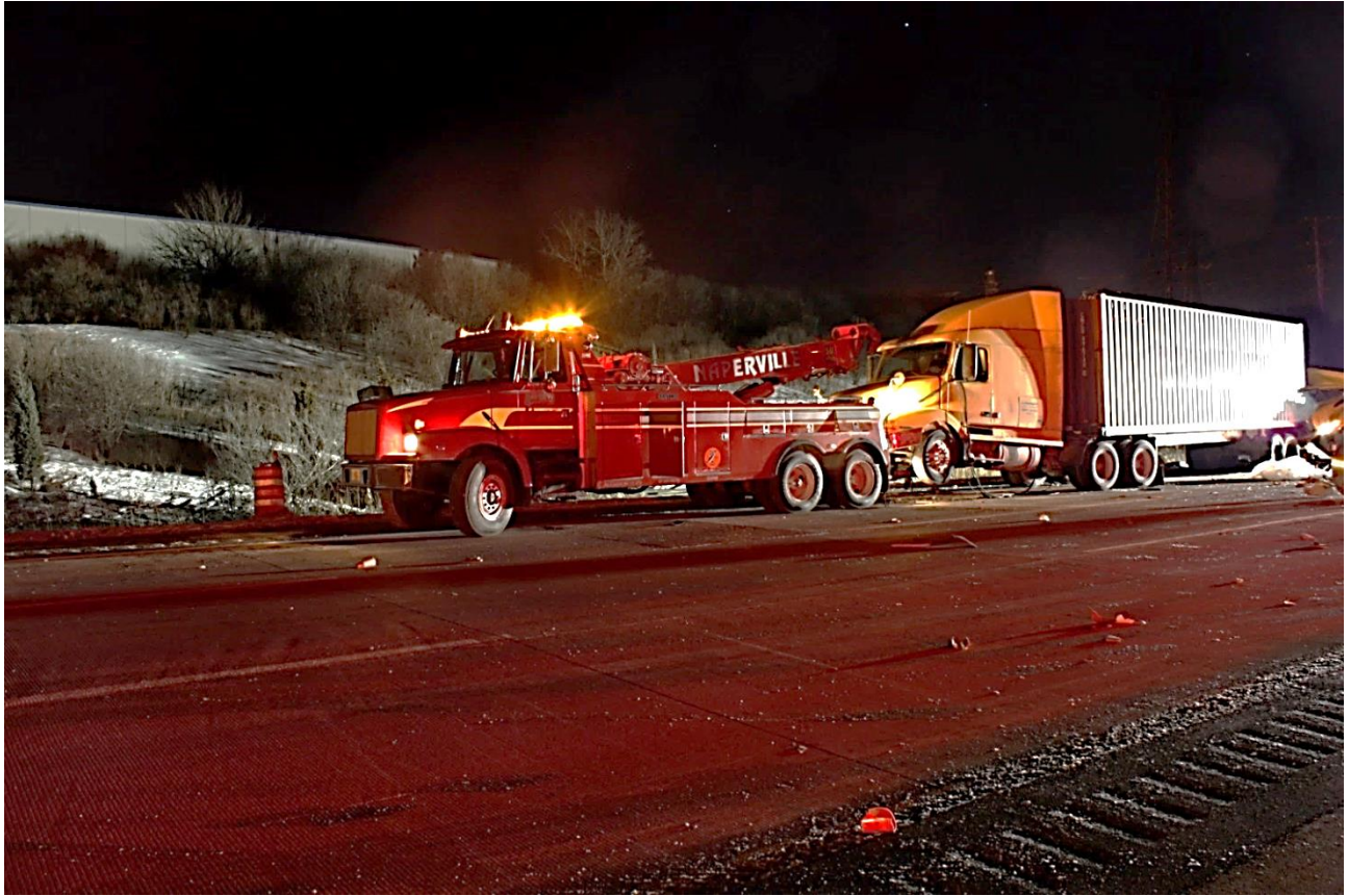
Photo 3 – Accident scene view looking south, showing a side view of the heavy duty tow truck hooked up to the disabled intermodal combination unit