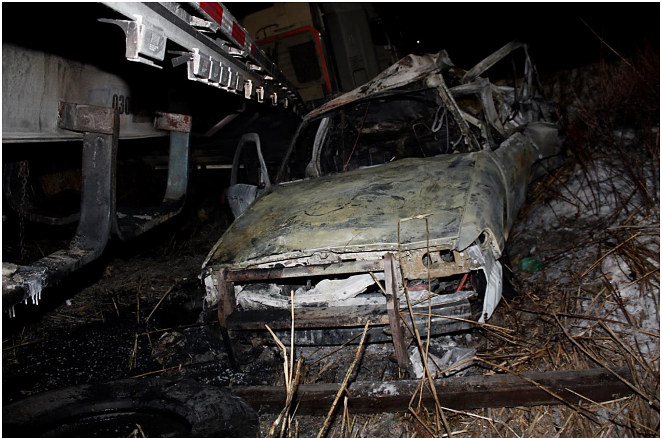
Photo 12 – Accident scene photo showing a front view of the damage and fire consumption to the Illinois State Police patrol car.