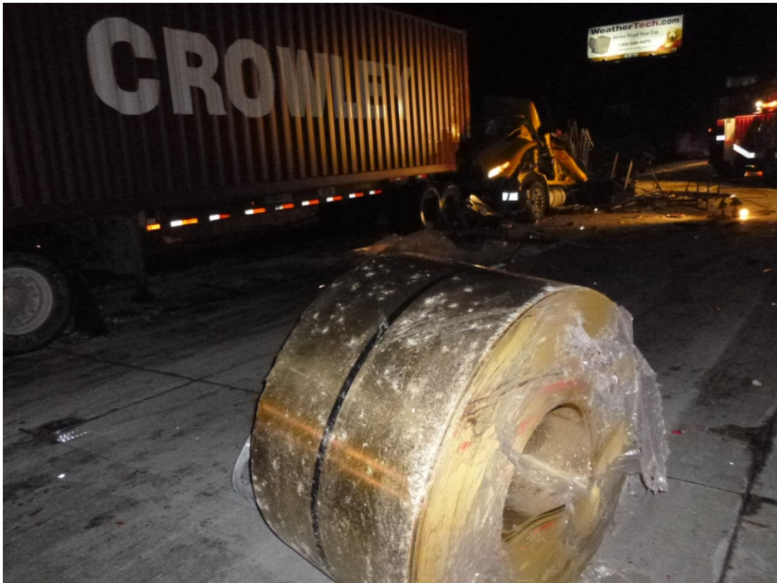
Photo 4 – Accident scene photo showing a closer view of the steel coil at rest in the center lane of the interstate.