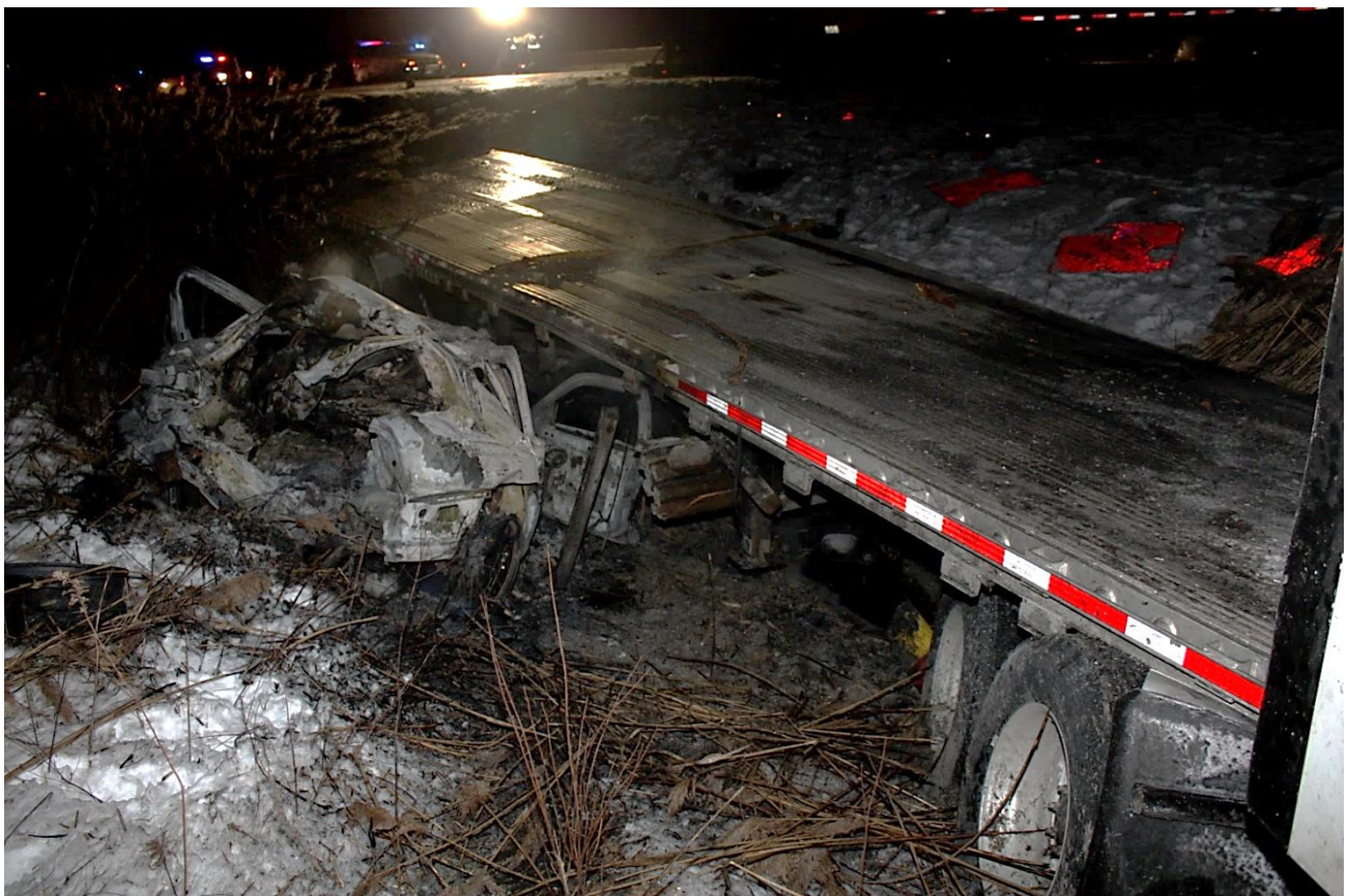
Photo 10 – Accident scene photo showing the location where the Illinois State Police patrol car came to rest, against the right side of the flatbed trailer of the 2004 Freightliner tractor, in the ditch to the south of the interstate.