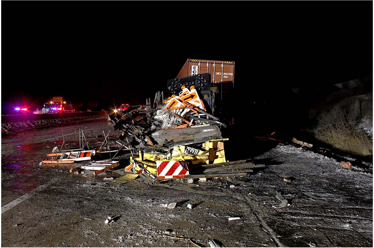
Photo 5 – Accident scene photo showing a rear view of the damage to the Illinois State Toll Highway Authority help truck.