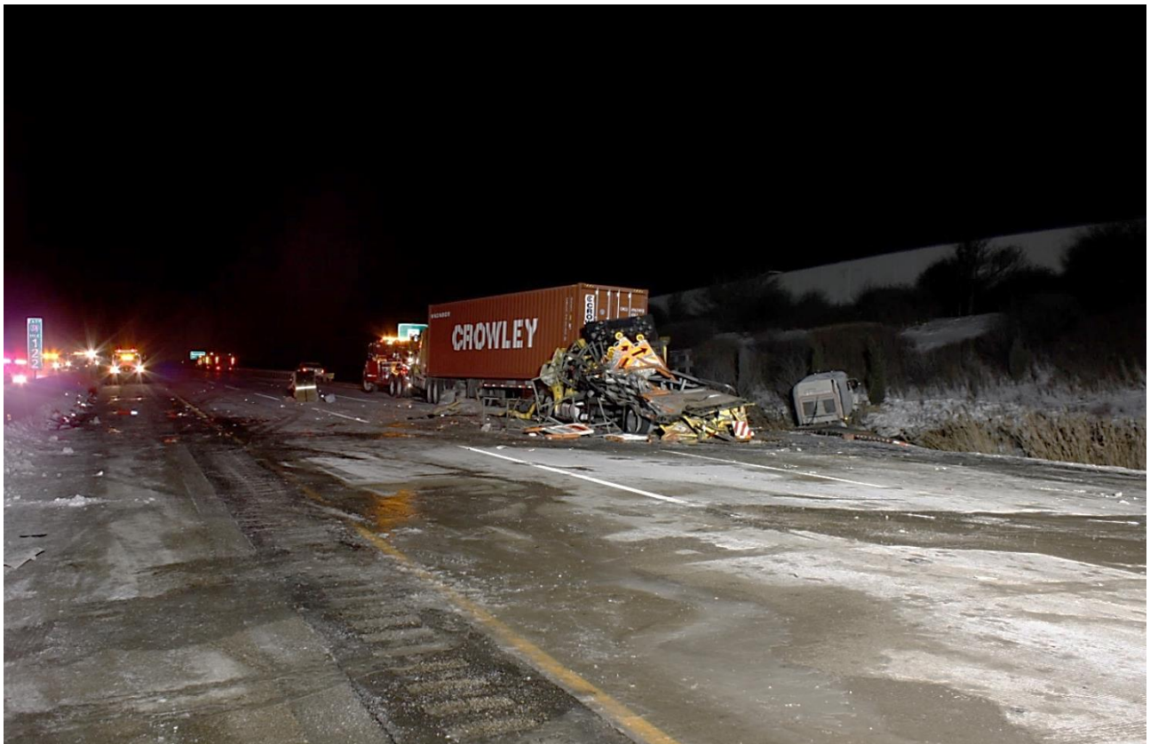
Photo 1 – Accident scene view looking east. The heavy duty tow truck, disabled intermodal combination unit, and the Illinois State Toll Highway Authority help truck are shown at final rest in the right lane of eastbound Interstate 88. The 2004 Freightliner tractor and flatbed trailer combination unit can be seen off in the ditch to the south, and one of the steel coils from its flatbed trailer can be seen at rest in the center lane of the interstate.