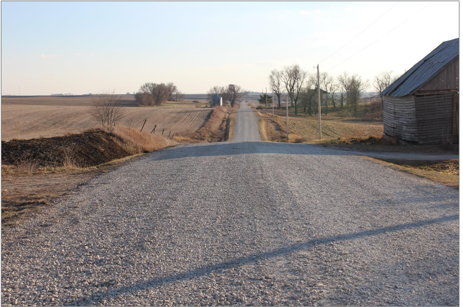
Highway Photograph 2 – Roadway at Crash Location – Facing South