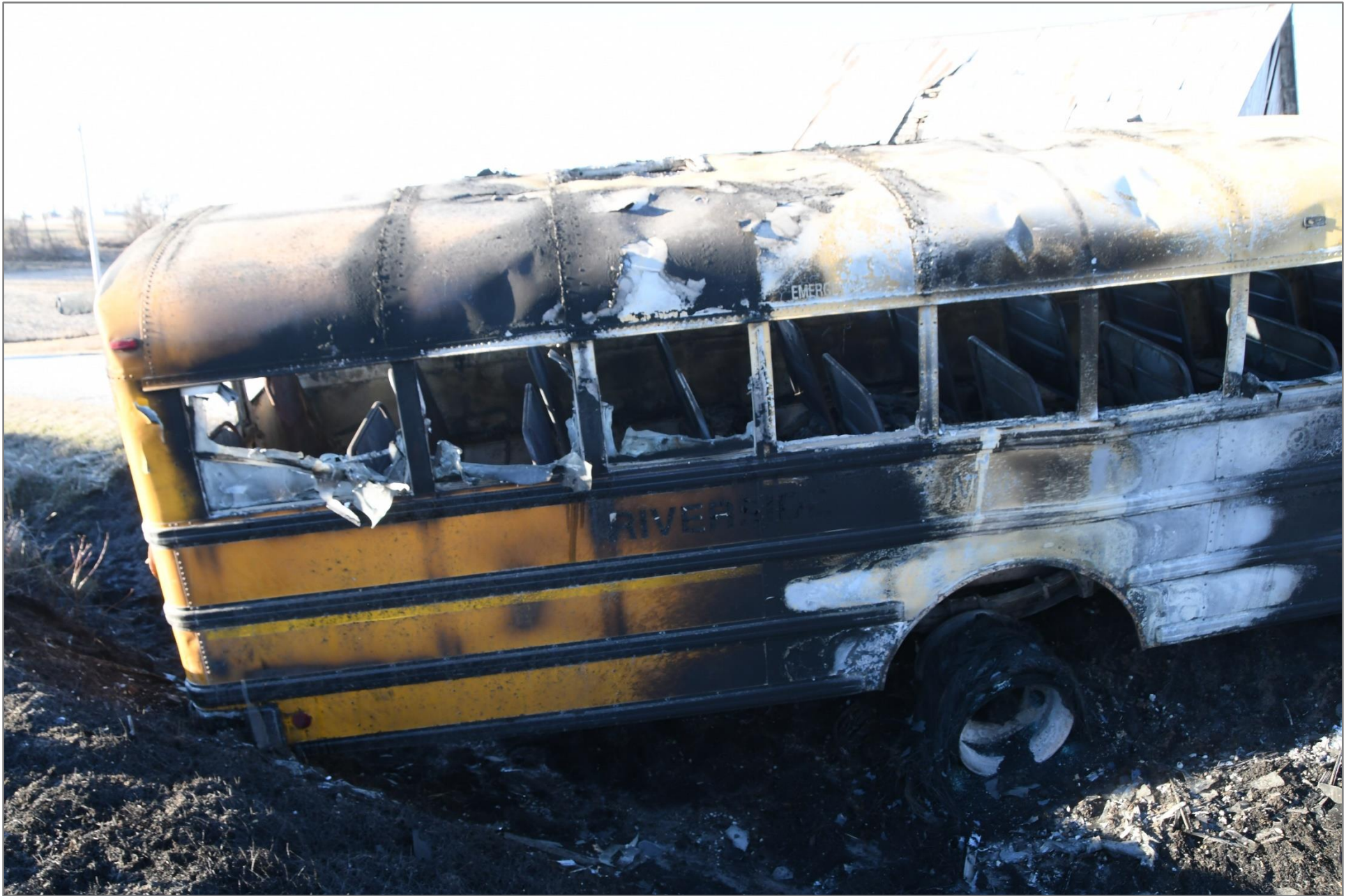
Highway Photograph 6 – Right Rear Corner of School Bus at Final Rest Against the Ditch Backslope Following the Collision and Post-Crash Fire