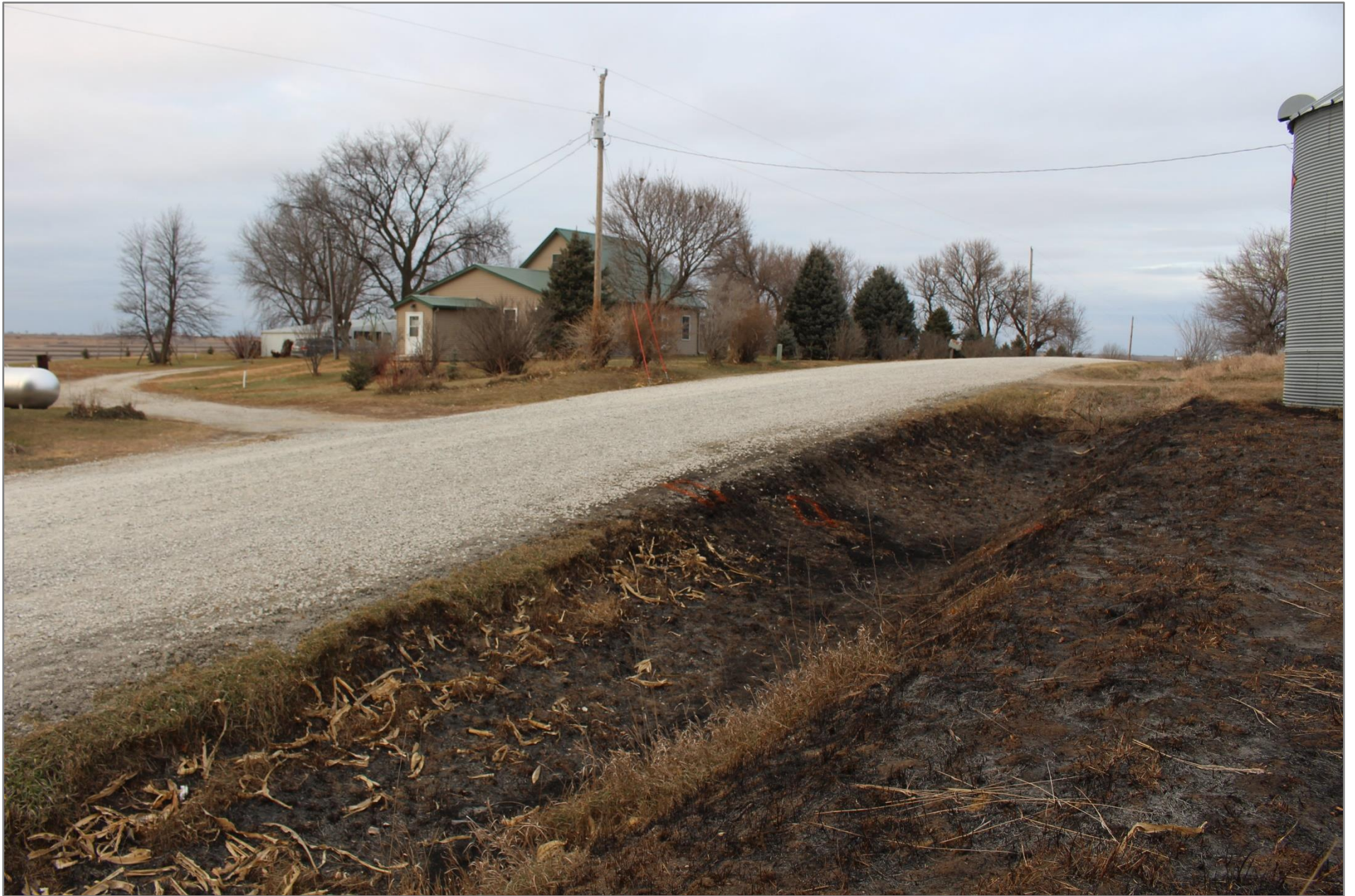
Highway Photograph 1 – Crash Location – Facing Northwest