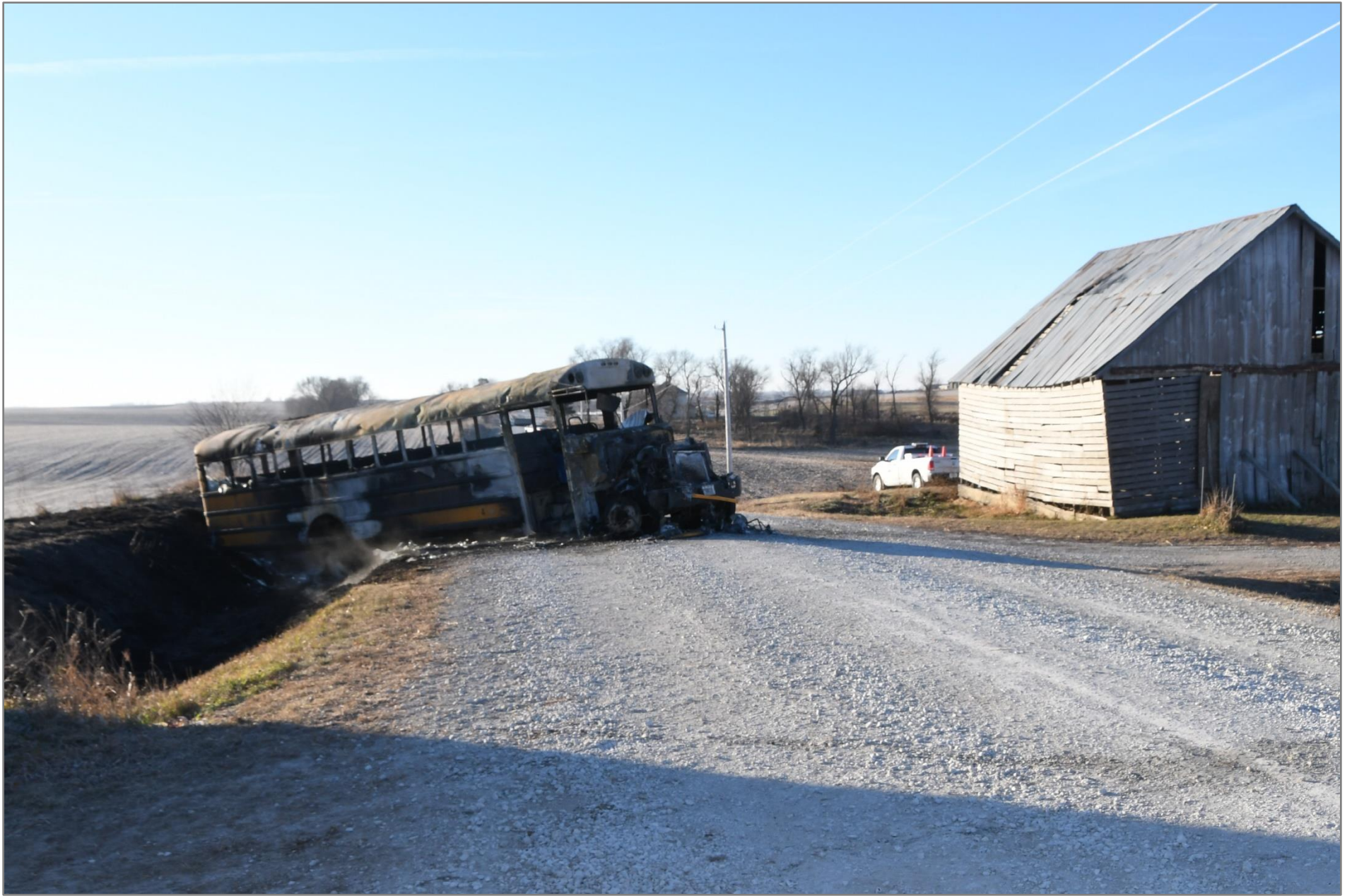
Highway Photograph 3 – School Bus at Final Rest Following the Collision and Post-Crash Fire – Facing South