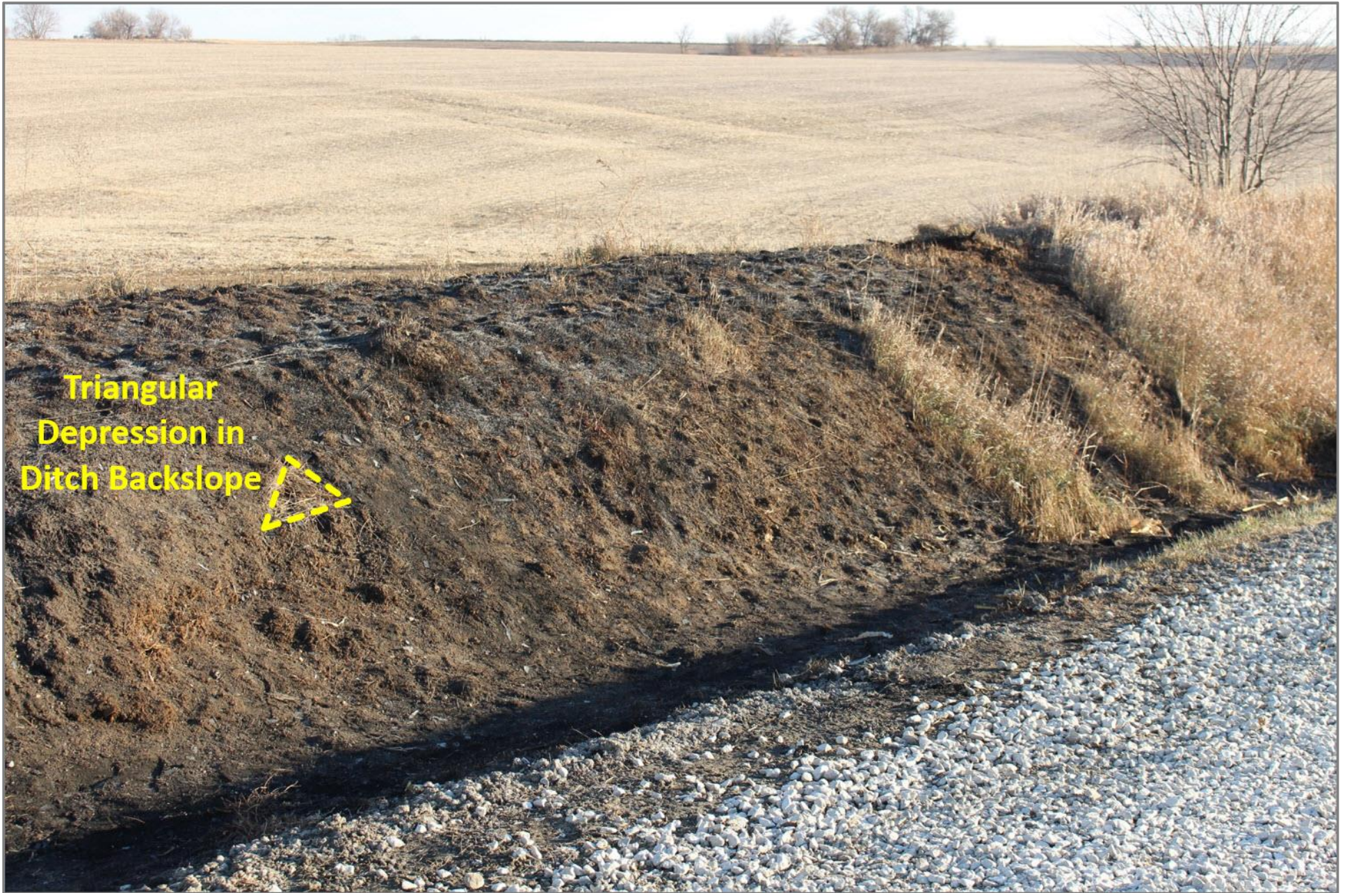
Highway Photograph 5 – Triangular Depression in Soil of Ditch Backslope – Facing Southeast