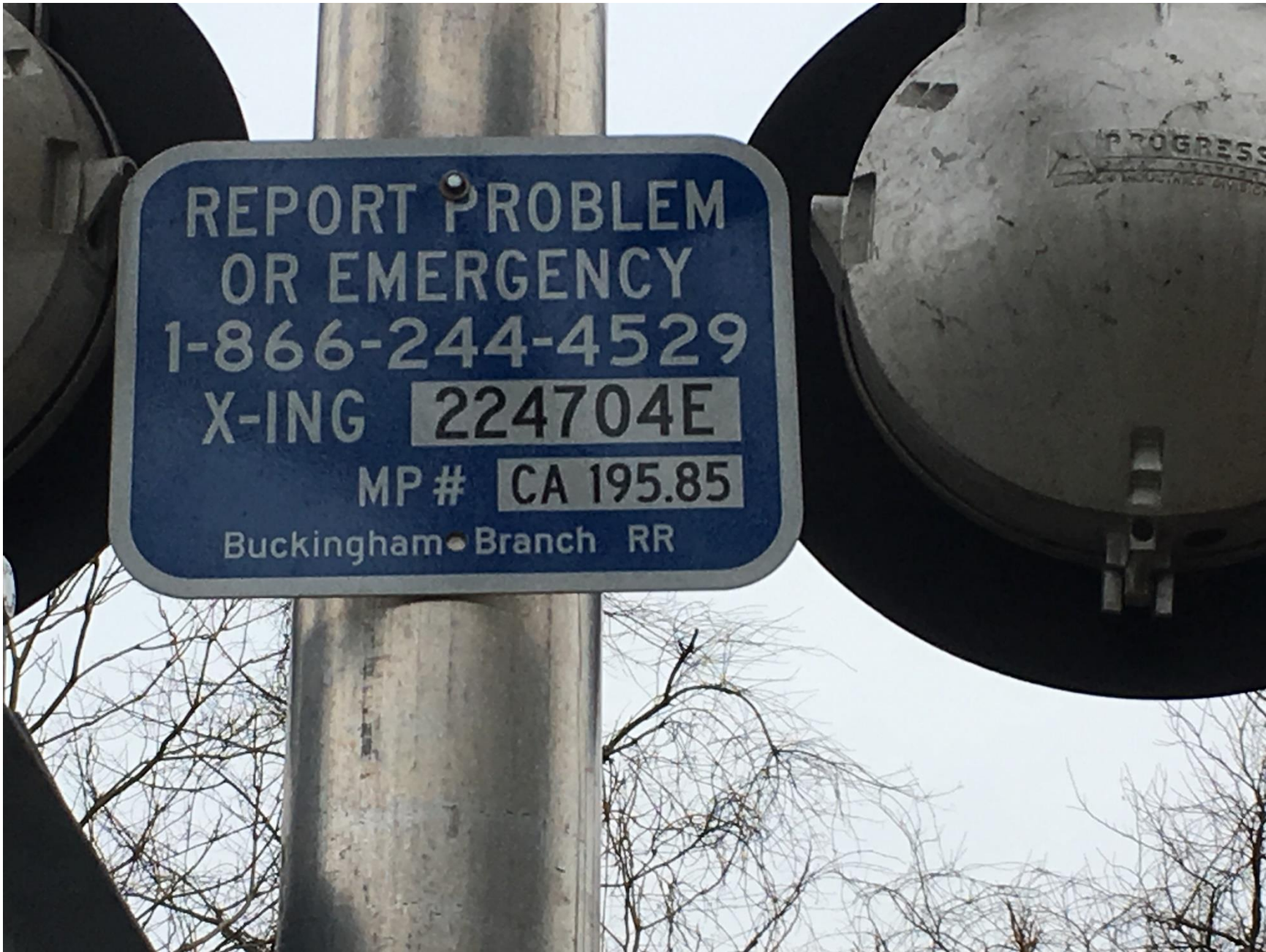
Highway and Rail Crossing Photograph 7 – Signal Mast-Mounted Emergency Notification Sign