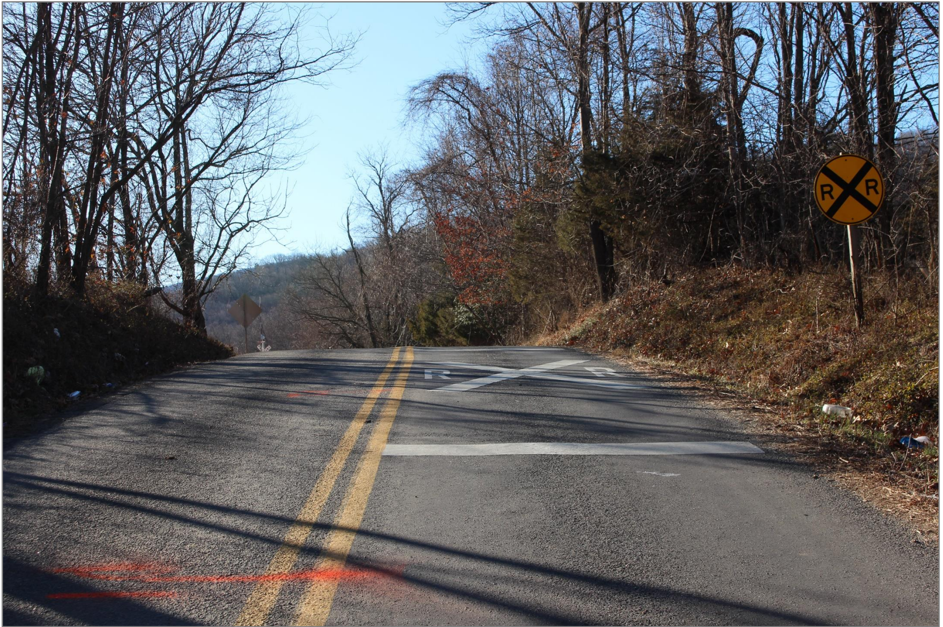
Highway and Rail Crossing Photograph 4 – Grade Crossing Advanced Warning Sign with Grade Crossing Pavement Marking – Facing West