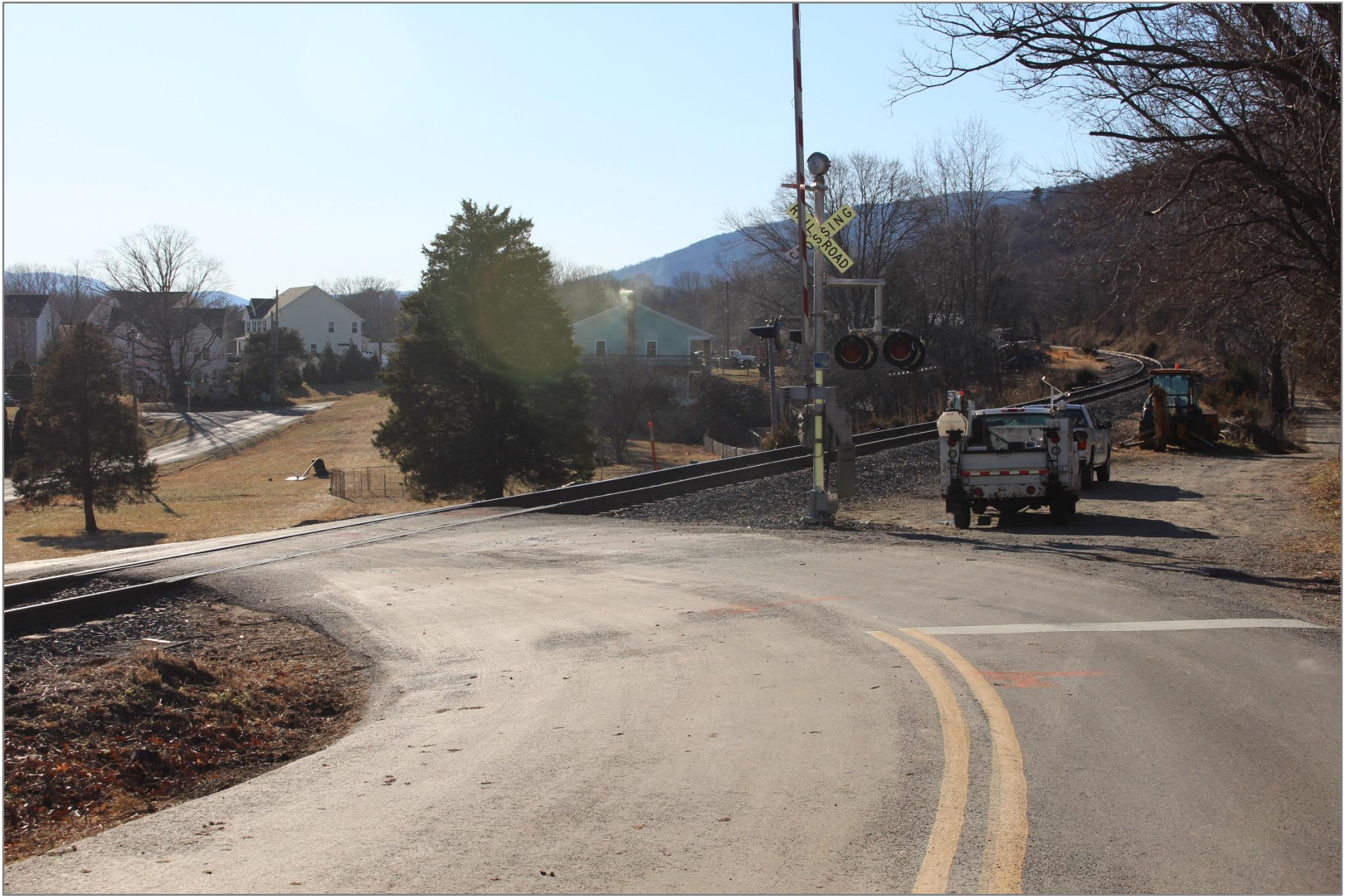
Highway and Rail Crossing Photograph 1 – Lanetown Road, North of Grade Crossing – Facing South-Southwest