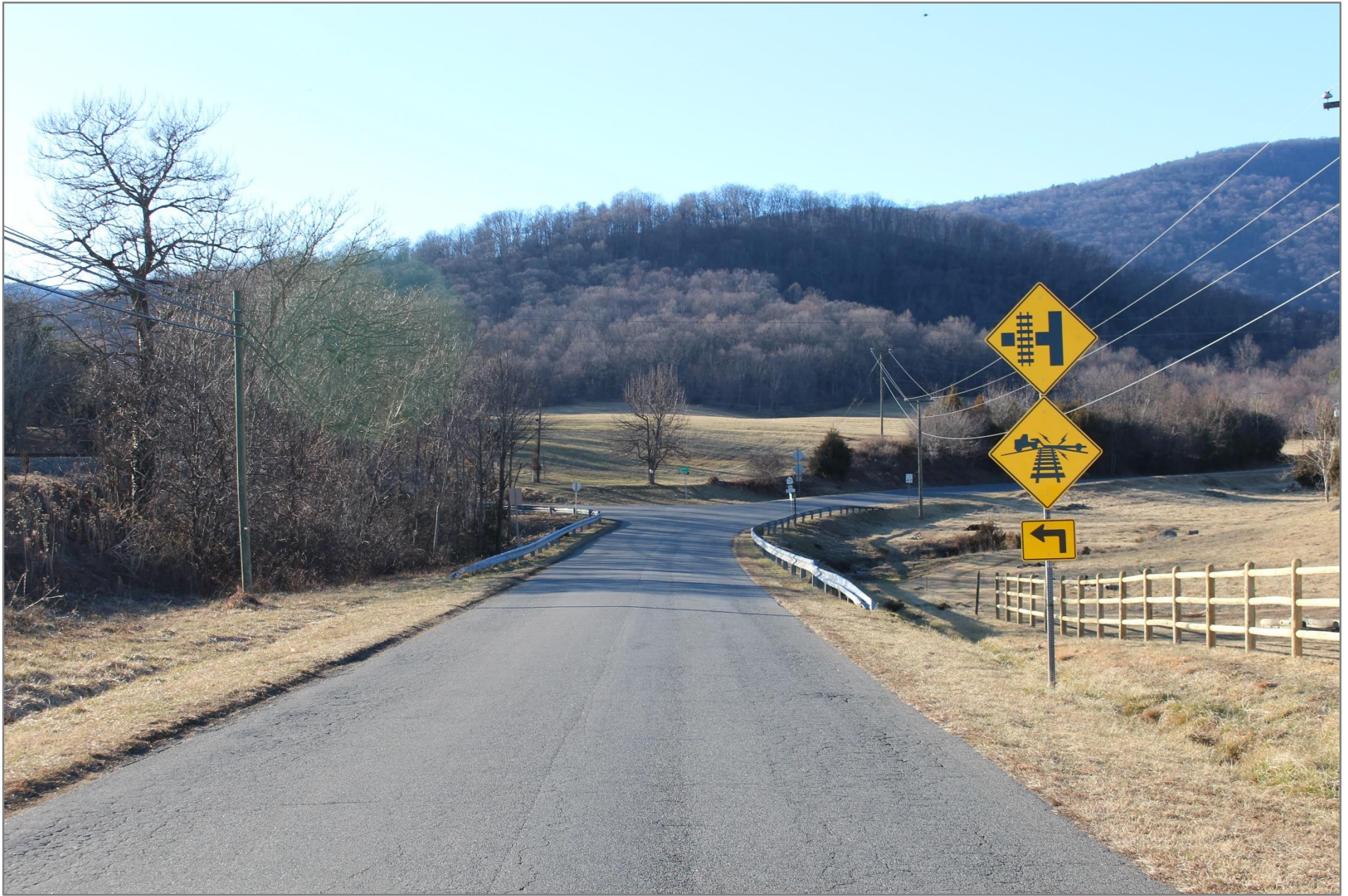
Highway and Rail Crossing Photograph 2 – Parallel Grade Crossing Warning Sign and Low Ground Clearance Grade Crossing Warning Sign with Supplemental Arrow Plaque on Railroad Avenue – Facing West-Northwest