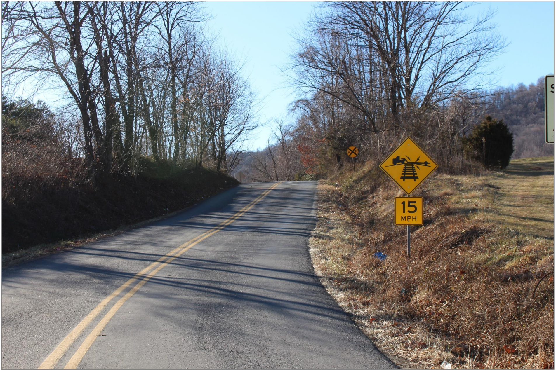
Highway and Rail Crossing Photograph 3 – Low Ground Clearance Grade Crossing Warning Sign with 15 mph Advisory Speed Plaque – Facing West