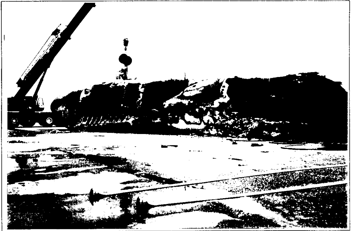
Figure 12-2. View of Stations, 1L and 2L; facing cockpit entrance door.