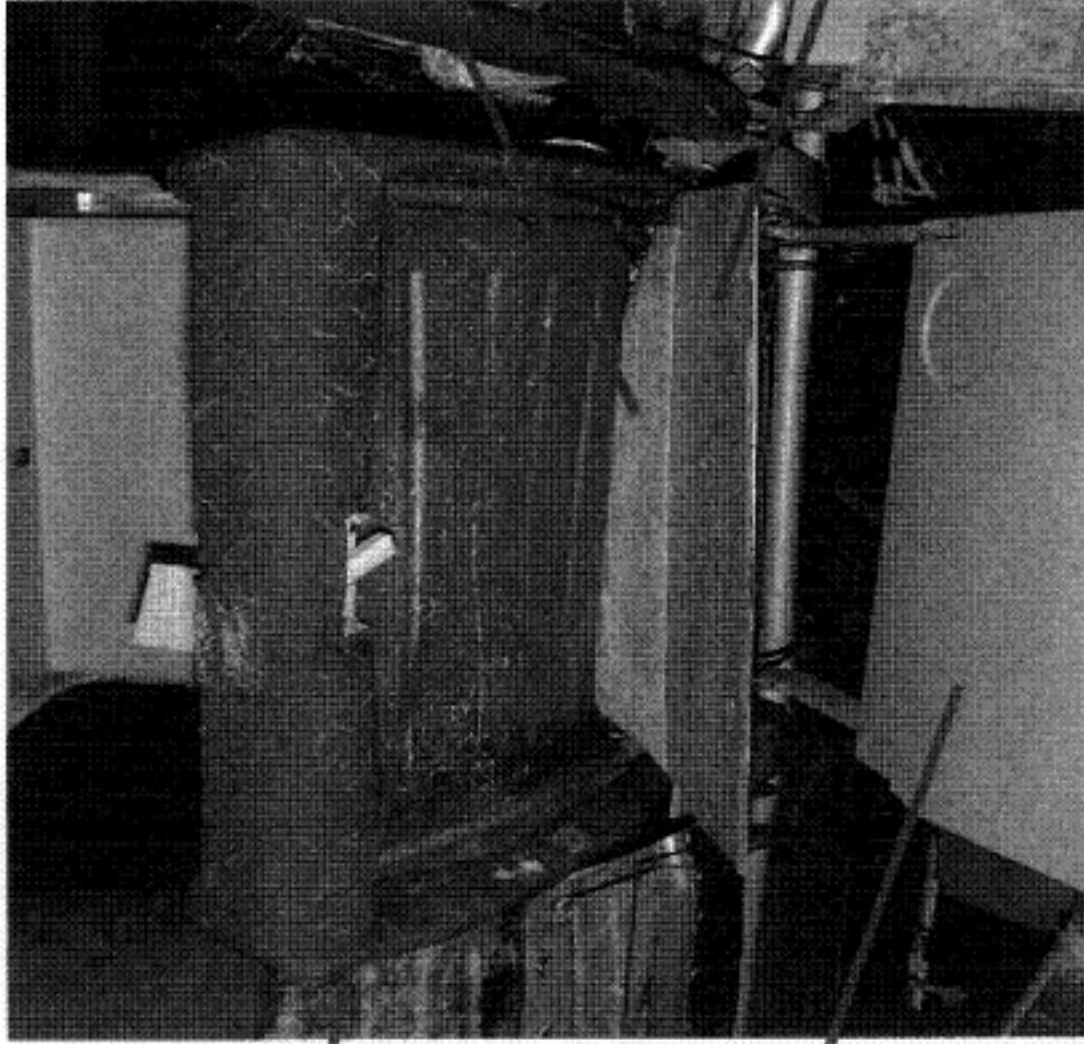
Metal frame with red/brown substance (Label A, Figure 1)