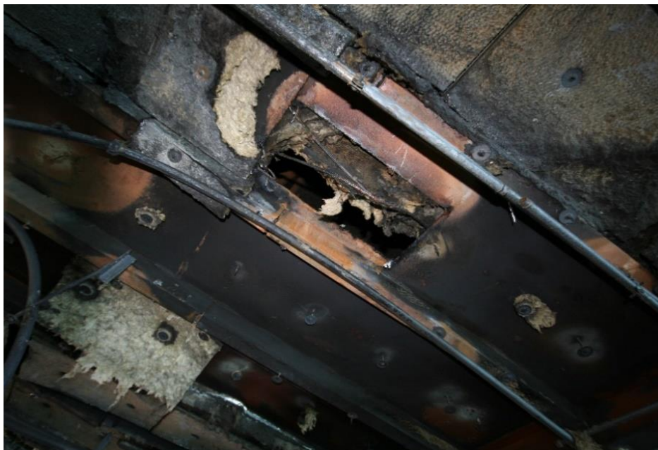
Rectangular cut-out for air-conditioning duct from Texas deck into wheelhouse.

While digging through debris from the fire, investigators found a 20-inch by 9-inch rectangular penetration that had been cut in the overhead of the Texas deck into the wheelhouse for installing an air-conditioning duct. According to the vessel file, this modification (cut-out) was not indicated in any of the vessel's approved plans and the Coast Guard was not advised of the modification. There were no closing devices such as dampers in the ductwork to maintain structural fire protection. The lack of dampers and closing devices allowed the fire to communicate naturally in an upward direction and toward the additional oxygen source in the wheelhouse.