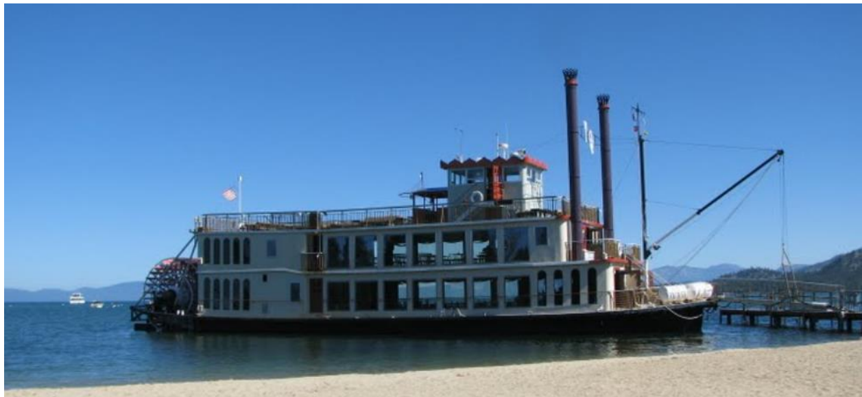
Tahoe Queen in 2011 on Lake Tahoe.

About 0730 on August 16, 2016, a fire broke out on the upper deck of the passenger vessel Tahoe Queen as it was alongside its home pier on Lake Tahoe undergoing extensive maintenance and repairs. The fire destroyed the wheelhouse and most of the upper deck. Two crewmembers suffered minor injuries; both were treated and released the same day. There were no reports of pollution. The vessel was declared a constructive total loss, valued at $4.8 million.