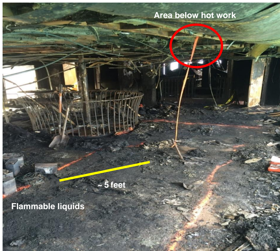
Texas deck, showing the location of painting supplies below the hot work area where welding was being conducted.

Throughout the project, contractors used the fire-resistant blankets to protect surfaces under and around hot work operations. However, both the painters and the welders stated that the painters also used these blankets as drop cloths to catch dripping paint, and, at times, the blankets were used to cover flammable liquids being stored on the Texas deck. This resulted in the fire-resistant blankets absorbing flammable solvents. On the day of the fire, the blankets had been used under the hot work area. The fire-resistant properties of these blankets were likely compromised after being permeated by the flammable liquids from the painting supplies.