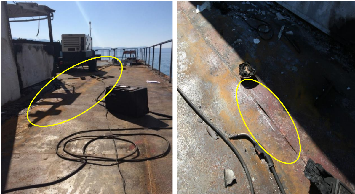
Left: Port side of hurricane deck where welding was being conducted. Right: Seam that was being welded when the fire started below.

About 0725, a welder began grinding and welding a seam on a replacement steel plate that had been inserted into the deck on the port side of the hurricane deck, adjacent to the wheelhouse. The area of hot work was located directly above the Texas deck, which was a furnished passenger space with tables, a stage, a lounge, and a bar. 1 During the repair period, the painters stored supplies such as solvents (acetone, xylene, denatured alcohol, and paint thinners), marine coatings, oil-based paints, and soiled rags on the Texas deck. Divers also used the Texas deck to store their equipment, which included compressed air bottles and dive gear. Several lifejackets were stored in the overhead of the Texas deck, directly below the hot work area. The welder stated that prior to welding, he had created a “bowl” shape using fire-resistant blankets directly underneath the hot work area to catch any sparks or welding slag that might fall from the deck above. There was no power aboard the laid-up vessel and no forced ventilation in the work areas. No fire watch was assigned to the hot work area on the hurricane deck nor to the deck below in the passenger space of the Texas deck.