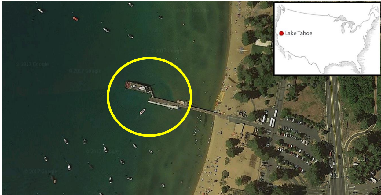
Zephyr Cove, home port of the Tahoe Queen and location of fire.

In December 2015, the Tahoe Queen was taken out of service to undergo a long-term maintenance project that included engine upgrades, steel repairs, cosmetic upgrades, preventive maintenance, and painting. The work was conducted at the vessel's dock in Zephyr Cove in the southeast corner of the lake because there was no dry-dock or shipyard facility on Lake Tahoe. A local general marine contractor was contracted to conduct the steel work on the vessel, and a local painting contractor was hired to carry out the painting during this repair period. The painting contractors worked intermittently aboard the Tahoe Queen project concurrently with the general contractor.