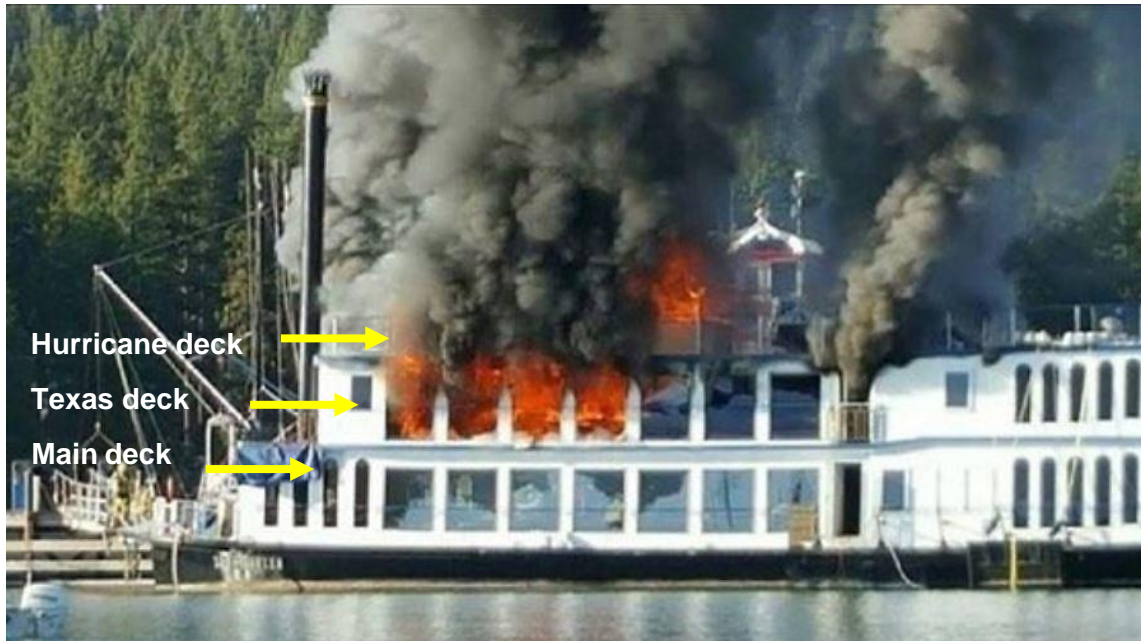
Fire aboard Tahoe Queen .

into the wheelhouse through an air-conditioning duct. The duct did not have dampers or closing devices.