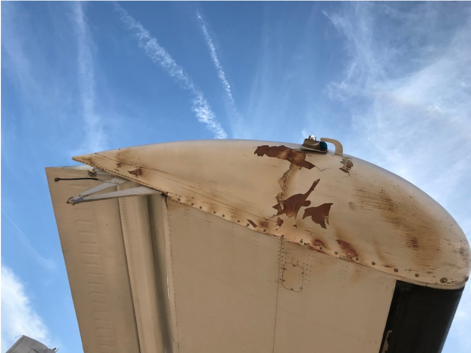
Figure 1 - Right Wingtip and Aileron