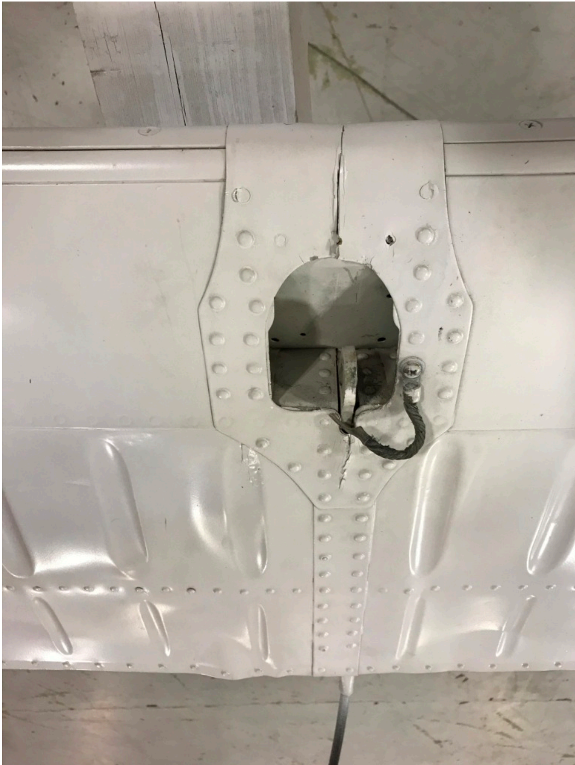
Figure 3 - Right Wing Aileron Wrinkles and Cracks