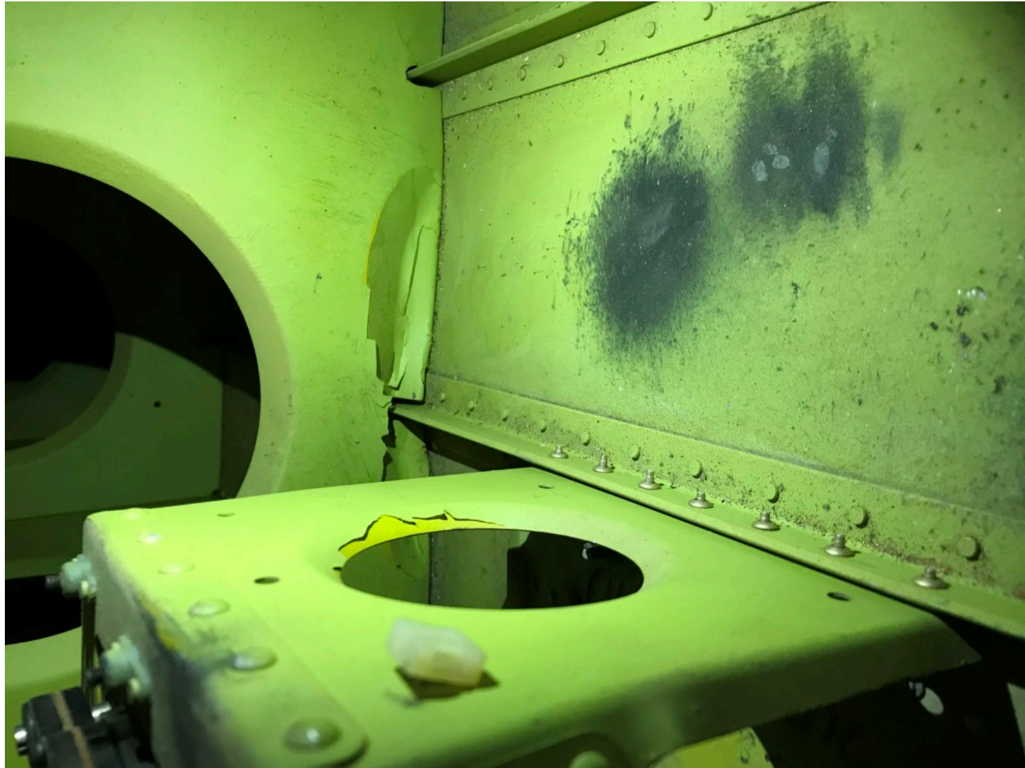
Figure 2 - Interior of Right Wing