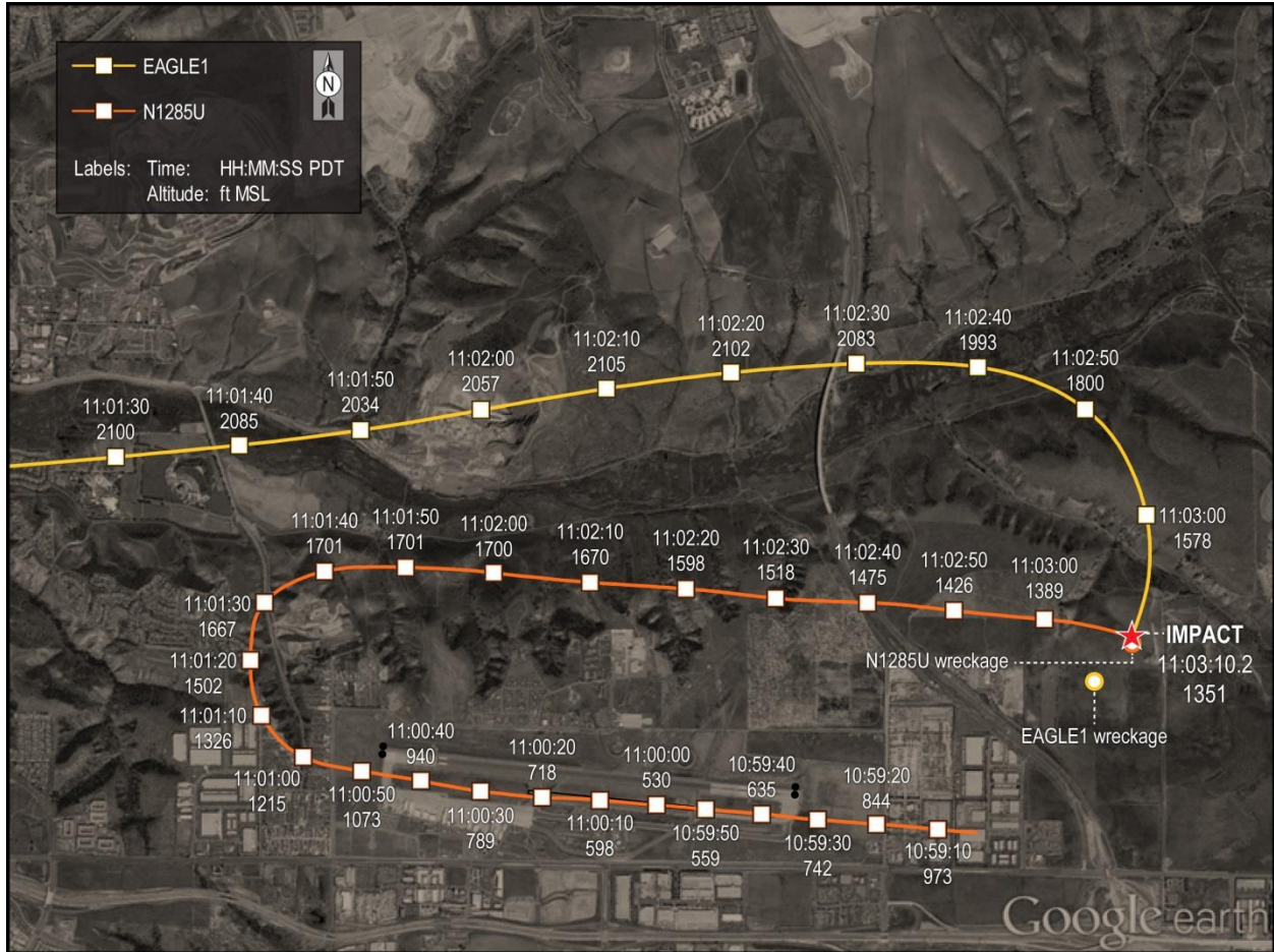
Figure 3. Calculated flight tracks of Eagle1 and N1285U.