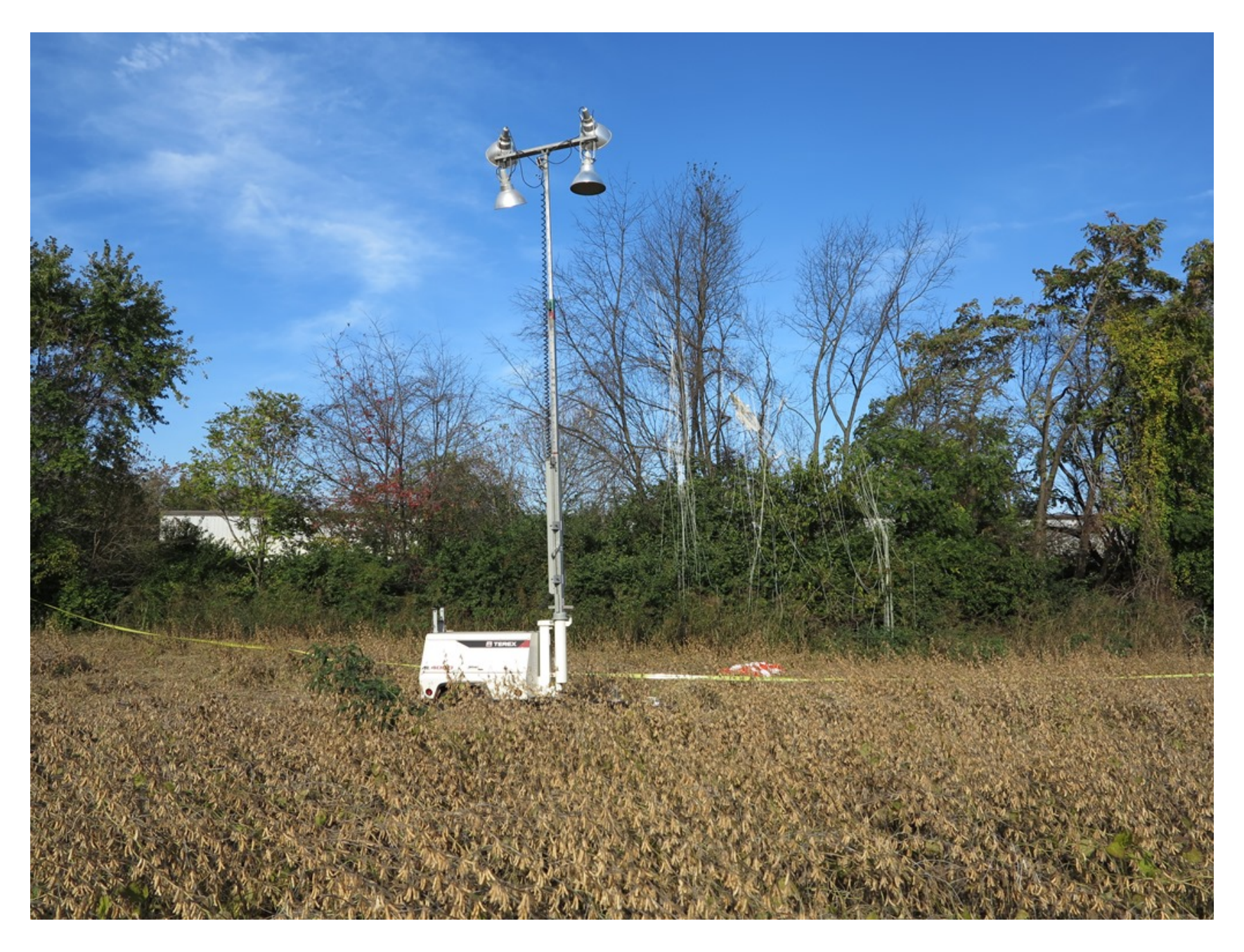
Photo 1 – View of BRS Parachute Risers Suspended in Trees Above Airplane Wreckage (Robinson)