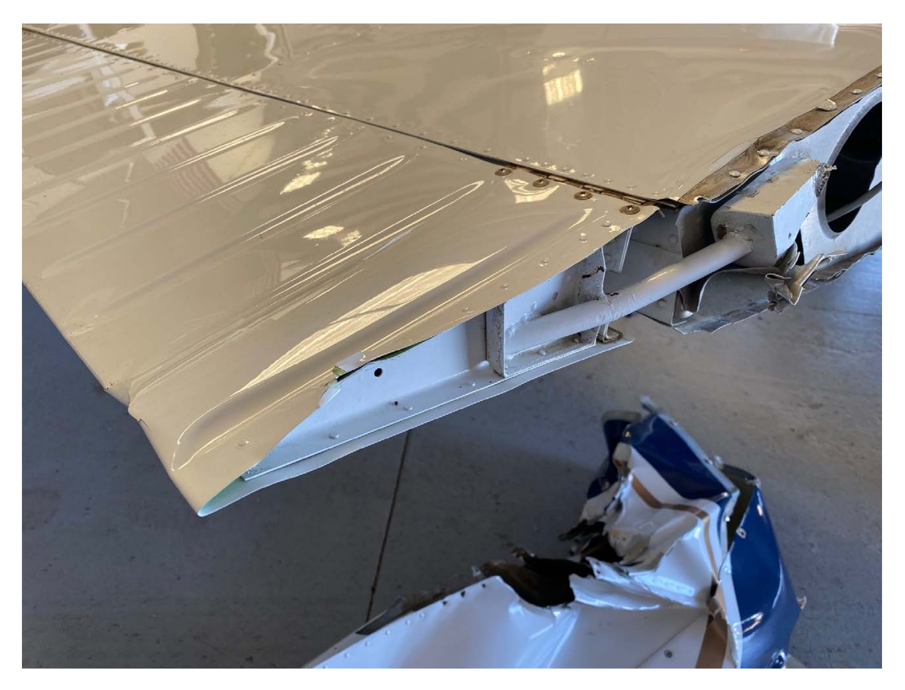
Photo 1 – View of right wing damage