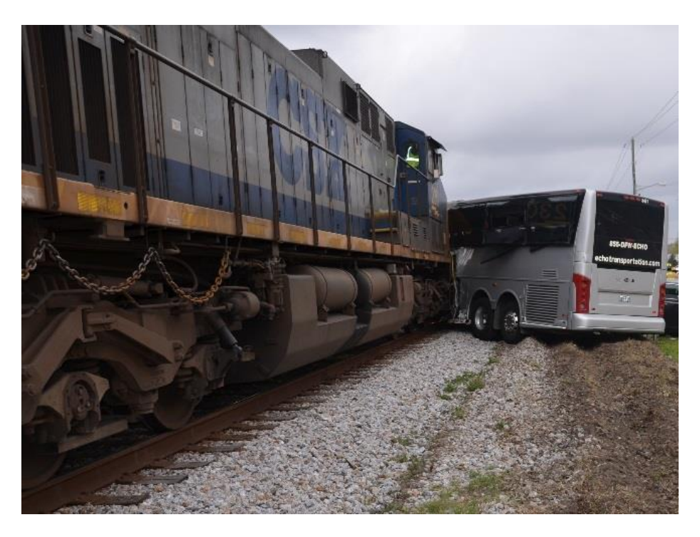
Figure 2. Motorcoach and train at final rest

NTSB investigators along with personnel from the Biloxi Police Department documented the mechanical condition of the motorcoach, the crash location, and the physical characteristics of the crossing. The track and operational characteristics of the crossing signals were also examined and documented. NTSB investigators continue to examine issues related to the railroad grade crossing signage and maintenance, as well as the crashworthiness of the motorcoach. Investigators are also following up with additional passenger and witness interviews, and gathering factual information related to motor carrier operations, driver and train crew experience, hours of service, and trip routing.